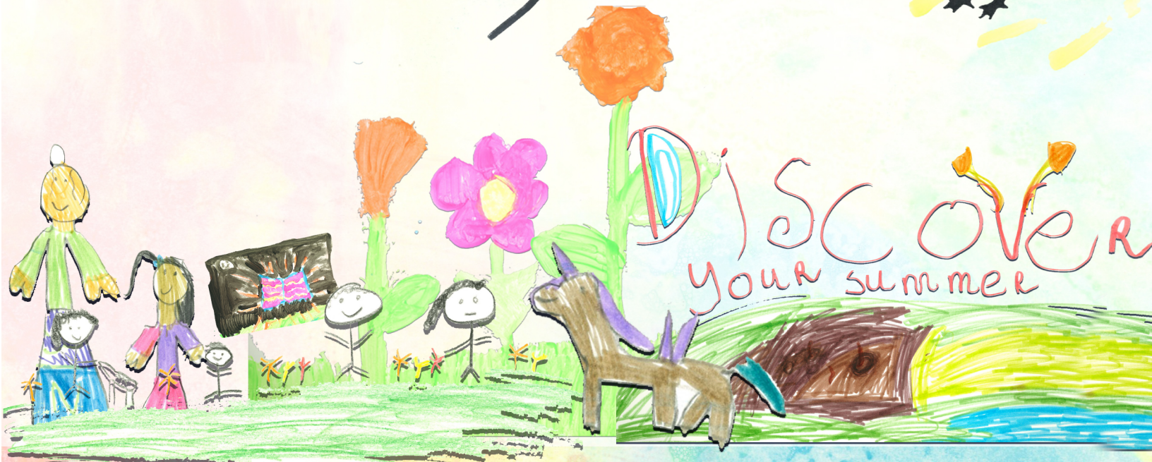
A Collage of Paintings from the Artistic Minds and Winners of Our Children's Room "Discover Your Summer" Poster Contest.