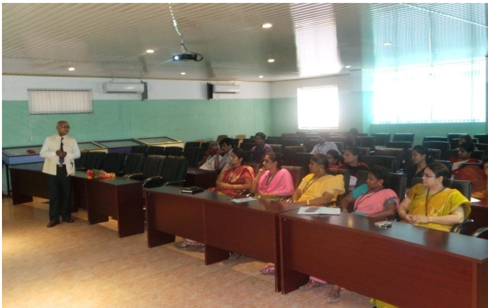
Resource Person interacting with participants regarding challenges in Nano Electronics domain