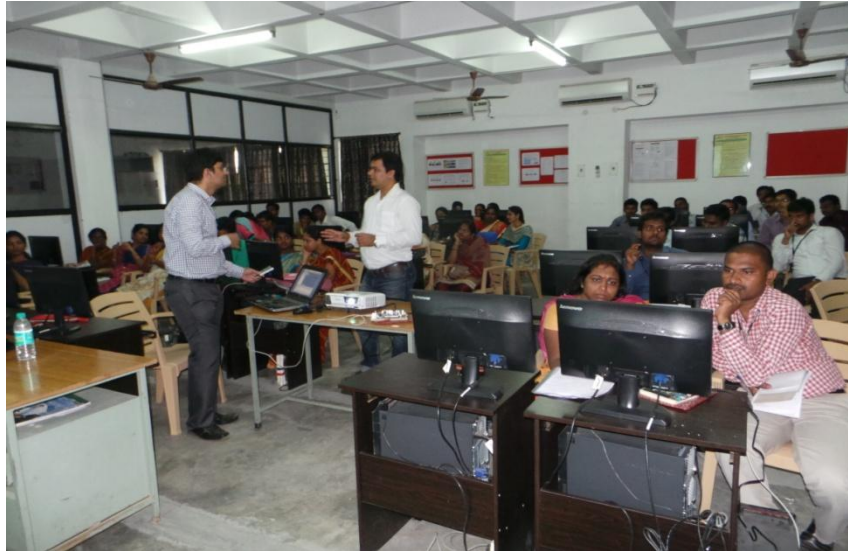
Hands on Training for FPGA Implementation using Spartan3E Xilinx FPGA Tools