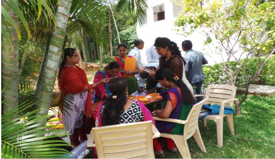
Workshop Registrations on 22 Aug. 2016