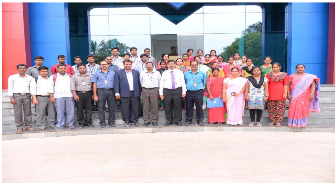
Participants (External & Internal) group photo