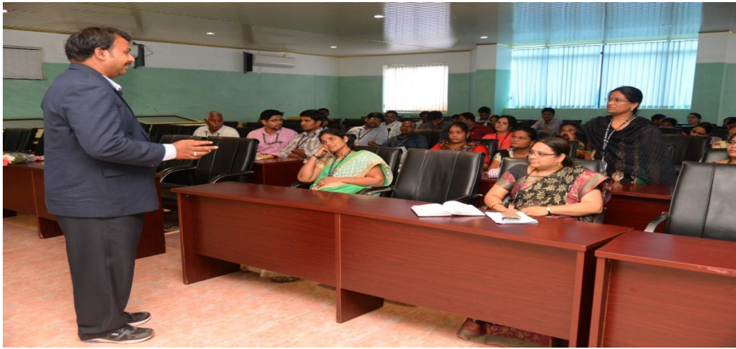
Participants clarifying their research queries