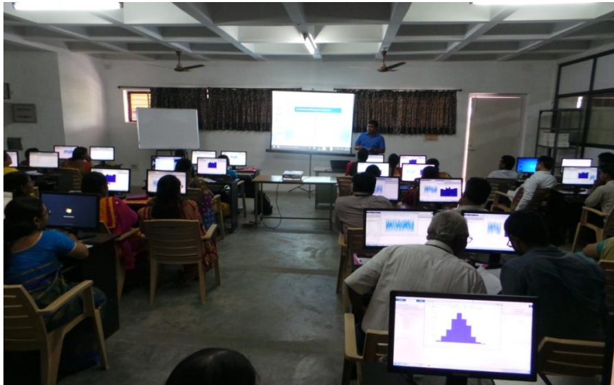
Hands on Training in MATLAB for System Identification