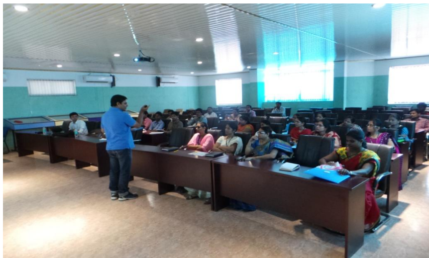
Participants interacting with Resource person on 23 Aug. 2016