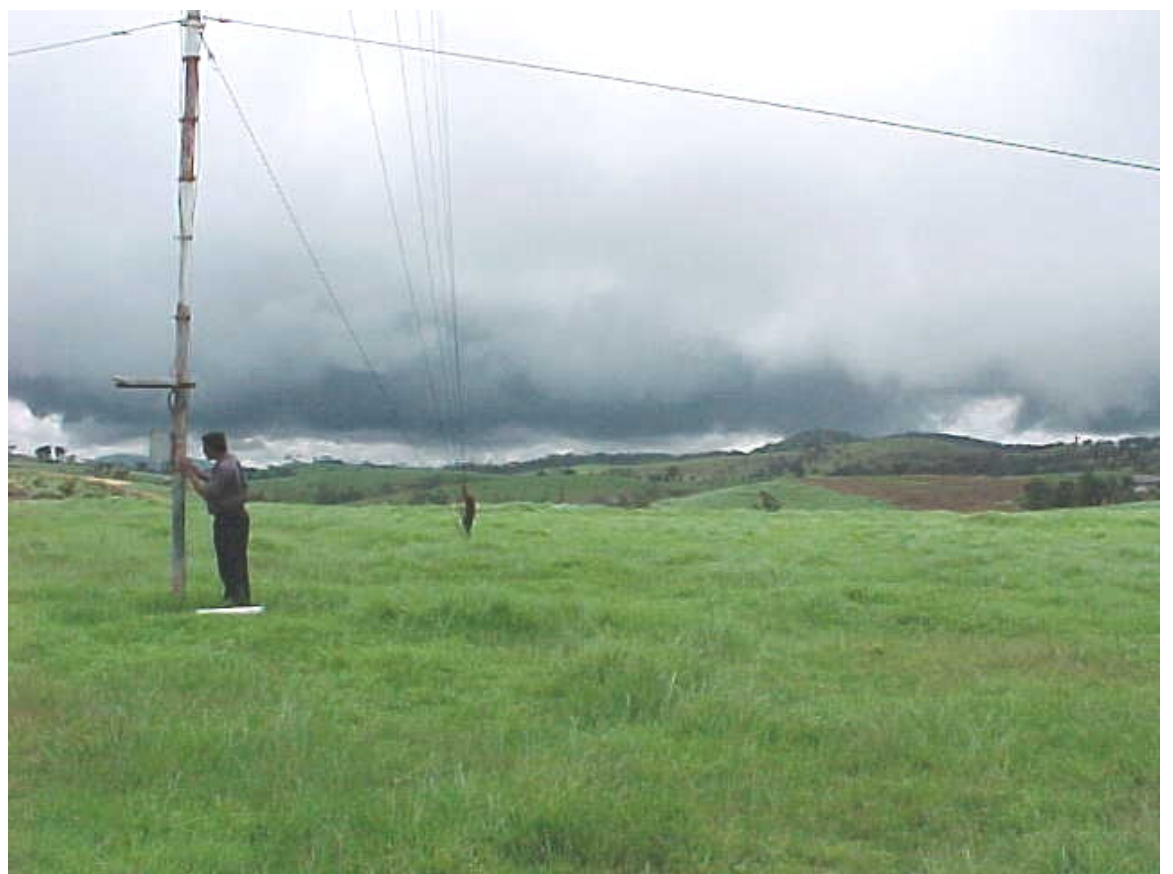
Figure 5-5. Ambewela Cattle Farm Meteorological Site – Southwest View

The Ambewela cattle farm meteorological tower is located on the leeward (northeast) side of the plain in terrain that is slightly less complex than the windward (southwest) side but at a lower elevation. Figure 5-5 shows the meteorological site and the surrounding terrain.