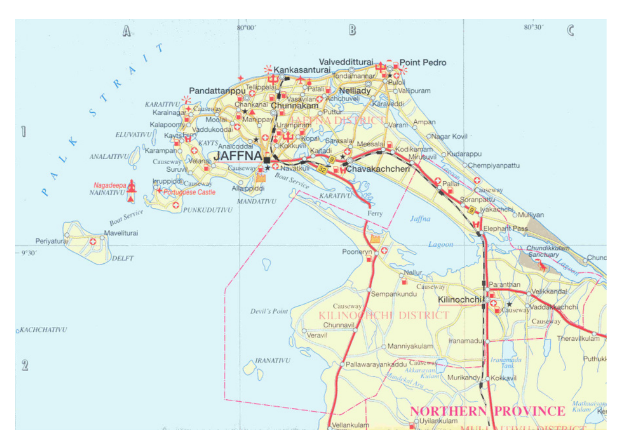
Figure 5-3. Jaffna District

The Jaffna District in the far north of Sri Lanka is a flat peninsula and group of islands that extends into the Palk Straight. The NREL maps indicate the wind resource potential on some islands and the coast near Jaffna City are Class 5. Class 4 wind resource potential is indicated along the remaining coastal areas with Class 3 winds inland. No known wind resource measurements have been made on the island. Figure 5-3 shows the Jaffna District and surroundings.