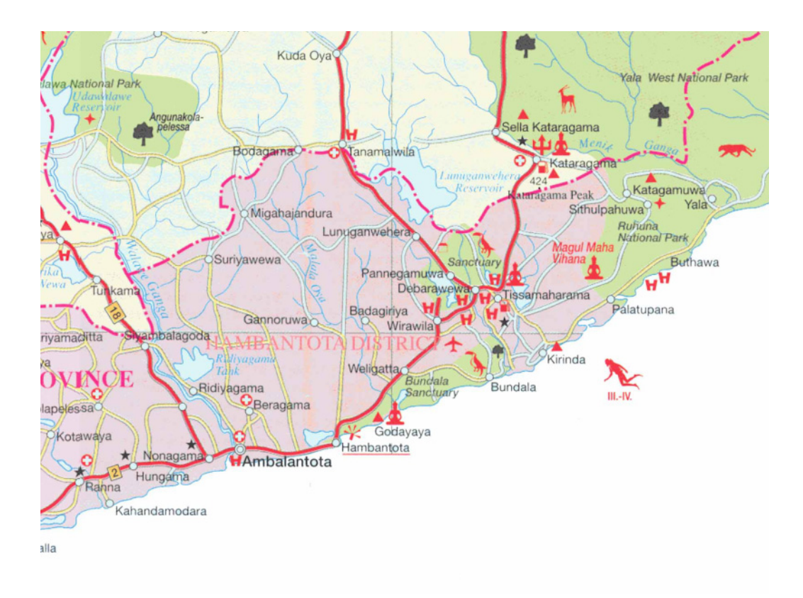
Figure 5-1. Southeast Coast Area

Figure 5-1 shows the southeast coastal area and Table 5-1 list the results of the site evaluation for the southeast coastal area.