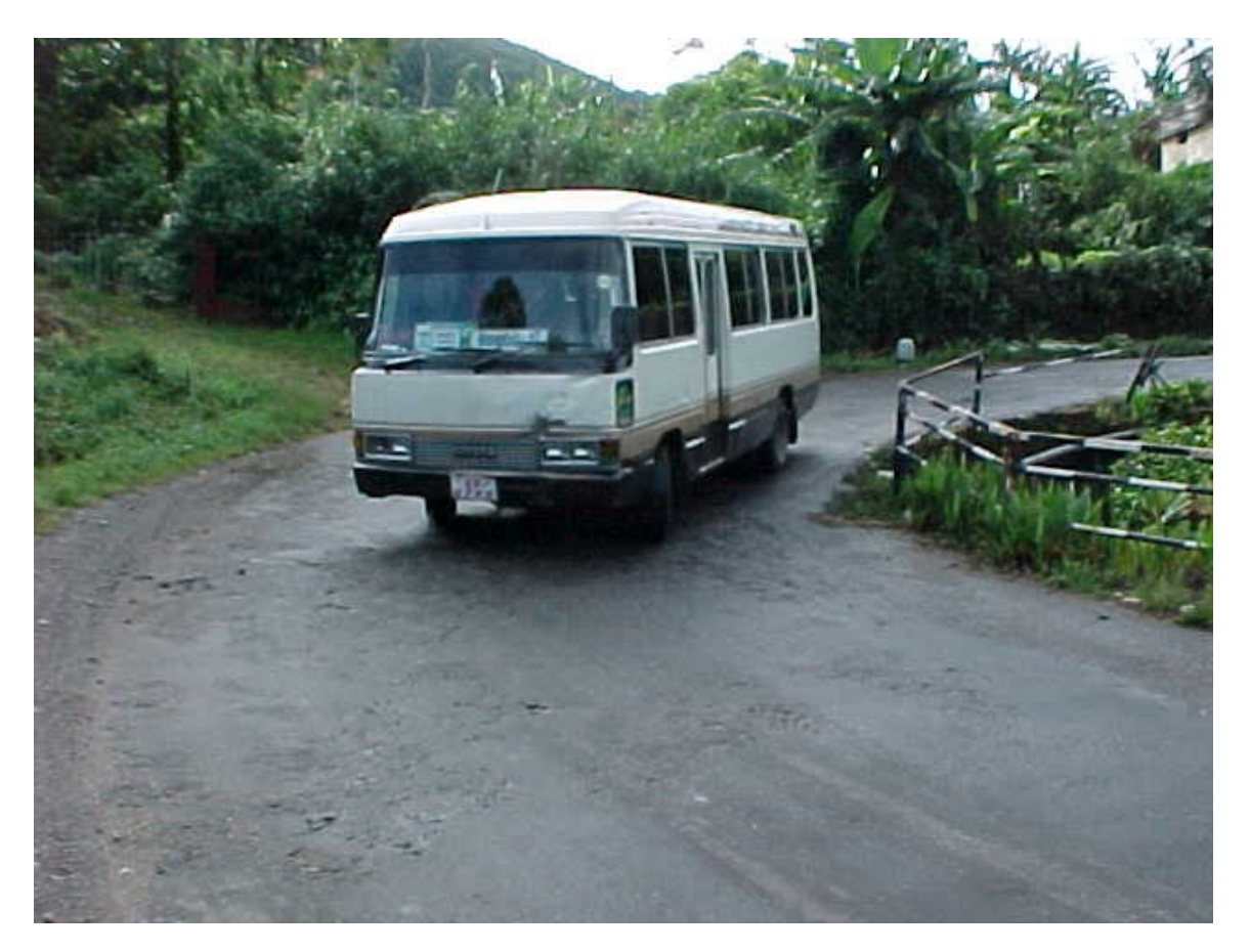
Figure 5-6. Typical Turn and Culvert on Highway 7

Figure 5-6 shows a turn and culvert on Highway 7. Several other similar turns and culverts are present on Highway 7. It is expected that Highway 7 would need some improvements to allow the passage of utility-scale wind power equipments. Turbines larger than about 500 kW may require significant improvements to Highway 7. The road from Nuwara Eliya to the site may also require improvements, but to a lesser extent than Highway 7.