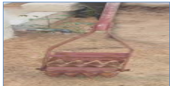
Single Drum Weeder

The weeders that are available in the market are a bit costly. There are some problems with the design also. When these are being used in heavy soils, there are several problems. Different weeders were studied and by combining the advantages of each one, a new 'mandava' weeder has been designed. The weeder got its name after 'Chinna Mandava', a village in Khammam District in Andhra Pradesh, where it has been tested and fine tuned.