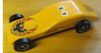
Race to 2010 - Southern Sierra Council

While it didn't win the pinewood derby races or arrive at the Jamboree, it is having an amazing journey.