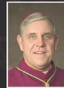
Archbishop Jerome ListECKI