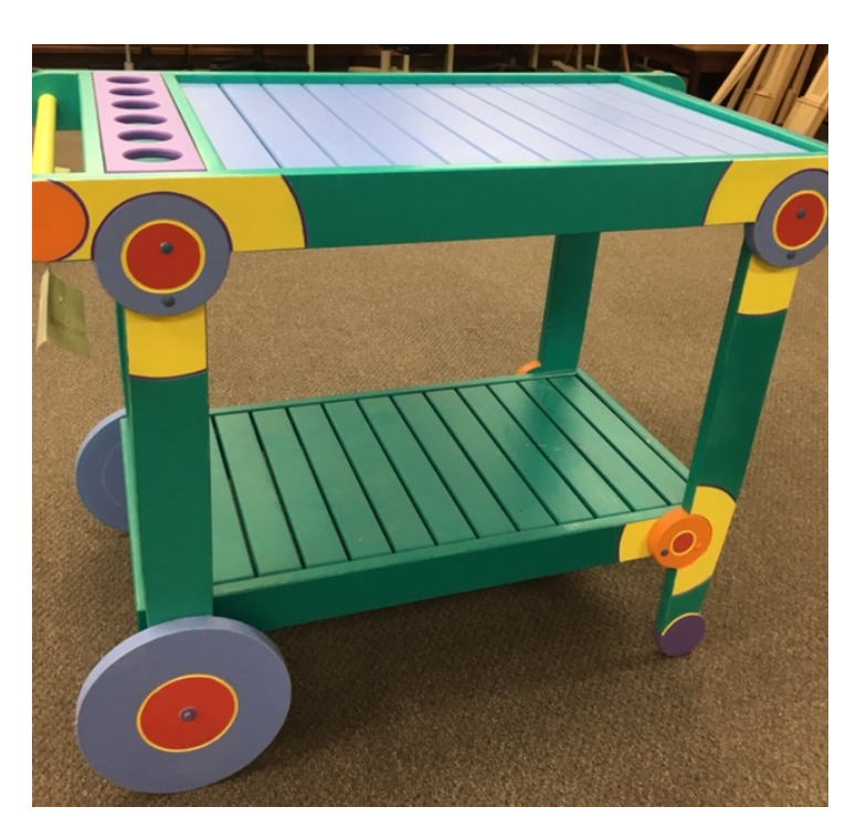
Golden Leaf garden cart. Add a touch of whimsy to your sun room or patio. Available at the MBE

Hank's Tavern on the River has the food you want. Burgers, Mexican favorites and their soon to be famous Meatballs can all be enjoyed while watching the river flow by. Find them at 601 Hoffman St in Three Rivers. Gift Cards available at MBE Only. Call Lance at 269-344-8800 to purchase.