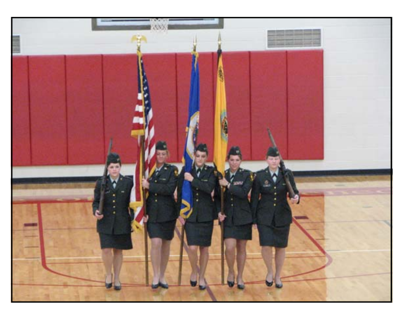
FSB Color Guard at College of St. Benedict basketball game