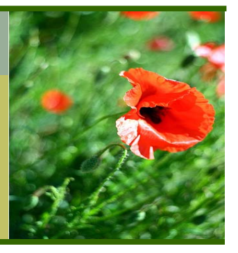
On Memorial Day, remember those who served.