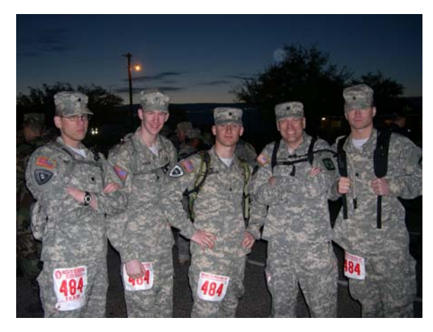
Cadets at the Bataan Memorial Death March