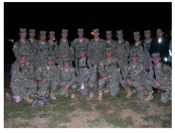
Bataan Death March in New Mexico