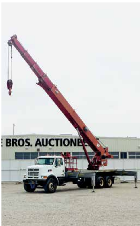
Sterling LT9500 w/Manitowoc 38124S 38 Ton