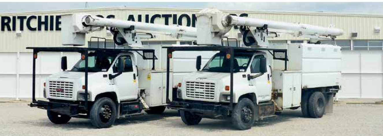
2 – GMC 7500 w/Altec LRV55

» See complete and up-to-date listings for this auction at rbauction.com