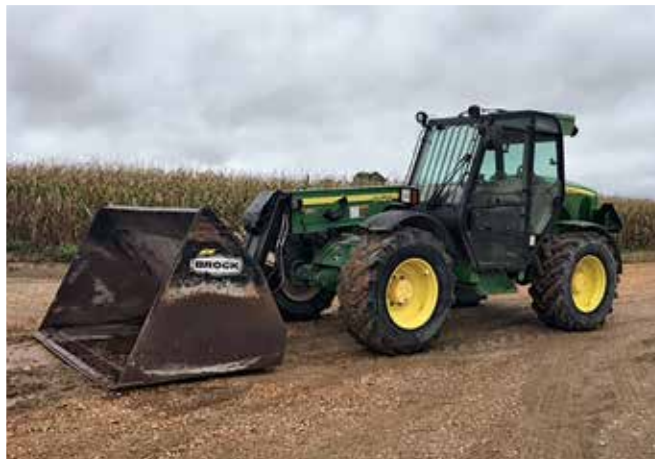
John Deere 3420