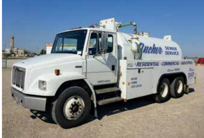
Freightliner FL80 Sewer Truck