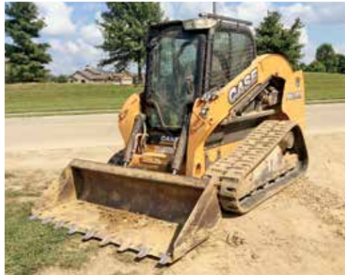
2012 Case TV380