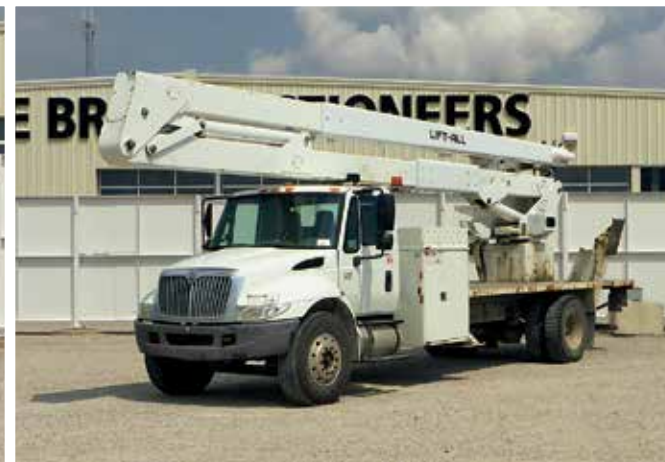
International 4300 w/Lift All LM702MS