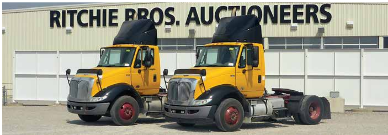
2 - 2012 International 8600 TranStar