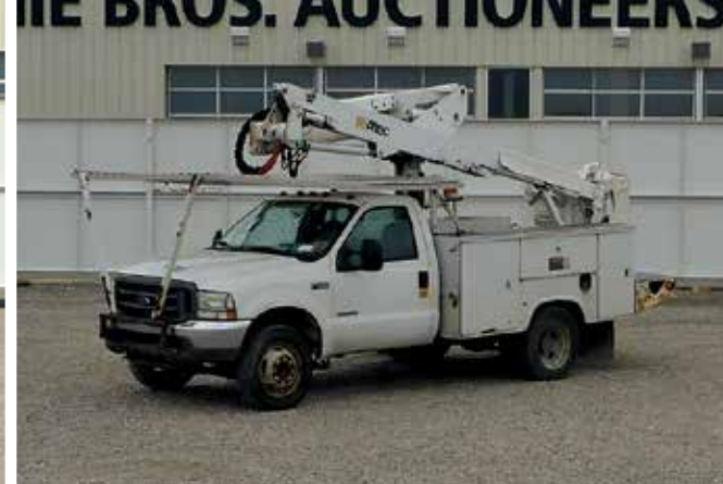
Ford F550 XL Super Duty 4x4 w/Altec AT37G