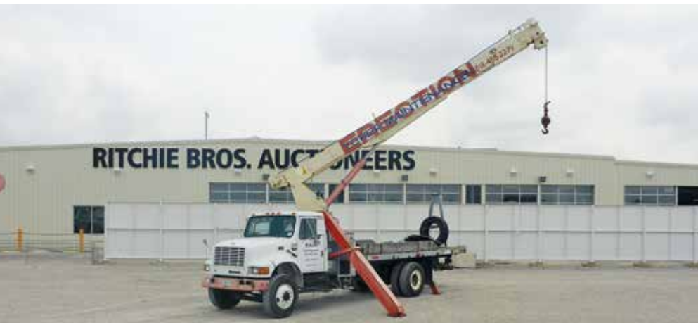
International 4700 w/Simon TC2863 28800 Lb