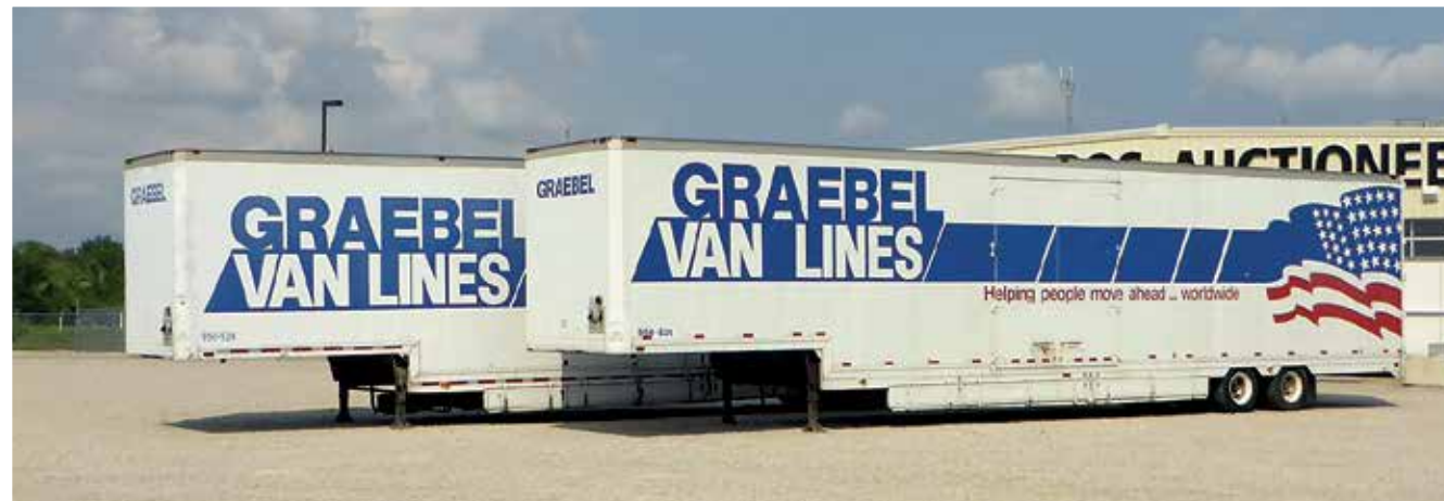
2 - Kentucky 53 Ft x 102 In.