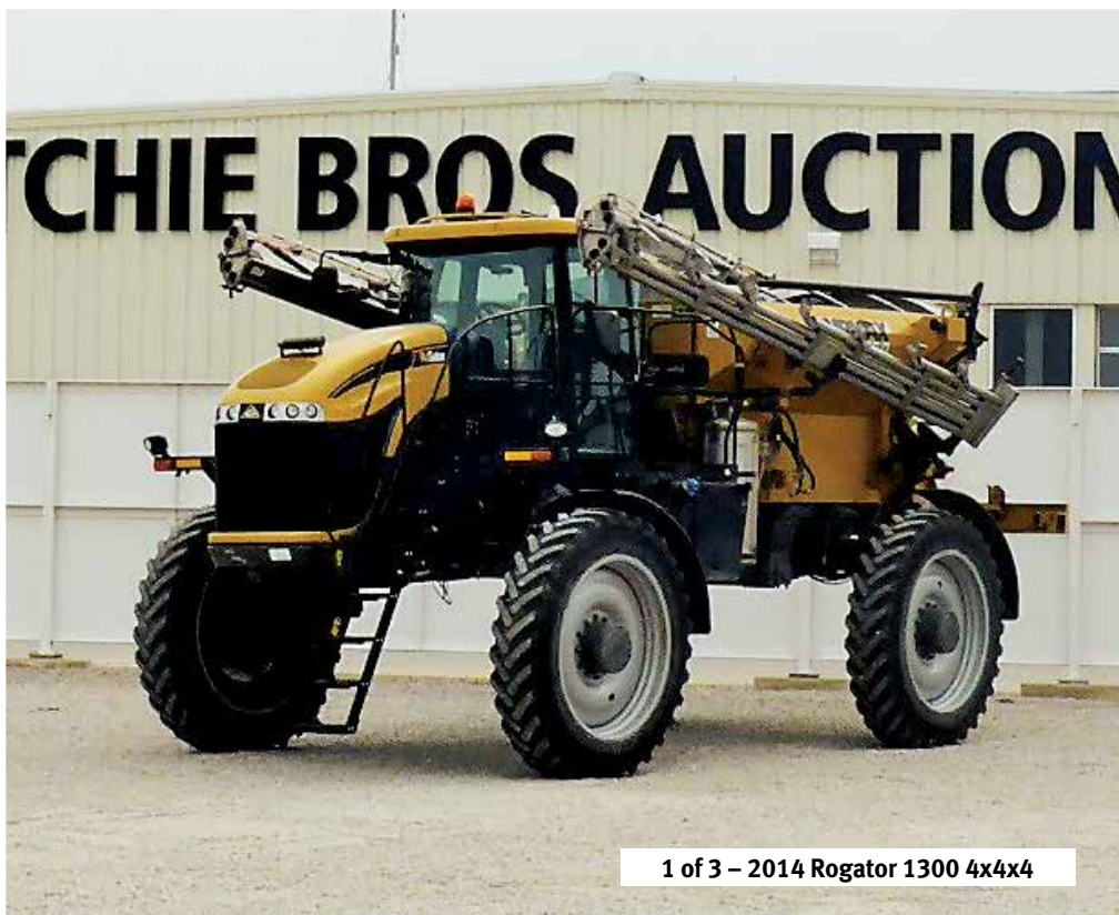
1 of 3 – 2014 Rogator 1300 4x4x4