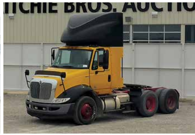
2012 International 8600 TranStar