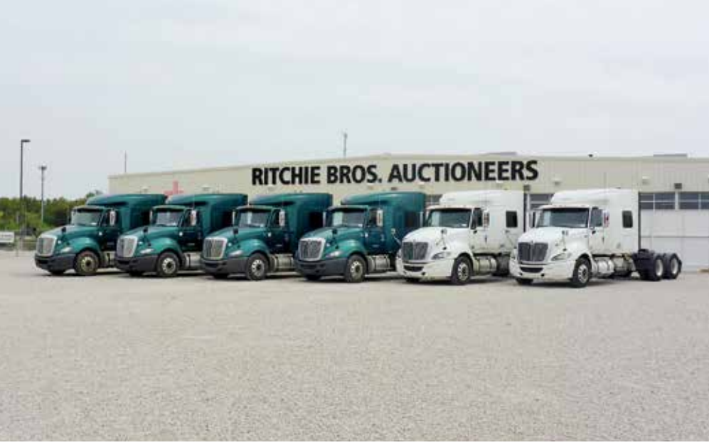
6 – 2012 International ProStar+ 122