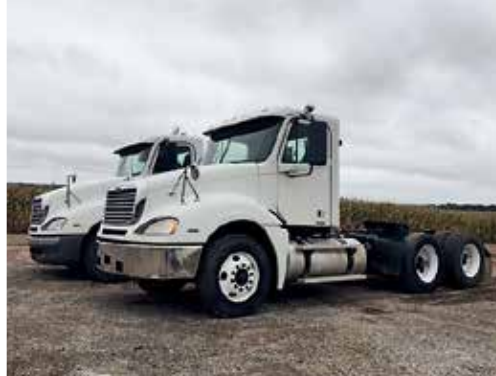
2 – Freightliner Columbia