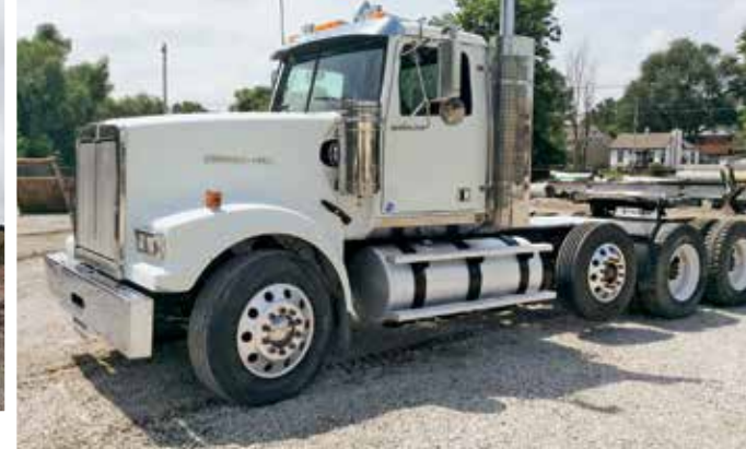
2008 Western Star 4900FA