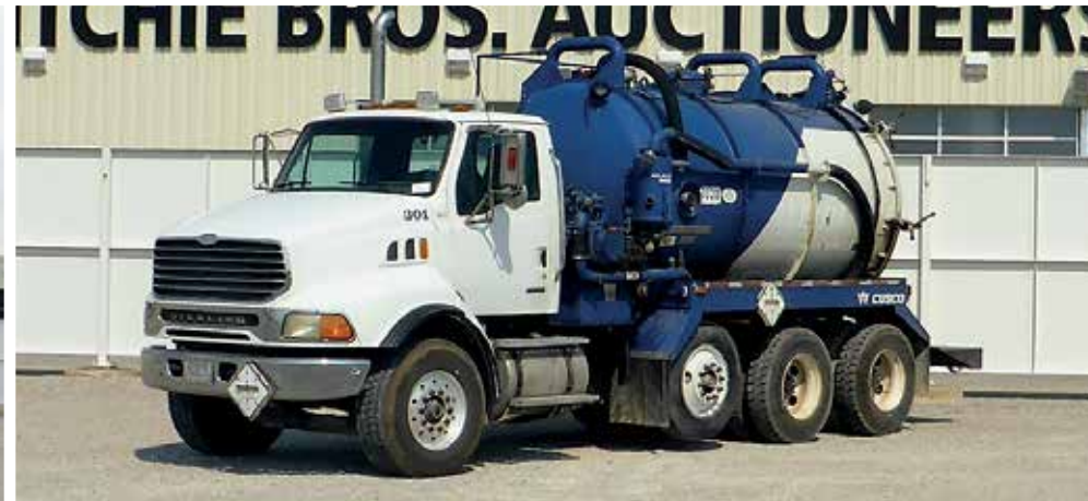
Sterling L9500 3150 Gallon