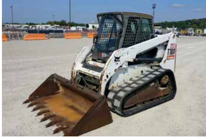
2009 Bobcat T180