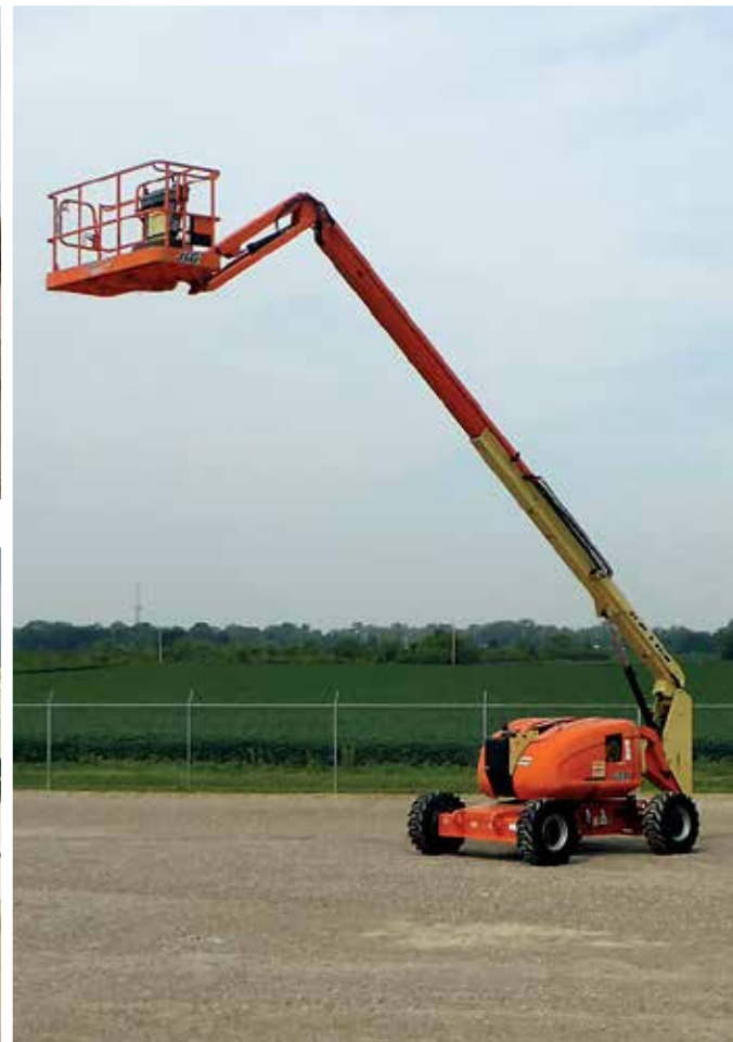
JLG 600AJ 4x4