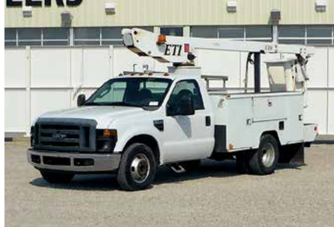
2008 Ford F350 XL Super Duty