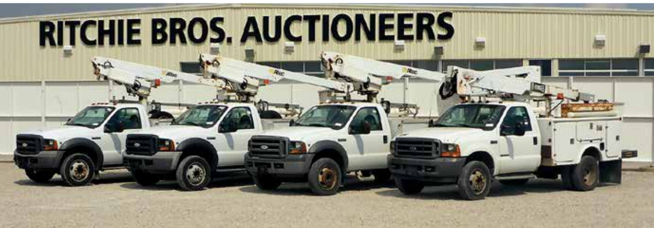
4 - Ford F450 XL Super Duty