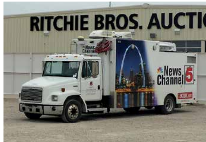
Freightliner FL60 Satellite Truck