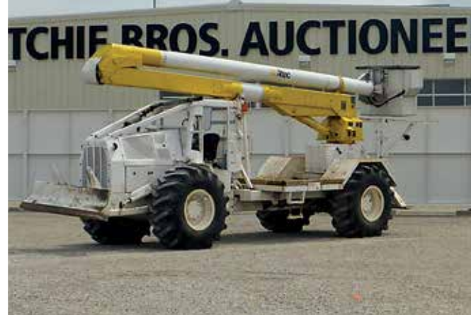
Articulated Rough Terrain 4x4 w/Altec AA-600