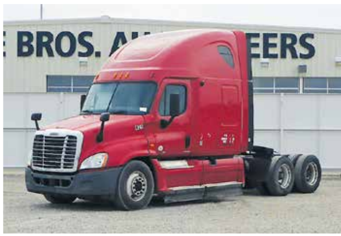
2011 Freightliner Cascadia