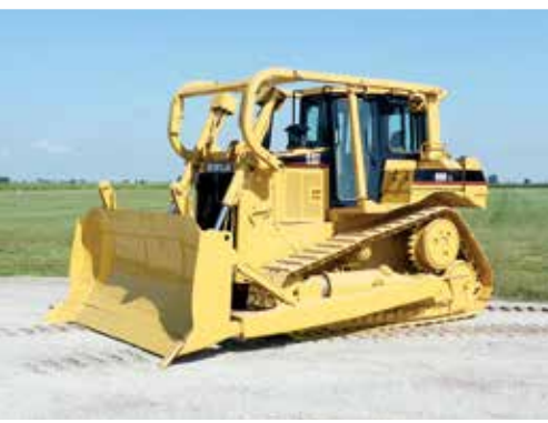
Caterpillar D6R XL