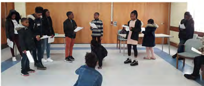
Youth group during an Easter drama rehearsal in the church