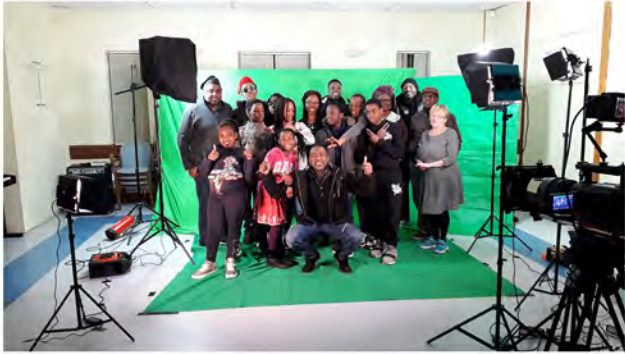
The youth group, coordinators and some parents join the making of the Christmas short film.