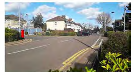
View of the street from the front entrance

A lovely neighborhood great for walks and calmer streets. Close to public transportation. Spacious corner house, with newly built garage, 5 bedrooms, 2 reception rooms, brand new fitted kitchen and 2 integral staircases.