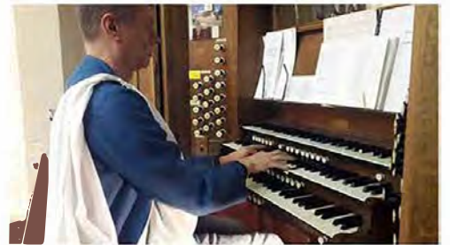
A Choir Master/Organist oversees the Sunday Worship music.