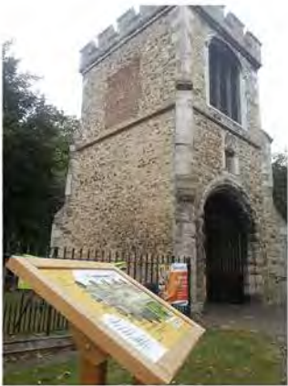
At the entrance to the Churchyard is the "Grade 2*" Listed Curfew Tower (or Fire Bell Gate), the only part of the Abbey still standing.