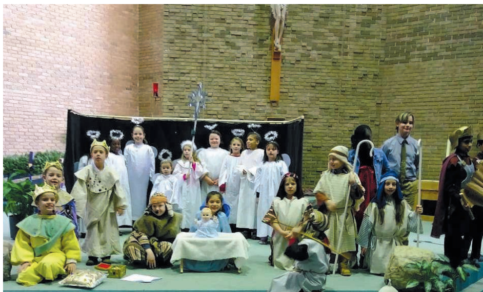
BREAKFAST IN BETHLEHEM SATURDAY, DECEMBER 9, 2017