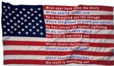
Battle Hymn of the Republic

A favorite hymn to sing on Patriotic Holidays is "Battle Hymn of the Republic." Here's the Story behind the hymn.