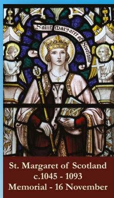
St. Margaret of Scotland c.1045 - 1093 Memorial - 16 November

Saturday: St. Margaret of Scotland; St. Gertrude; Blessed Virgin Mary