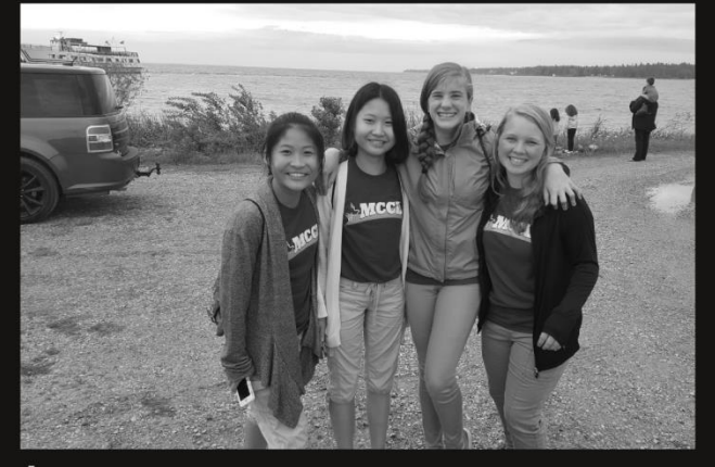
love the high quality music education that I receive, and I also love meeting new people. I have also gotten more comfortable with sight reading and holding my own part through quartet singing. - Singer