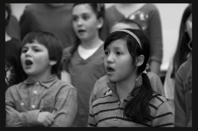
We appreciate the training our daughter is getting through MCCL and the emphasis on excellent choral singing, as well as the spirit of serving, and the friends she has made. - Parent