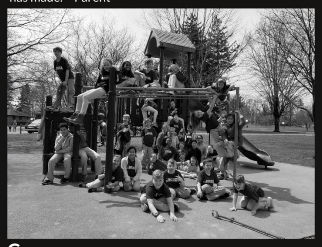
Choir is great environment because everyone has to work together as a team to get the songs ready to perform. I've grown musically and am more confident when I sing. - Singer