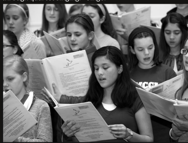
have made many new friends and have beecome more confident in my voice. - Singer