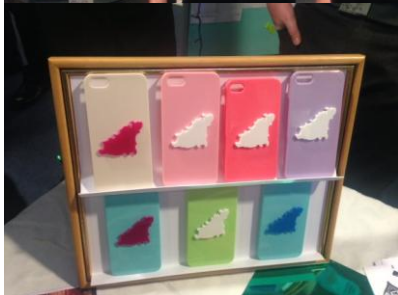
ACE products were iPhone cases and a Mother's day event at the Farmhouse