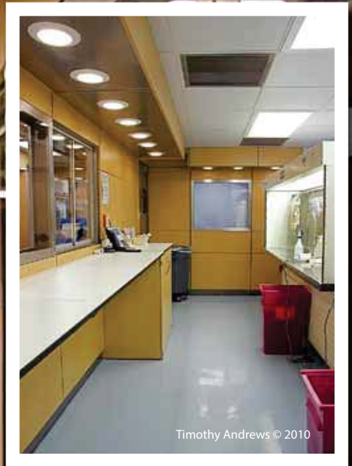
Timothy Andrews © 2010