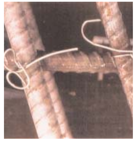
Corrosion Service Co., Canada