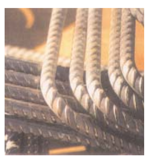
Acerinox USA, Inc