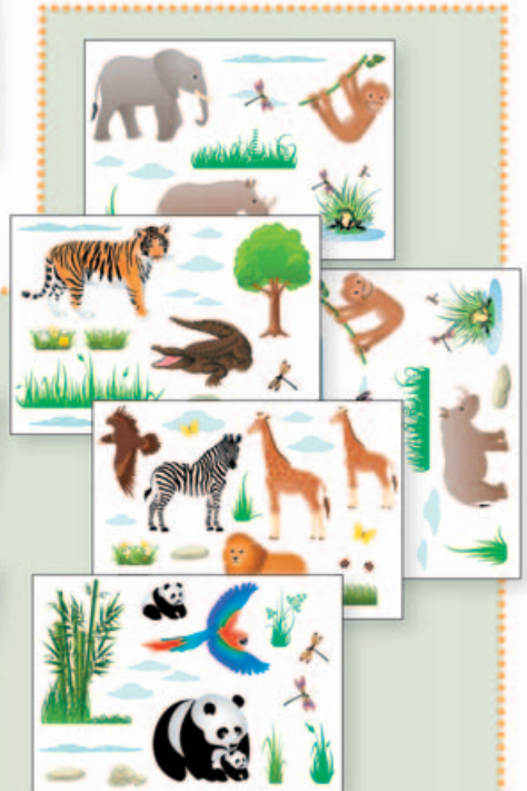
1742403 Window decal set