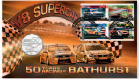
1753360 Postal and numismatic cover