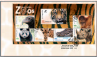
1742013 First day cover (minisheet)

Since 1916, Taronga Zoo has been renowned for its care and presentation of wildlife. Visitors to the zoo are able to discover and learn about over 3,500 animals, including Giraffes. These amazing animals are found throughout Africa, south of the Sahara Desert.