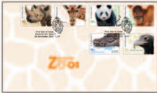
1742003 First day cover (self-adhesive)

Stamp Collecting Month – an initiative introduced 19 years ago with the release of Australian Dinosaurs – endeavours to interest children in the hobby of stamp collecting and occurs in October each year. Australia Post staff members engage with primary school children and teachers, explaining the background to stamps and stamp collecting through a specially selected theme. This year's theme is Australian Zoos.