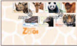
1742002 First day cover (gummed)