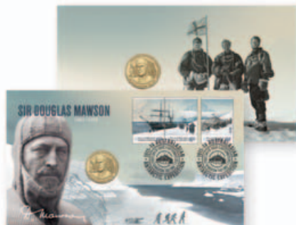
1741360 Postal and numismatic cover