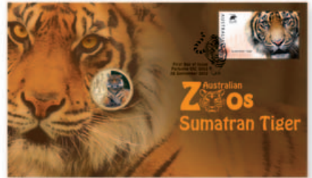
1742360 Postal and numismatic cover