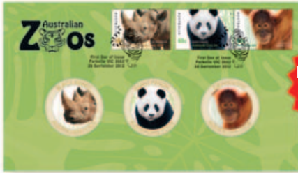
1742401 Stamp and medallion cover