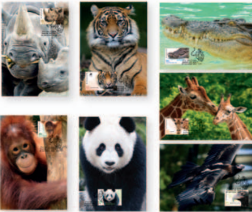
1742220 Maxicard set of seven