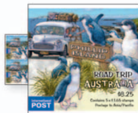
1740251 Sheetlet of 5 x $1.65