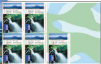
1758254 Sheetlet of 5 x $2.35