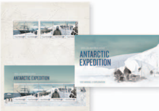
1741126 Stamp pack