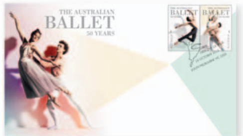
1744002 First day cover (gummed)