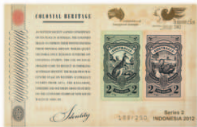
2011 Colonial Heritage Series 2 imperforate intaglio minisheet (250 numbered) $30