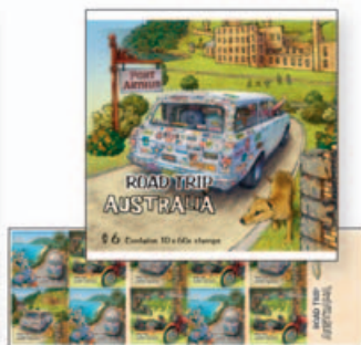
1740182 Booklet of 10 x 60c