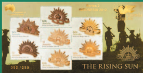
The Rising Sun semi-imperforate minisheet (250 numbered) $25