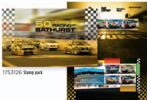
1753126 Stamp pack