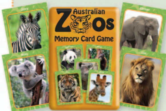
1742402 Memory card game