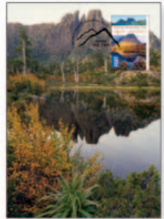
1758220 Maxicard set of three