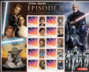
1514751 Attack of the Clones