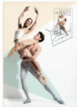
1744220 Maxicard set of two

The Australian Ballet's inaugural performance was the classic Swan Lake , which opened at Sydney's Her Majesty's Theatre on 2 November 1962, closely followed by the company's first commissioned work, Rex Reid's Melbourne Cup .