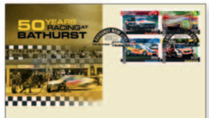
1753002 First day cover (gummed)