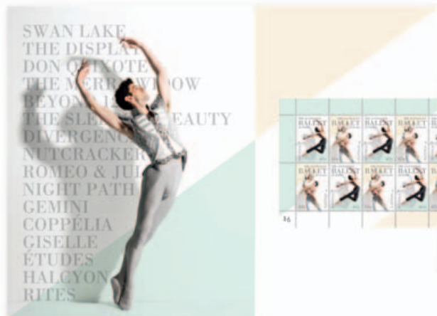
1744130 Stamp pack

The Australian Ballet presents around 200 performances each year in Australia and overseas. It undertook its first major international tour in 1965, and its 33 tours abroad have compounded its well-earned and enviable reputation on the world stage. The Australian Ballet's touchstone is "Caring for tradition, daring to be different". In this 50th anniversary year it returns to its beginning, with a new production of Swan Lake being one of its five commissions.