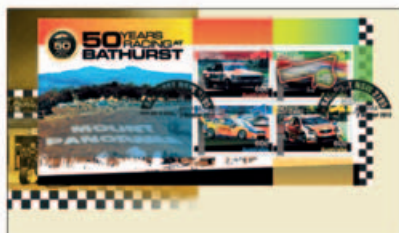
1753013 First day cover (minisheet)