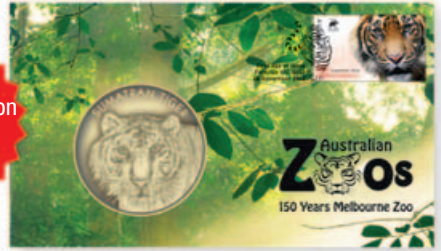
1742400 Stamp and medallion cover