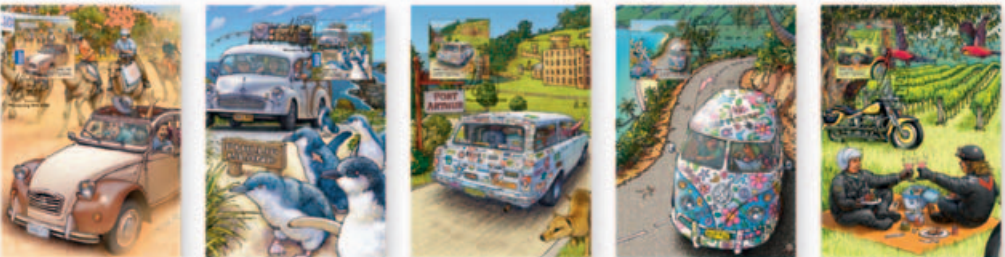
1740220 Maxicard set of five

Australians and the road trip go hand in hand. On this large island continent, where long strips of bitumen connect towns and cities, a road trip is not only a rite of passage but a necessity. It has also become a familiar experience for many Australians on their overseas odysseys. The road trip of today has its roots in the distant past, although taking to the tarmac in the 21st century doesn't look much like its predecessors. The "grand tour" of the 17th and 18th centuries was an educative tour of Europe for young gents from the ruling class, and, in preceding centuries, the pilgrimage was fuelled by religious observance rather than scholarly and cultural needs. Wayfarers of today are inspired by a lust for learning, adventure and freedom, and simply for fun. All said and done, then, the road trip is arguably still a pilgrimage of sorts, even if secular.