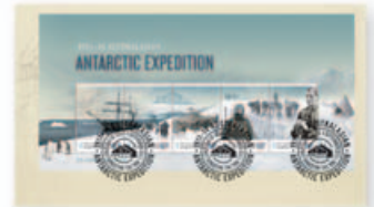
1741013 First day cover (minisheet)