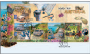
1740013 First day cover (minisheet)

Australians and the road trip go hand in hand. On this large island continent, where long strips of bitumen connect towns and cities, a road trip is not only a rite of passage but a necessity. It has also become a familiar experience for many Australians on their overseas odysseys. The road trip of today has its roots in the distant past, although taking to the tarmac in the 21st century doesn't look much like its predecessors. The "grand tour" of the 17th and 18th centuries was an educative tour of Europe for young gents from the ruling class, and, in preceding centuries, the pilgrimage was fuelled by religious observance rather than scholarly and cultural needs. Wayfarers of today are inspired by a lust for learning, adventure and freedom, and simply for fun. All said and done, then, the road trip is arguably still a pilgrimage of sorts, even if secular.