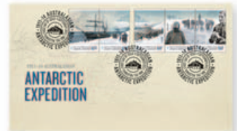
1741002 First day cover (gummed)