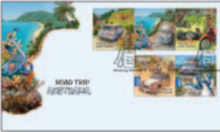
1740002 First day cover (gummed)