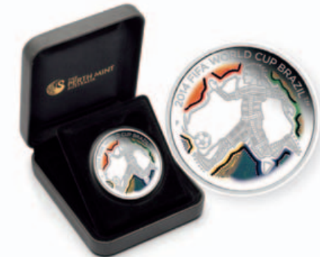
$67.00 FIFA World Cup Brazil 2014 1/2oz silver pr coin