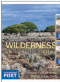
1758250 Sheetlet of 5 x $1.65