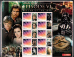
1514755 Return of the Jedi