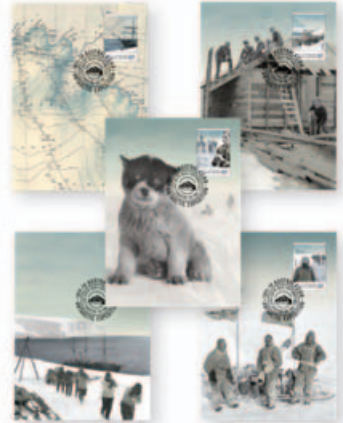
1741220 Maxicard set of five

The photographs used for this issue were sourced from various national archives including the National Library of Australia (NLA) and the State Library of NSW where the bulk of the AAE's images are held.