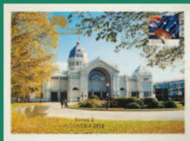
Royal Exhibition Building postcard (250 numbered) $7.50