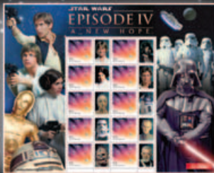
1514753 A New Hope