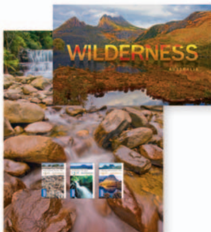
1758126 Stamp pack