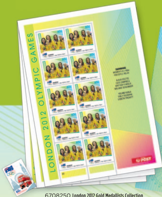
6708250 London 2012 Gold Medallists Collection