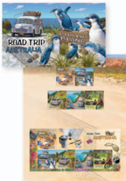
1740126 Stamp pack

For many trippers, it is as much about the journey as it is the destination. This stamp issue adopts a light-hearted approach to travelling through remarkable landscapes and calling at some landmark attractions: the outback town of Alice Springs, home to not only the quirky annual Camel Cup but a notable centre for Aboriginal art and culture; Phillip Island, where Little Penguins ( Eudyptula minor ) parade from beach to sand dunes at sunset each eve; Port Arthur, an impressive reminder of our grim past; the Great Barrier Reef, the world's largest coral reef system, which hugs some 2,000 kilometres of coastline; and Margaret River, known not only for its premium wines and gastronomic pleasures but for its barrelling surf.