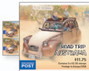
1740253 Sheetlet of 5 x $2.35