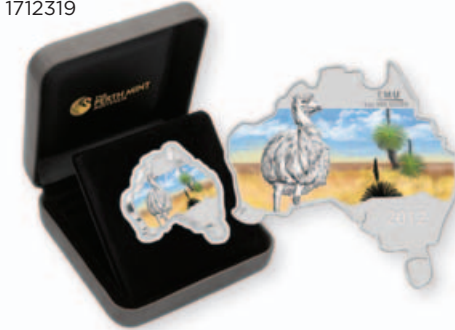
$109.50 2012 Australian Map coin - Emu 1oz silver