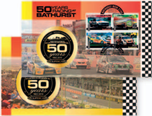
1753300 Stamps & medallion cover