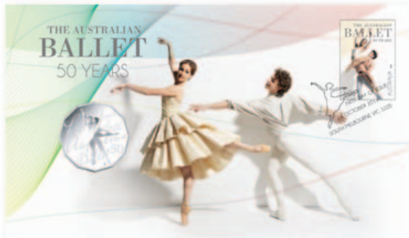
1744360 Postal and numismatic cover