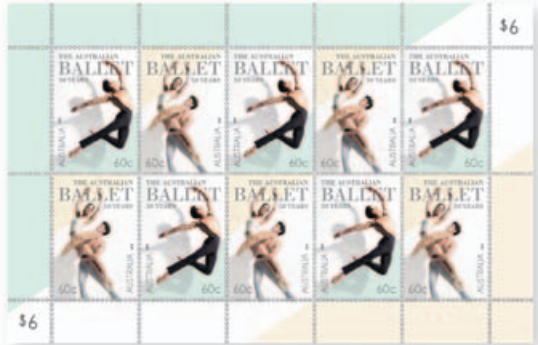
1744201 Sheetlet of 10 x 60c