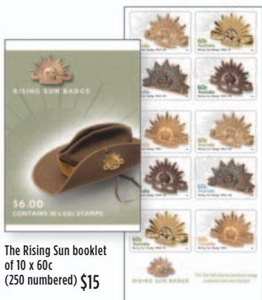
The Rising Sun booklet of 10 x 60c (250 numbered) $15