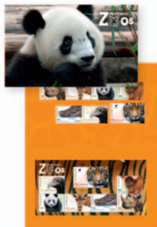
1742126 Stamp pack

Healesville Sanctuary in Victoria opened in 1934, and is dedicated to the conservation of native fauna including the Platypus, Tasmanian Devil and Leadbeater’s Possum. The sanctuary’s oldest animal, as well as one of its most popular, is Jess the Wedge-tailed Eagle.