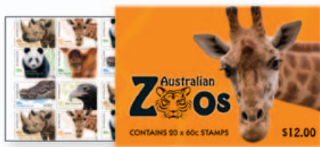
1742182 Booklet of 20 x 60c