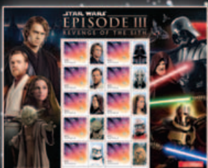
1514752 Revenge of the Sith