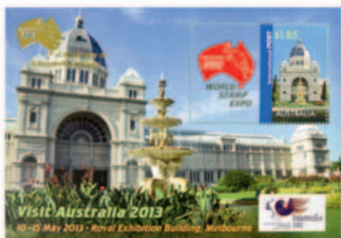
Visit Australia 2013 minisheet (250 numbered) $15