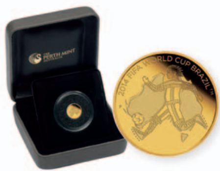
$74.50 FIFA World Cup Brazil 2014 0.5g gold pr coin