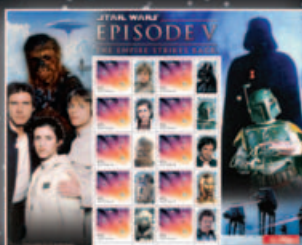
1514754 The Empire Strikes Back