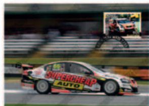
1753220 Maxicard set of four