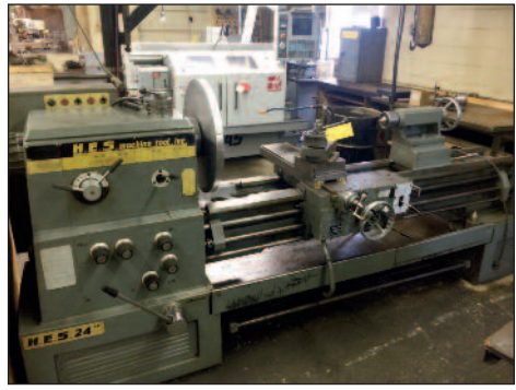
H.E.S. # 660 Engine Lathe w/ 24" X 60" Cap.