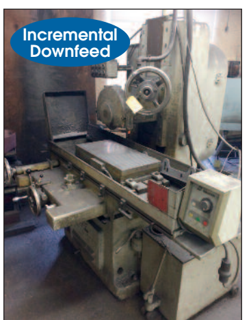
Gallmeyer & Livingston No. 45 Surface Grinder