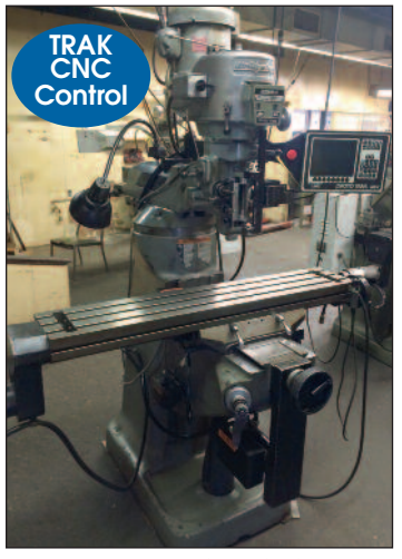
Bridgeport E-Z Trak 2 HP CNC Vertical Miller