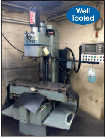
Compumill CNC Vertical Miller Model