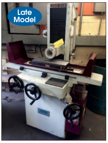
MSC Surface Grinder Model SGS-618