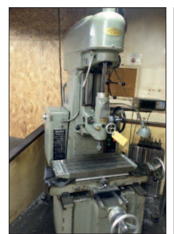
Moore Jig Borer Model 3