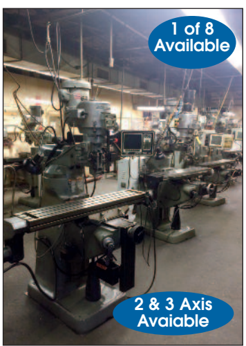
View of Bridgeport CNC Mills