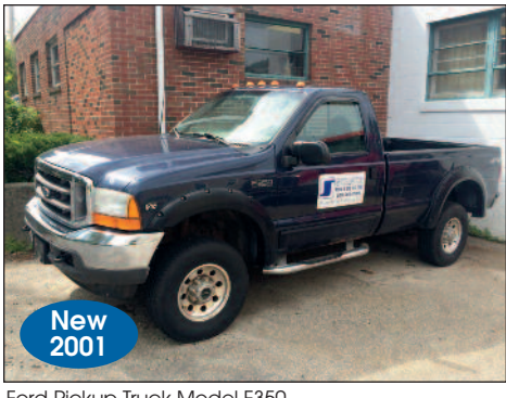
Ford Pickup Truck Model F350

Please check with the auctioneer's office for additions or deletions.