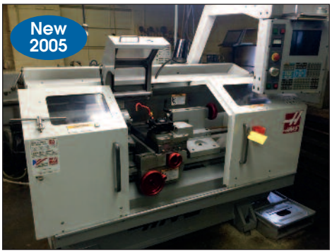
Haas CNC Lathe Model TL-1