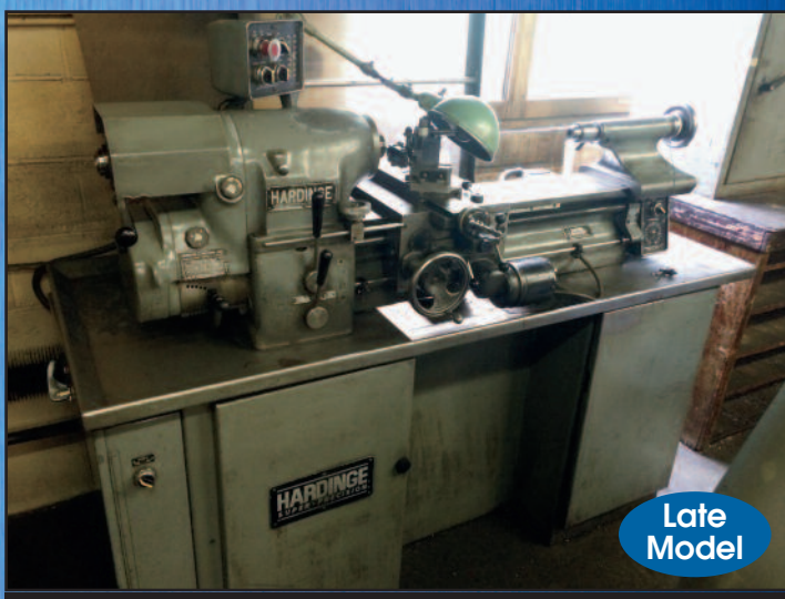
Hardinge Super Precision Toolroom Lathe Model HLVH