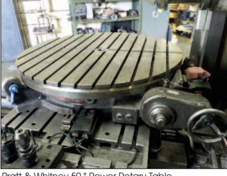
Pratt & Whitney 50 Power Rotary Table