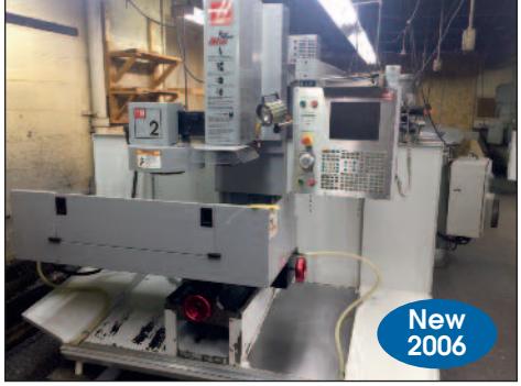
Haas Toolroom Mill Model TM-2