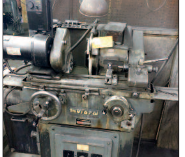
Myford I.D. O.D. Grinder Model MG

Blanchard No. 18 36" Rotary Surface Grinder, S/N 7668