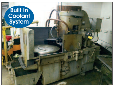
Blanchard No. 18 36" Rotary Surface Grinder