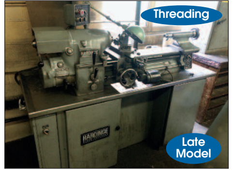
Hardinge Super Precision Toolroom Lathe # HLVH