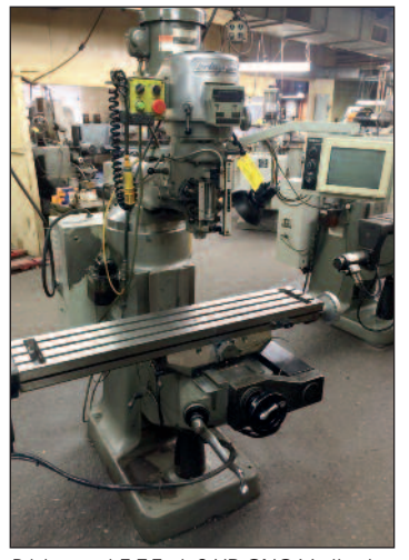
Bridgeport E-Z Trak 2 HP CNC Vertical Miller