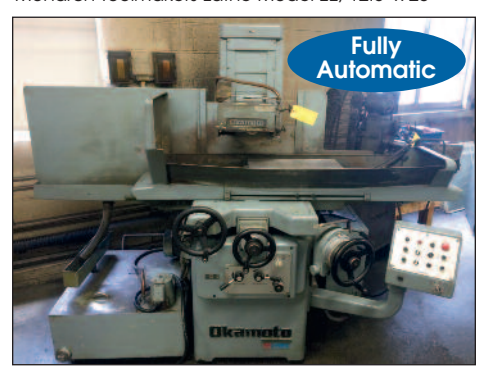
Okamoto Surface Grinder Model 820A