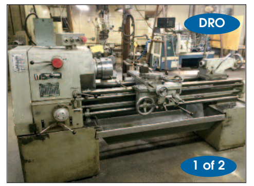
South Bend Turn-Nado Engine Lathe w/ 17" X 60" Cap.