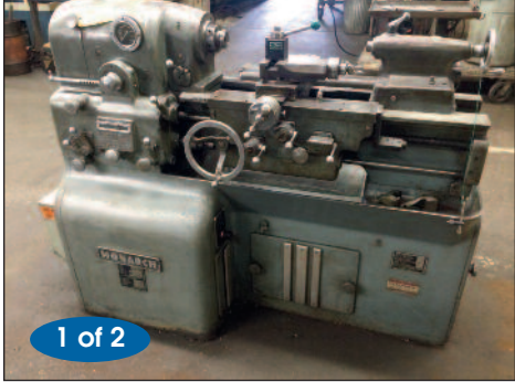
Monarch Toolmakers Lathe Model FE, 12.5" x 201