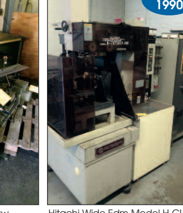
Hitachi Wide Edm Model H-CUT 304P/AWF