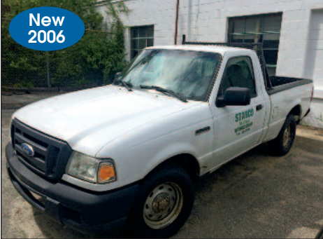
Ford Pick Up Truck Model Ranger XL