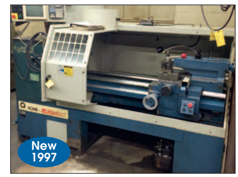
Bridgeport Romi E-Z Path II CNC 20" Lathe