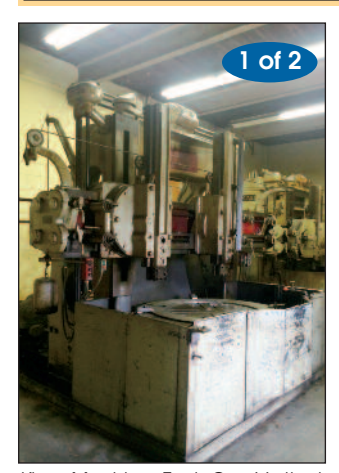
King Machine Tool Co. Vertical Turret Lathe