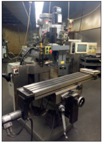
Bridgeport "Series II Special" E-Z Trak 2 HP CNC Vertical