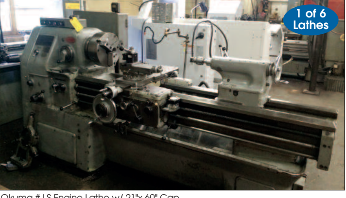
Okuma # LS Engine Lathe w/ 21"x 60" Cap.