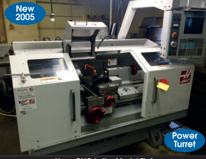
Haas CNC Lathe Model TL-1