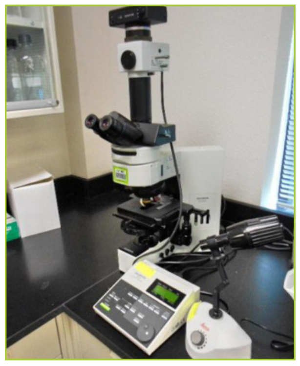
OLYMPUS BX60F5 UPRIGHT FLUORESCENCE PHOTO MICROSCOPE