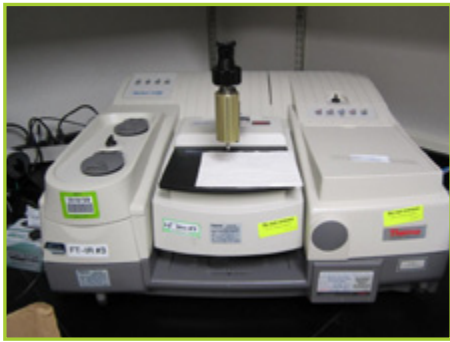
THERMO ELECTRON NICOLET 4700 FTIR SPECTROMETER