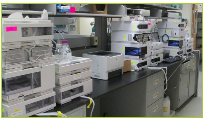
MULTIPLE AGILENT 1100 AND 1200 HPLC SYSTEMS

1 - Image Therm Engineering SprayView NSP High-Speed Optical Spray Characterization System