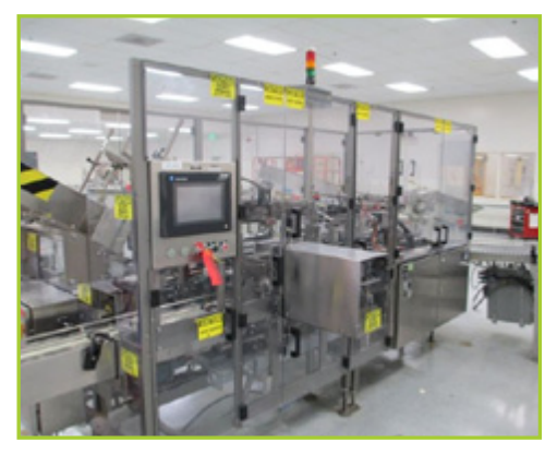
MGS CASE PACKER MODEL HIS-1800