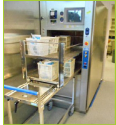
GETINGE 6910AR1 SINGLE-DOOR STERILIZER/ AUTOCLAVE