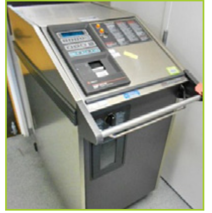
AMSCO VHP-SERIES-1000 VAPORIZED HYDROGEN PEROXIDE BIODECONTAMINATION SYSTEM

5 - TSP/Thermo Separations Products SpectraSystem (4-Modules Total) HPLC. With Modules: TSP/ThermoFinnigan UV Detector UV3000 ; TSP AutoSampler AS3000; TSP Pump P4000; TSP Solvent Degasser SCM1000 With Solvent Tray. Also Includes TSP Interface SCN4000. With Perkin Elmer NCI-900 Network Chromatography Interface