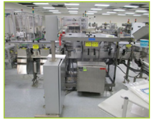
MGS CARTON ACCUMULATOR