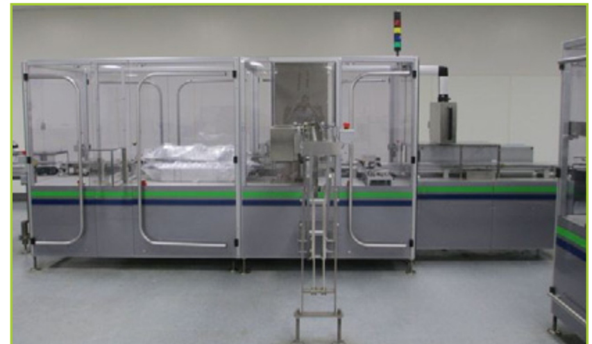
MGS TLC CARTONER