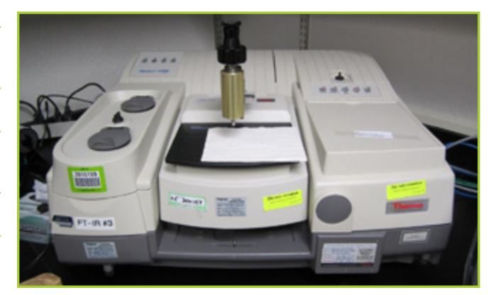
THERMO ELECTRON NICOLET 4700 LOT

2 – Custom (1) SS CIP Skid includes (1) Yula Sanitary Heater Model CV-2A-36BS , Allowable Working Pressure Shell: 150 PSI @350F, Tubes 150 PSI @350F. Design Metal Temp. 40F@150 PSI. Frista, pump, and approx 150 liter tank. Includes ProcessHQ hosing cart.