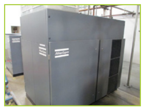
ATLAS COPCO ZT75 AIR COMPRESSOR

4 – Mueller Stainless Steel Jacketed 4000 Liter Tank, Vessel Max WP 35 PSI @ 300F, MDMT 40F @ 35PSI, Jacket 40 PSI @ 300F, MDMT 40F @ 40PSI