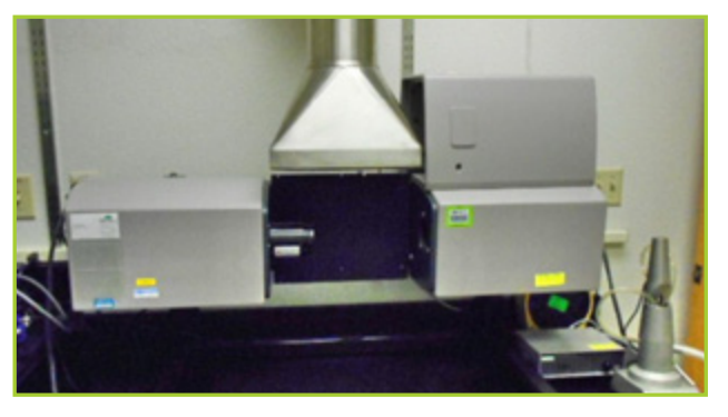
MALVERN MASTERSIZER-S (MSS) LASER PARTICLE SIZE ANALYZER

1 - Shimadzu TOC-V/CSH Total Organic Carbon Analyzer , With Model-AS1-V Autosampler