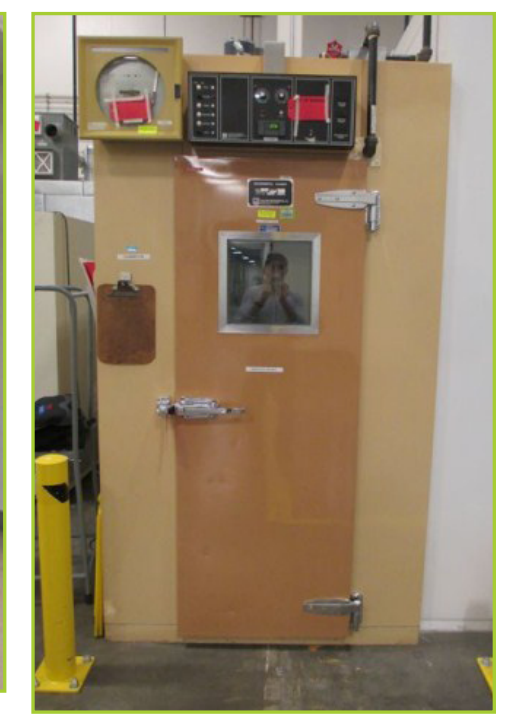
LAB-LINE WALK IN ENVIRONMENTAL CHAMBER MODEL: 706