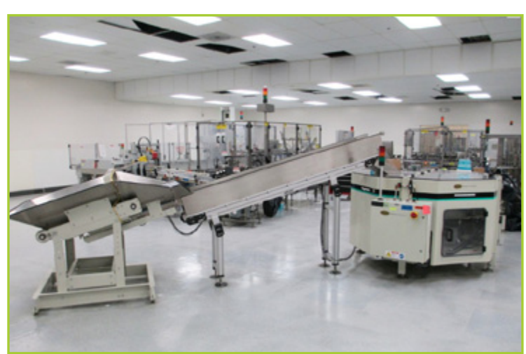
HOPPMAN BOWL FEEDER MODEL FT-50, INCLUDES PICTURED HOPPER AND CONVEYOR