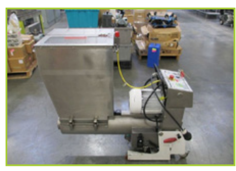
PLASTIC RECYCLING MACHINERY MGK 400/175TL RESIN GRINDER