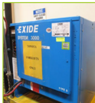
EXIDE BATTERY CHARGER MODEL: G3-18-680