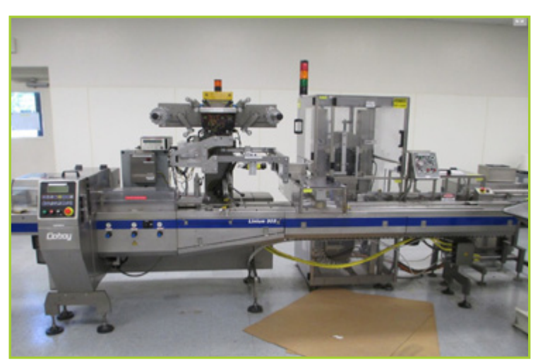
DOBOY LINIUM 303 FLOW WRAPPERS WITH SMART DATE 2 PRINTER