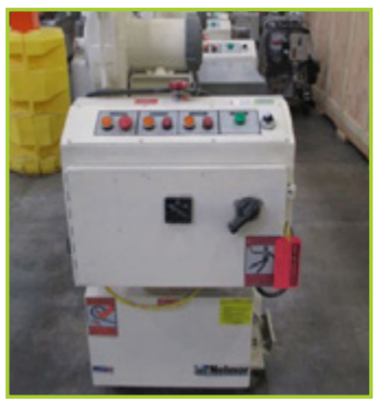
NELMOR MODEL AK68 GRINDER