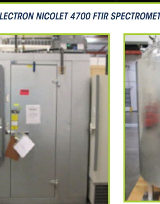
NORLAKE WALK-IN REFRIGERATOR, 6X6