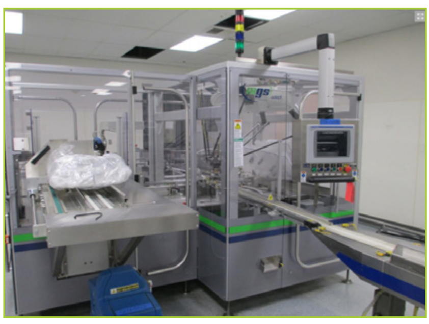
MGS MODEL TLC PICK AND PLACE ROBOTIC PACKAGING MACHINE

(Refer to Term 7 in the Auction Terms and Conditions for details)