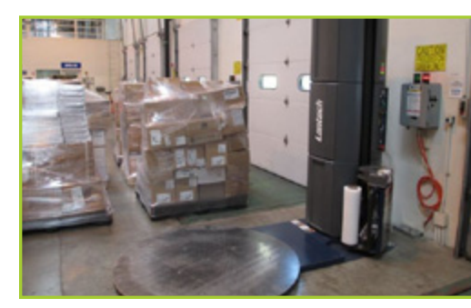
LANTECH Q300 SERIES PALLET WRAPPER