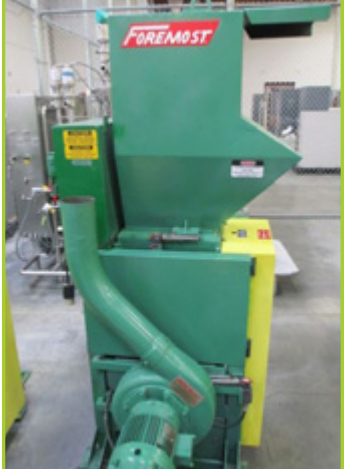
THERMO ORIEL XEON ARC LAMP WITH 6