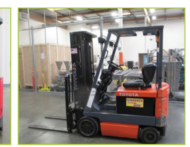
TOYOTA ELECTRIC FORKLIFT MODEL 5FBCU15