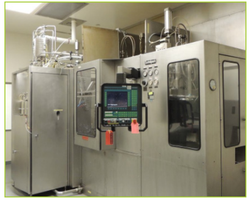
COMPLETE ROMMELAG 360 BLOW FILL SEAL MACHINE