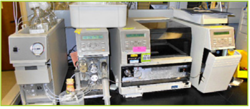
TSP SPECTRASYSTEM HPLC