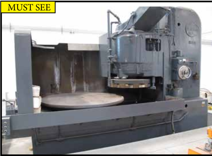
BLANCHARD NO 48-99, 84" ROTARY SURFACE GRINDER, 84" MAGNETIC CHUCK, 48" GRINDING HEAD, WHEEL DRESSER, S/N 12626.