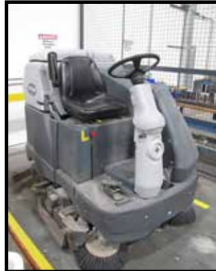
ECOFLEX SC6500 RIDE ON FLOOR SCRUBBER