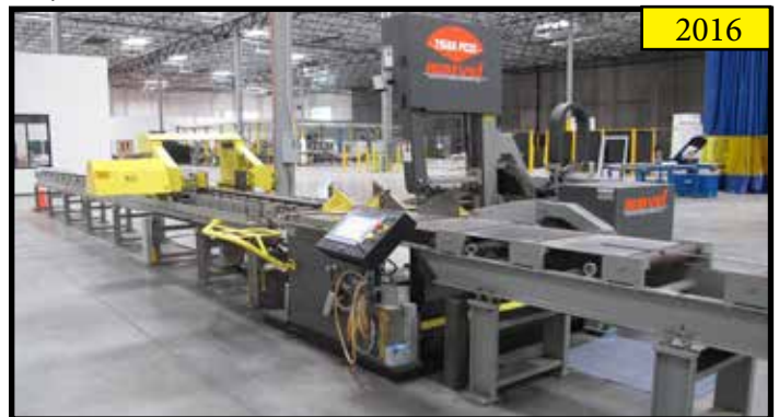
2016 MARVEL 2150A-PC3S MODEL F2150PC3S VERTICAL TILT FRAME CNC BAND SAW, WITH SIEMENS PC3 SAW CONTROL, HYD CLAMPING AND AUTO FEEDS, PLUS AND MINUS 60 DEGREE CUTTING ANGLES, BUNDLE CLAMPING ACCESSORY, CONVEYOR, S/N F2150-20346-PC3S.