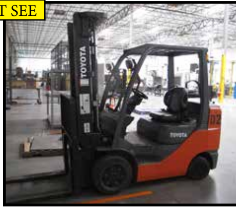
TOYOTA 8FGCU30, 6000 LB CAP LPG FORKLIFT, 3 STAGE MAST, 198" LIFT HEIGHT, CUSHION TIRES, 6380 HOURS (APPROXIMATE), S/N 14595.