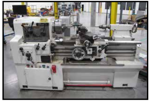
CADILLAC 1733, 17" X 33" GEARED HEAD GAP ENGINE LATHE, 32 - 1800 RPM, INCH THREADING, 10" 3 JAW CHUCK, S/N 868648.