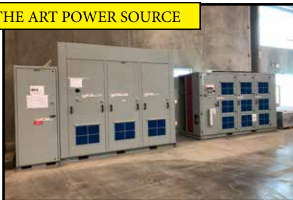
2) SIEMENS SINAMICS PERFECT HARMONY GH180 TYPE 6SR3, 9000HP GEN 4E-CELL SIZE750A MEDIUM VOLTAGE VARIABLE FREQUENCY DRIVE UNIT, 750 AMP CELL, DIGITAL CONTROLS. INPUT 1274AVAC-3PH-60HZ-370A OUTPUT 0-6600V – 3HP – 0-330HZ –750A (SUPPLIES VARIABLE VOLTAGE AND FREQUENCY TO OUTPUT DRIVES)