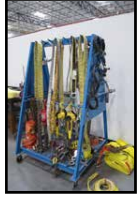
CHAIN AND BINDERS.