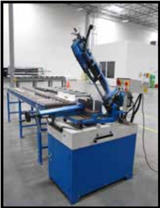
2016 KNUTH BS310, 10" HORIZONTAL MITER BAND SAW, W/ 2 SPEEDS, SPEED CLAMPING, CONVEYOR, S/N 3926.