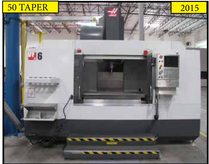
2015 HAAS VF-6/50 CNC VMC, 30 STATION SIDE MOUNT ATC, 7500 RPM, CAT 50 SPINDLE, RENISHAW INTUITIVE PROBING SYSTEM, PROGRAMMABLE COOLANT NOZZLE, CHIP AUGER, HAND WHEEL, HAAS HPC 1000