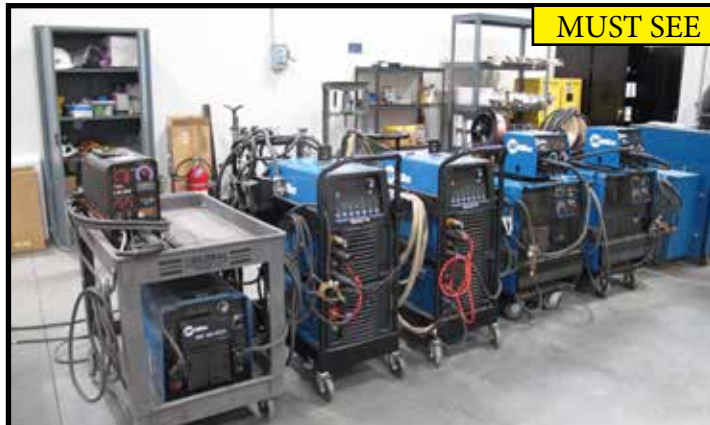
LARGE SELECTION OF MILLER WELDERS, MODELS CP-302, DYNASTY 350, XMT 450, ETC.