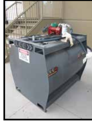
LEE DIESEL STORAGE TANK WITH PUMP.