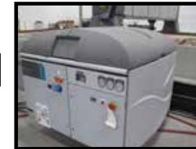
2016 FLOW "MACH 4 4080C" MODLE M4C 4080 DWJ 049104-3 CNC WATERJET CONTOUR MACHINE, S/N 131200 WITH FLOW CONTROLS, FLOW HYPERJET MDL 058007-1 94 KPSI PUMP UNIT, FLOW GARNET HOPPER, EBBCO TEAEVO TECH CLOSED LOOP CHILLER UNIT, EBBCO WJF-2004-CD FILTRATION SYSTEM, 190" X 348" TABLE, 1105 HOURS.