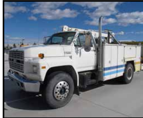
FORD F-600 DIESEL UTILITY TRUCK WITH IMT HYRAULIC BOOM CRANE.