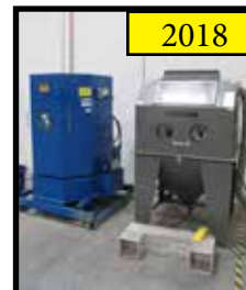
2018 ATLAS SWC-500 HEATED ROTARY PARTS WASHER, 28" ROTARY BASKET, 6KW HEATER, OIL SKIMMER.