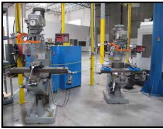
2) BRIDGEPORT VERTICAL MILLING MACHINES, 2 HP, DRO, POWER FEED, GAURDS, 9"X42" TABLE, 60- 4200 RPM, S/N 203028 AND 12531.