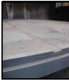
MAGNETIC CHUCK, 84"