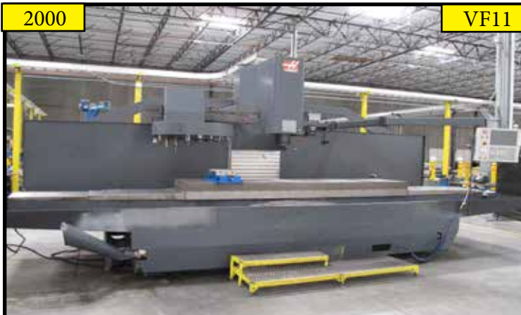
2000 HAAS VF-11/50 CNC VMC WITH UPGRADED HAAS CONTROL, 20 STATION ATC, CAT 50 TPAER SPINDLE, 120" X 40" X 30" (XYZ), 12" X 28" TABLE SIZE, INTUITIVE PROBING SYSTEM, BRUSHLESS SERVOS, THRU SPINDLE COOLANT, PROGRAMMABLE COOLANT NOZZLE, MACRO CODE, QUICK CODE, COORDINATE SCALING & ROTATION, RIGID TAPPING, 4 AXIS READY, CHIP AUGER, S/N 20656.

2016 HAAS VF-4SS, CNC VMC, 4 AXIS READY, 12,000 RPM, 40 STATION SIDE MOUNT ATC, CAT 40 TAPER SPINDLE, RENISHAW PROBING AND WEAR SYSTEM, HAND WHEEL, PROGRAMMABLE COOLANT NOZZLE, (4) CHIP AUGERS, CHIP CONVEYOR, 50" x 20" x 25" (XYZ), S/N 1132864