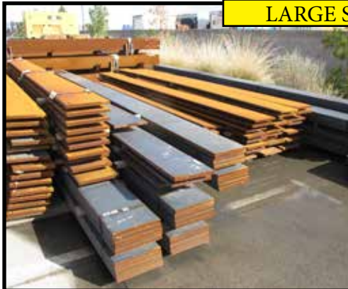
LARGE QUANTITY OF STEEL PLATES TO 1.5" THICK , I BEAMS, H BEAMS, ROUND AND SQUARE TUBING.