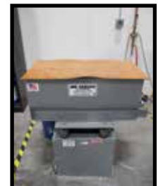
MR. DEBURR MEDIA TUMBLER WITH 13" X 31" TUB.