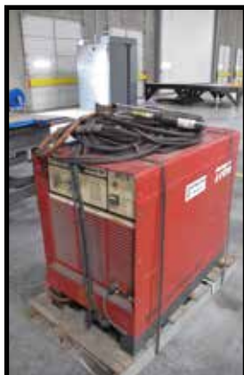
TRW SERIES 5000 MODEL 100 NELSON STUD WELDER W/ GUN, S/N 63086B.