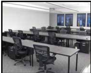
LARGE SELECTION OF WORK STATIONS WITH DESKS AND CHAIRS.