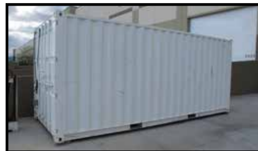
20FT STORAGE CONTAINER.