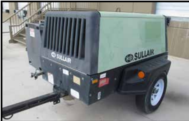
SULLAIR 185 PORTABLE AIR COMPRESSOR, 1066 HOURS, S/N 200803250108. (BILL OF SALE ONLY)