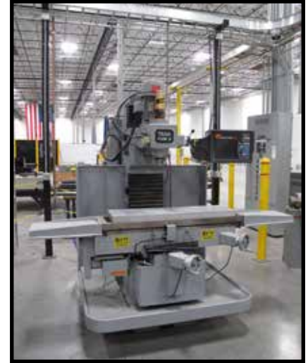
TRAK FHM5, 3 AXIS CNC VERTICAL MILL WITH PROTOTRAK SMX CONTROL, 40 TPAER SPINDLE, MAXI POWER DRAW BAR, 5HP SPP SPIN