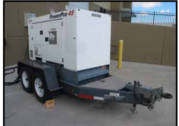
POWER PRO 45, PORTABLE 45 KVA DIESEL GENERATOR, MDL SDG45S, 6862 HOURS, 45 KVA 240/480 VOLT OUTPUT, TRAILER, (BILL OF SALE ONLY) S/N 138B10222.