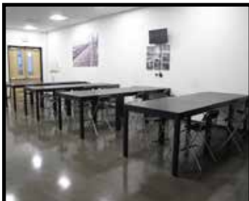
LARGE SELECTION OF BREAK ROOM FURNITURE AND CHAIRS. CONFERENCE TABLE WITH CHAIRS.