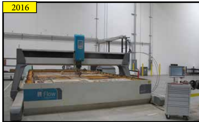
2016 FLOW MODEL M4C 4080 XD 049104-3, 5 AXIS CNC WATERJET CONTOUR MACHINE S/N 131202, FLOW CNC CONTROLS, FLOW DYNAMIC XD 5 AXIS END EFFECTOR CUTTING HEAD, FLOW MDL 058007-1 94 KSI PUMP UNIT, FLOW GARNET HOPPER, 190" X 348" TABLE, FILTRATION SYSTEM, 1361 HOURS.