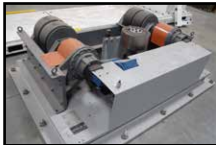
TESTING SYSTEM WITH CAGE, AND PRESTON EASTIN T-RA-20-3, 20,000 LB TURNING ROLLS, S/N TRA20-2-518.

"2 NEW UNITS" / STATE OF THE ART POWER SOURCE