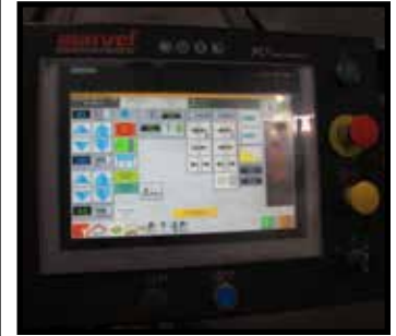
2016 MARVEL 2150A-PC3S MODEL F2150PC3S VERTICAL TILT FRAME CNC BAND SAW, WITH SIEMENS PC3 SAW CONTROL, HYD CLAMPING AND AUTO FEEDS, PLUS AND MINUS 60 DEGREE CUTING ANGLES, BUNDLE CLAMPING ACCESSORY, CONVEYOR, S/N F2150-20346-PC3S.