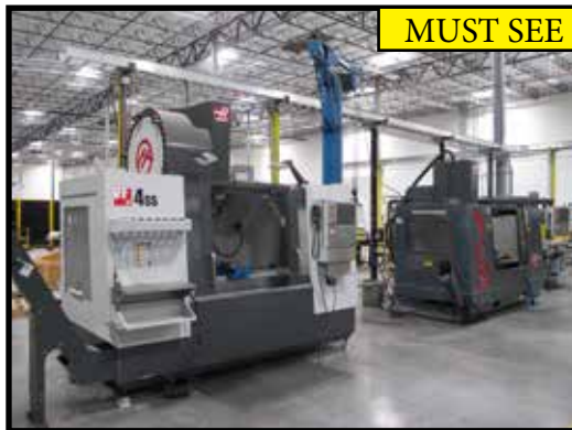
HAAS VF-4 CNC VMC'S