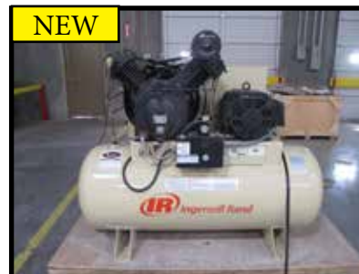
(NEW) INGERSOLL RAND 7100-E15, 15HP HORIZONTAL PISTON AIR COMPRESSOR, 120 GALLON TANK, S/N CBV468945.

2016 FLOW MODEL M4C 4080 XD 049104-3, 5 AXIS CNC WATERJET CONTOUR MACHINE S/N 131202, FLOW CNC CONTROLS, FLOW DYNAMIC XD 5 AXIS END EFFECTOR CUTTING HEAD, FLOW MDL 058007-1 94 KSI PUMP UNIT, FLOW GARNET HOPPER, 190" X 348" TABLE, FILTRATION SYSTEM, 1361 HOURS.