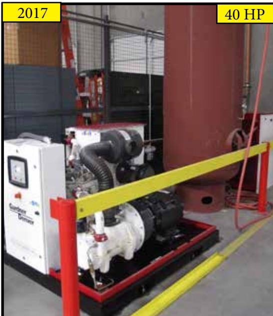
2017 GARDNER DENVER ELECTRIC SAVER 40HP ROTARY AIR COMPRESSOR, 2610 RUN HOURS, MODEL ST40