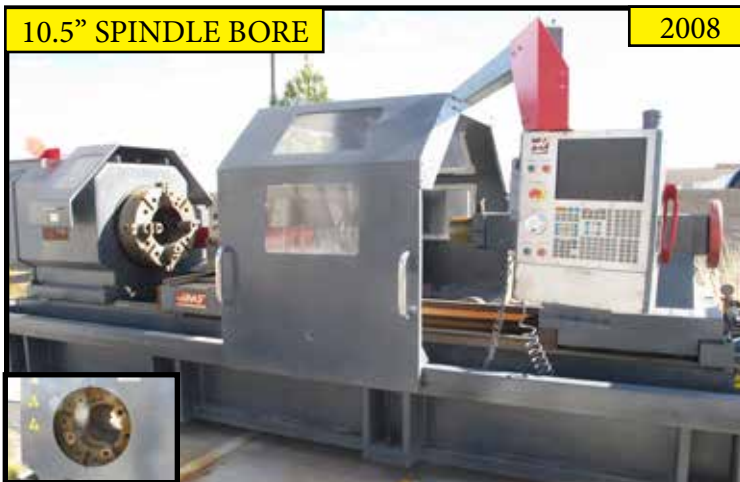
2008 HAAS TL-4 CNC LATHE, WITH 24" 4 JAW MAIN AND REAR CHUCKS, 10.5" THRU SPINDLE BORE, HYD TAILSTOCK, TOOL POST, HAAS CONTROLS, S/N 3082139.

2000 HAAS VF-11/50 CNC VMC WITH UPGRADED HAAS CONTROL, 20 STATION ATC, CAT 50 TPAER SPINDLE, 120" X 40" X 30" (XYZ), 12" X 28" TABLE SIZE, INTUITIVE PROBING SYSTEM, BRUSHLESS SERVOS, THRU SPINDLE COOLANT, PROGRAMMABLE COOLANT NOZZLE, MACRO CODE, QUICK CODE, COORDINATE SCALING & ROTATION, RIGID TAPPING, 4 AXIS READY, CHIP AUGER, S/N 20656.