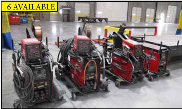
6 TOTAL) LINCOLN POWER WAVE 500 P WIRE FEED MIG WELDERS, WITH 84 DUAL POWER FEED WIRE FEEDERS (LIKE NEW)