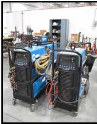
2) MILLER DYNASTY 350 AC/DC 350 AMP TIG WELDER W/ FOOT CONTROL, S/N MG4004L & MG090202