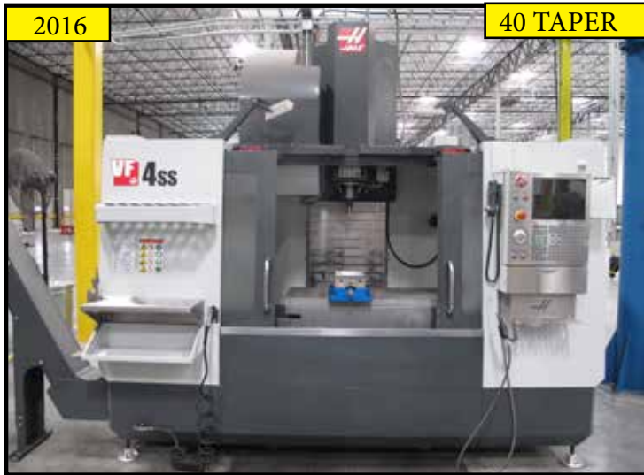
2016 HAAS VF-4SS, CNC VMC, 4 AXIS READY, 12,000 RPM, 40 STATION SIDE MOUNT ATC, CAT 40 TAPER SPINDLE, RENISHAW PROBING AND WEAR SYSTEM, HAND WHEEL, PROGRAMMABLE COOLANT NOZZLE, (4) CHIP AUGERS, CHIP CONVEYOR, 50" x 20" x 25" (XYZ), S/N 1132864.