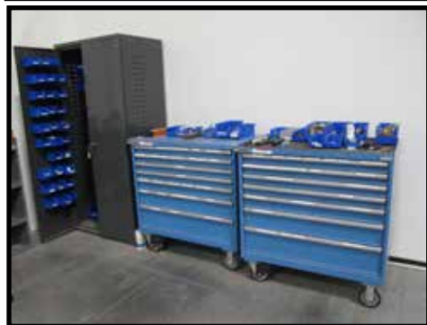
PARTIAL VIEW OF LISTA CABINET & HEAVY DUTY CABINETS.