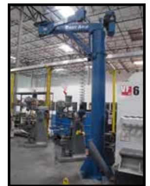
(3) GORBEL "EASY ARM" 330 LB AND 660 LB CAP INTELLIGENT LIFTING SYSTEM, FLOOR MOUNTED JIB CRANE, W/ G-FORCE 330 LB AND 660 LB CAP ELECTRIC HOIST