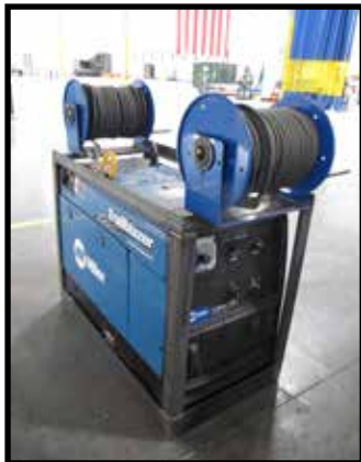
MILLER TRAILBLAZER 325 DC WELDER/ 12,000 WATT GENERATOR, GAS POWERED, CORD REELS, S/N MG520399R