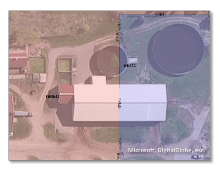
Figure 1: Buildings Split by ESZ

Although intended for the FirstNet program, the GIS data collected by DPS-ECN and MnGeo will prove useful for NG9-1-1. This was the first time that local Emergency Service Zone (ESZ) data was processed and combined into a statewide coverage. It is clear from this effort that this foundational data will require additional work before it can be incorporated in the NG9-1-1 effort. For example, ESZ boundary inconsistencies, i.e. buildings being "cut in half" (Figure 1) or gaps (yellow area) in service areas (Figure 2)must be resolved. This will require a great deal of cooperation and coordination between state, regional, county, PSAP and local officials.