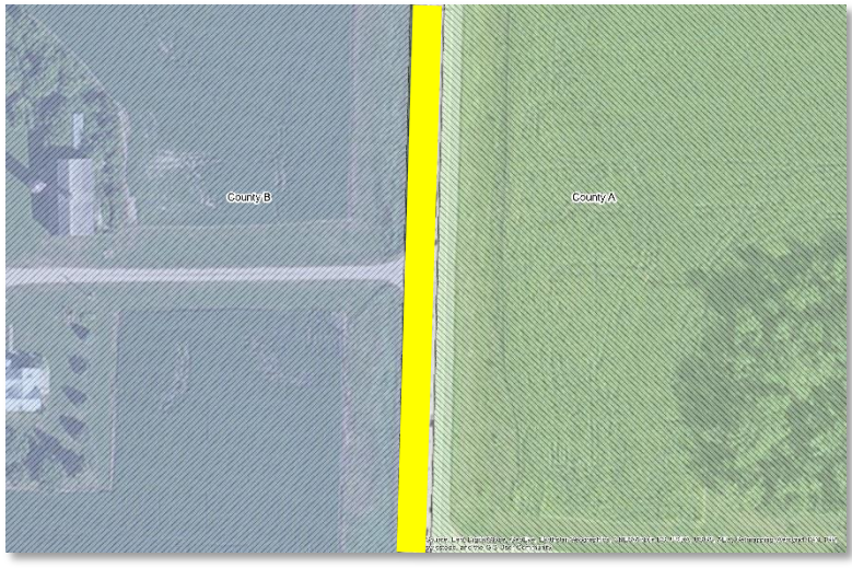
Figure 2: ESZ Gap Between Counties