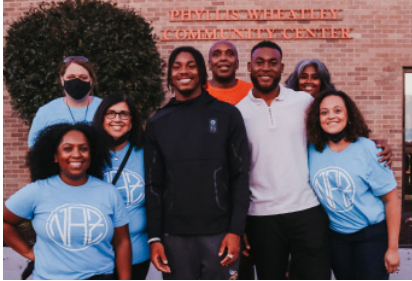
Vikings WR Justin Jefferson distributed 100 free backpacks filled with school supplies outside the Phyllis Wheatley Community Center ahead of the new school year for students.