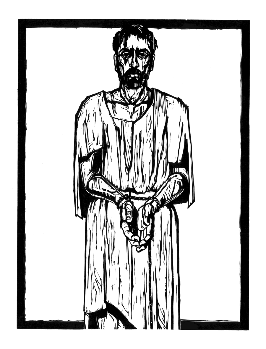
Station I Jesus is condemned to death