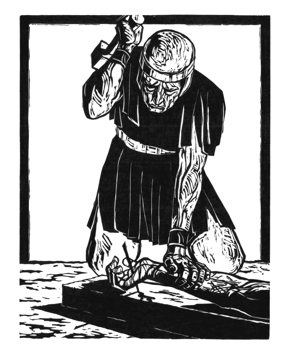
Station XI Jesus is nailed to the cross