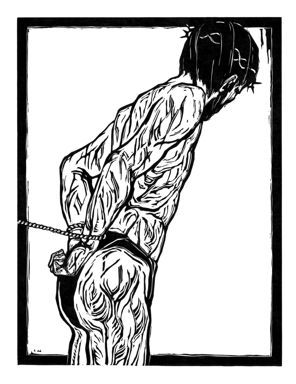
Station X Jesus is stripped of his garments