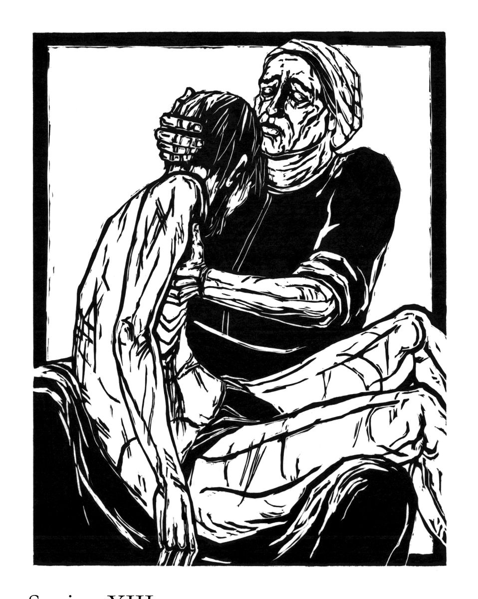
Station XIII Jesus' body is laid in the arms of his mother