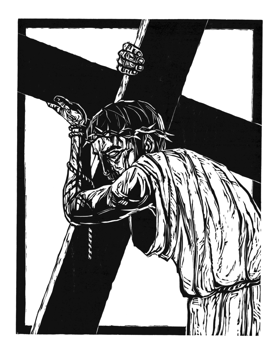
Station II Jesus takes up his cross