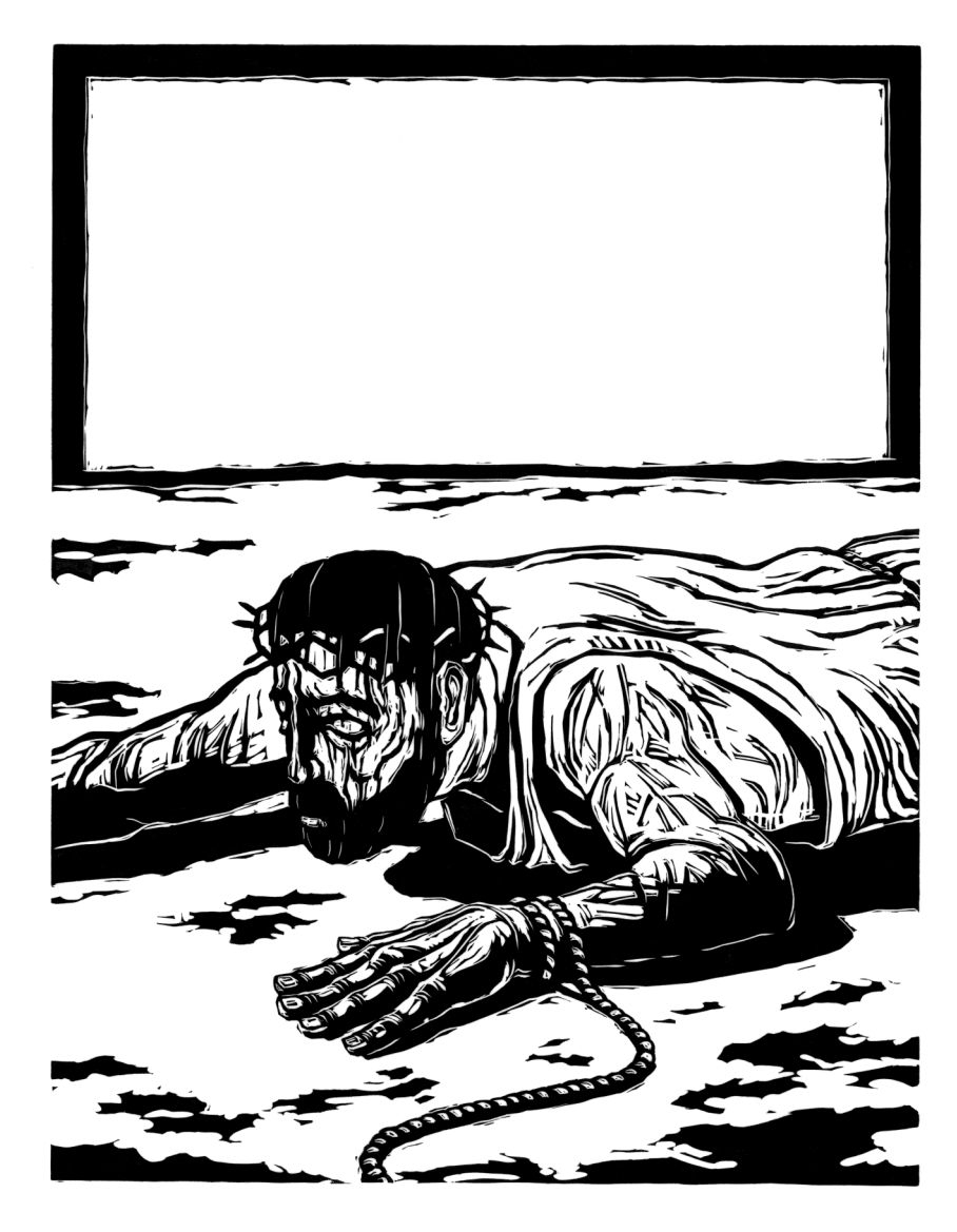
Station IX Jesus falls a third time