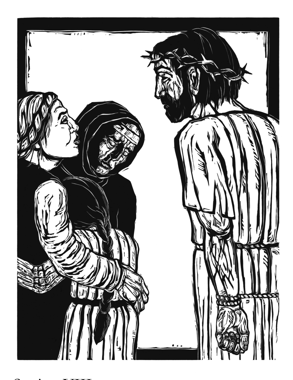
Station VIII Jesus meets the women of Jerusalem