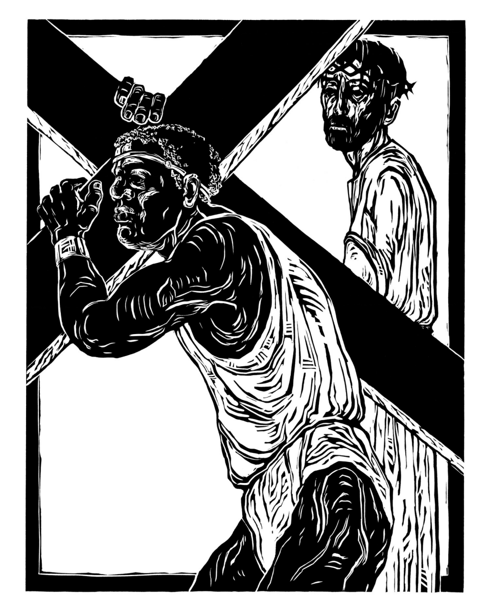
Station V The cross is laid on Simon of Cyrene