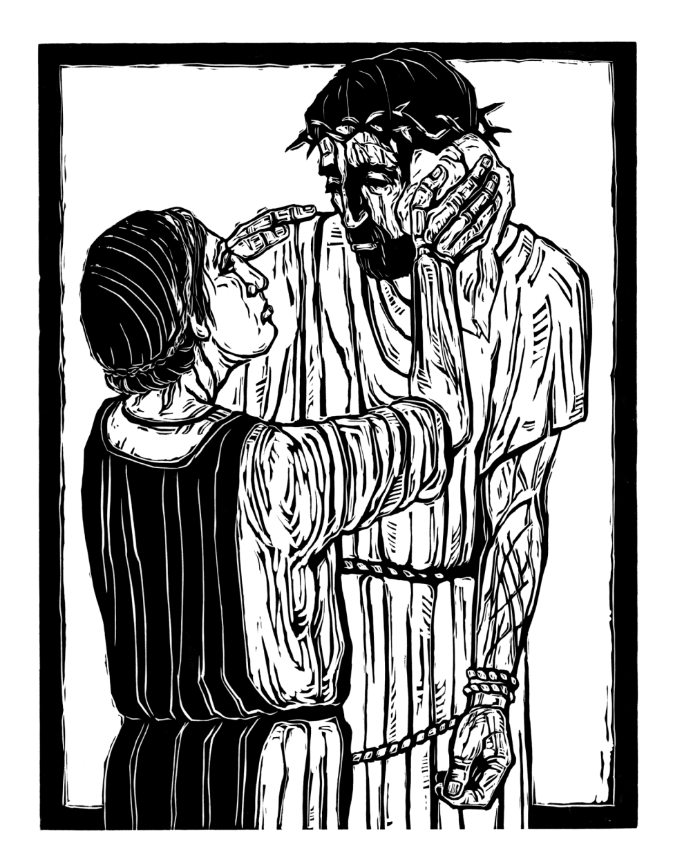
Station VI A woman wipes the face of Jesus