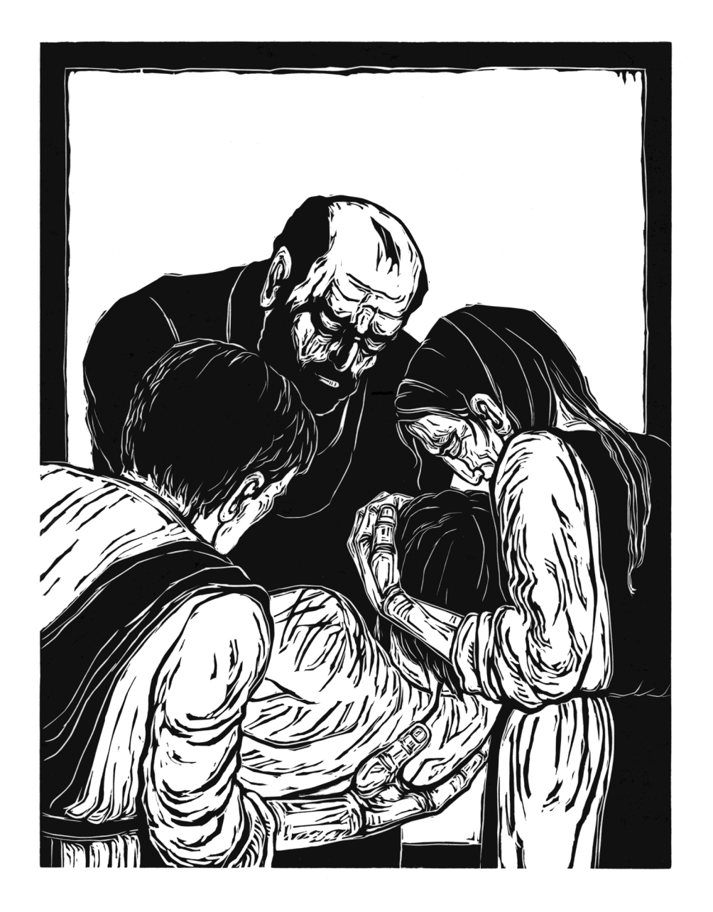
Station XIV Jesus is laid in the tomb

Suggested readings and responses for each image are included at the end of this booklet. Worshippers are encouraged to add their own prayers for each Station.