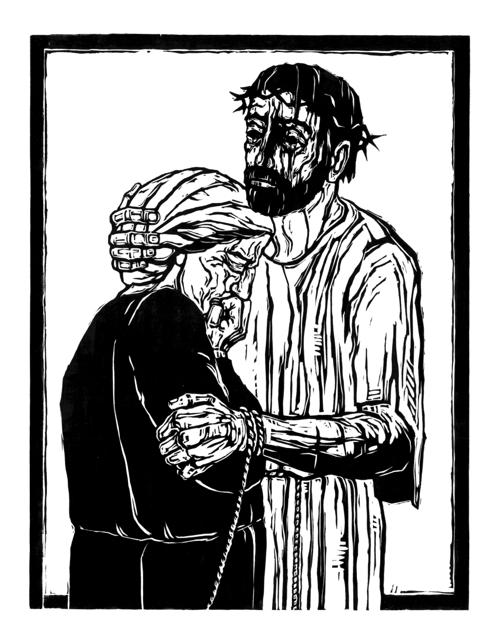
Station IV Jesus meets his grieving mother