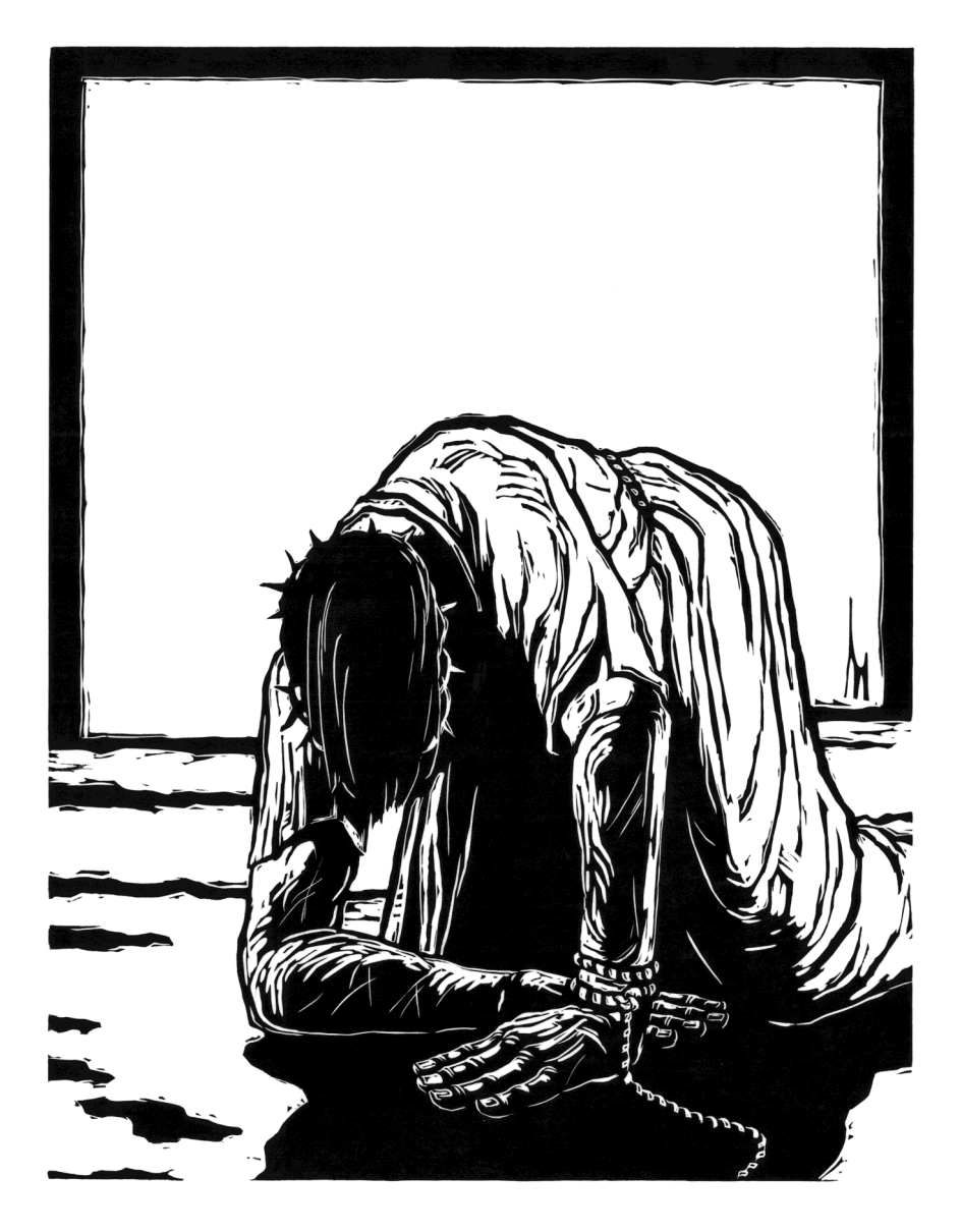
Station VII Jesus falls a second time