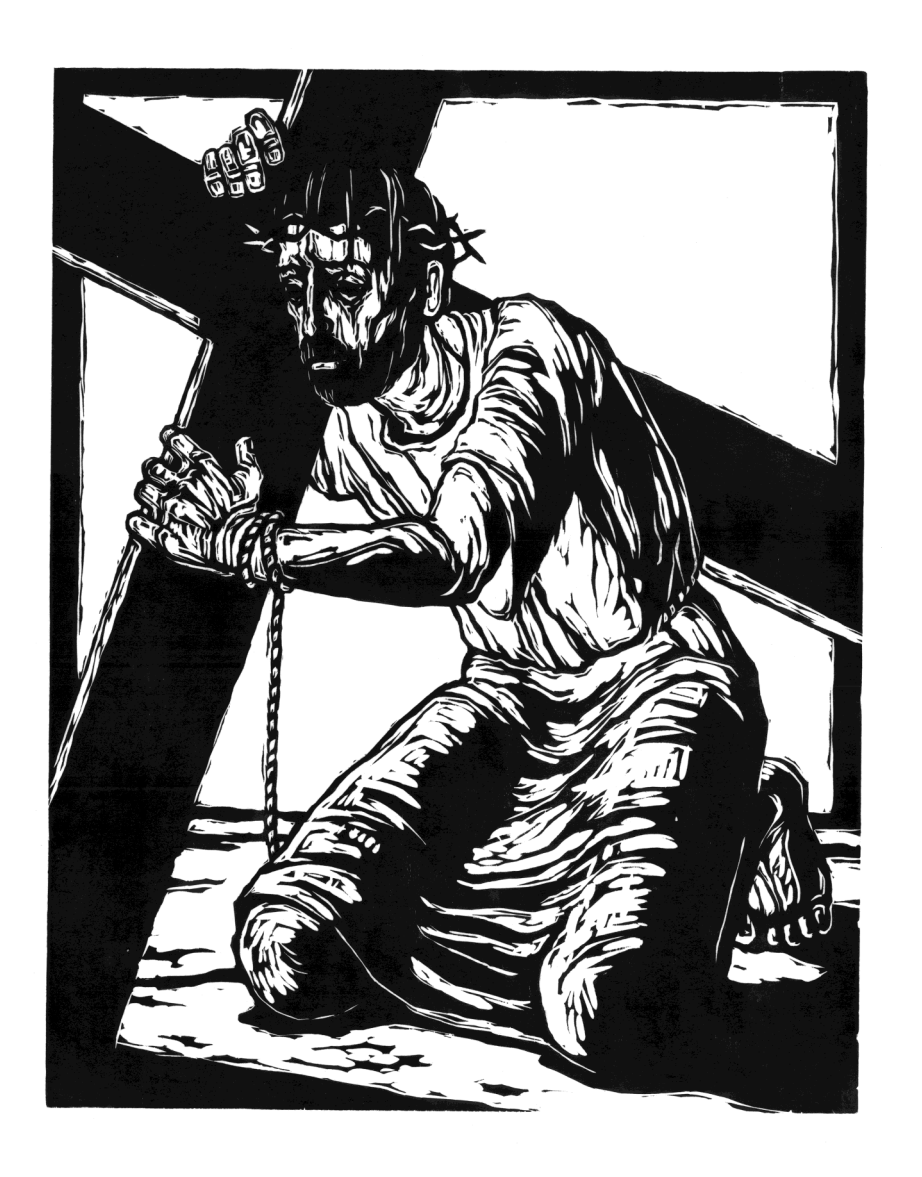
Station III Jesus falls the first time