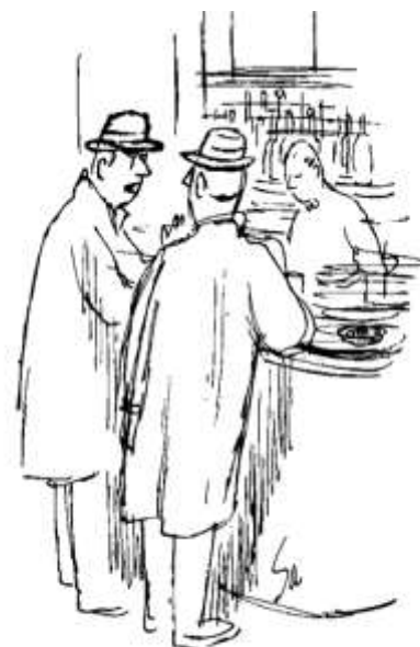
"I'm a problem drinker. Every time I have a problem, I drink."