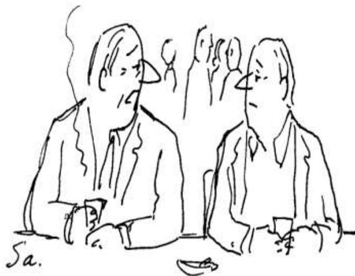
"Whenever I have a problem, I ask myself, 'How would a grown-up handle it?'"