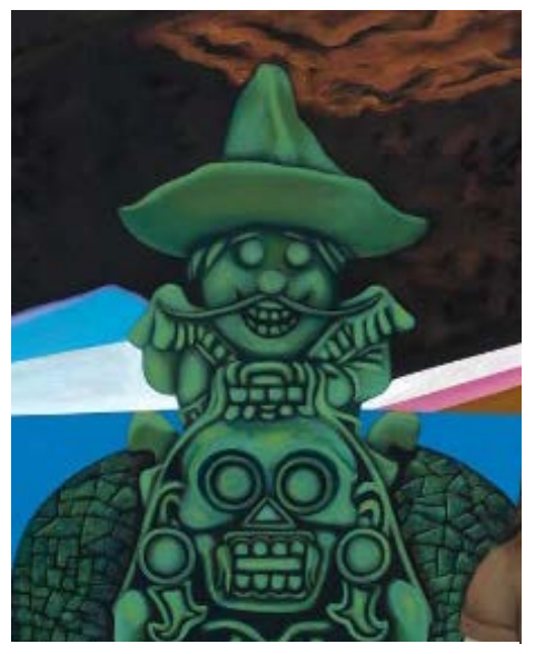
Humanscape 62 (detail)

brown culture, or share a connection to "brownness." The term gained popularity in the 1960s and 1970s and increasingly signified Chicanos and their indigenous Meso-American ancestry. Casas has captured a group of trivialized snippets drawn from popular culture making "brown" references, including a junior Girl Scout (known as a Brownie), a jade mosaic sculpture of the Aztec deity Quetzalcoatl – the feathered serpent that extends the width of the lower register of the painting, a group of Mexican women, and a Native American in profile. Huge chocolate brownies occupy the majority of the top register, and are a nod to something both commonplace and historical. The popular cake-like brownies have their origin in Meso-America. Cacao beans, the source of chocolate, was a prized agricultural product of the