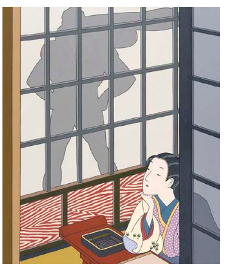
Diary: December 12, 1941 (detail)