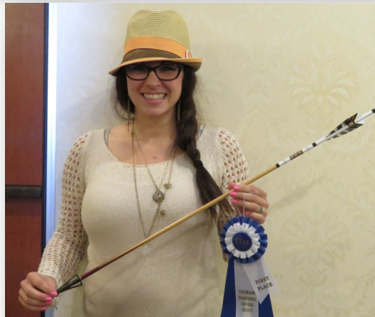
Arrow Building Contest—1st Place