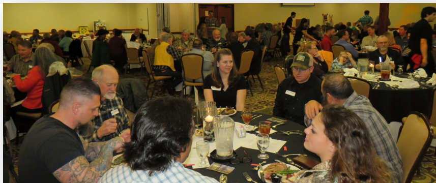
Saturday Night Festivities