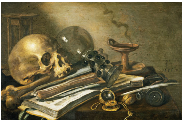
Peter Caesz Vanitas Quiet Life , 1656 From the Collection of the Kunsthistorisches Museum, Austria

This image connects to an influential tradition in still life painting called vanitas that was prominent in Dutch painting of the 17 th century. Paintings made in this tradition, including the below image by Peter Caesz, would use objects such as the human bones and tipped chalice we see here to symbolize the fleeting nature of life and the inevitability of death.