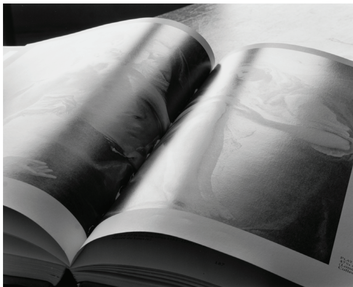
Abelardo Morell Pieta by El Greco, 1993 From the collection of the MoCP