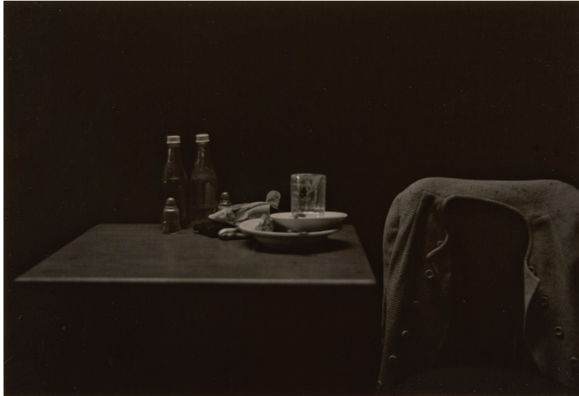
Roy DeCarava Ketchup Bottles, Table and Coat 1952, printed 1982. From the collection of the MoCP

Roy DeCarava captured life in the African American community in Harlem from the 1950s through the 1990s in his characteristic moody, and dark style. In his image Ketchup Bottles, Table and Coat , 1952, DeCarava's use of deep, dark tones hides visual clutter, in what appears to be a diner, to focus our attention on select objects in this scene. This impromptu still life—a single place-setting, the remnants of a meal and a heavy coat hung on the back of a chair—evoke a melancholy story about a meal eaten alone.