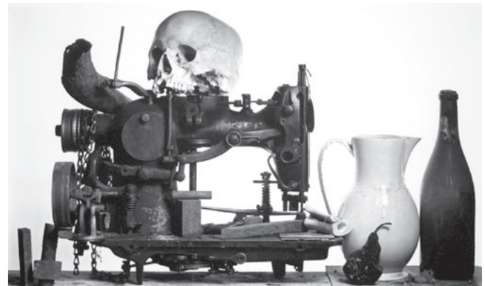
Irving Penn Composition with Skull and Pear 1979/81 From the collection of the MoCP

Irving Penn is best known for his fashion photographs that, beginning in the 1950s, defined a new look for magazines and fashion photography. By placing models against plain backdrops, Penn allowed fashion and the body to stand alone as the subject of his images. He also created elegant and sparse still lifes for clients including Clinique, as well as for his own personal interest, and would often render beautiful seemingly mundane or unattractive items such as in the series of still lifes he made by photographing cigarette butts retrieved from the gutter. Many of Penn's images, including the image Composition with Skull and Pear 1979/81, evoke the exotic as well as the transitory nature of life.