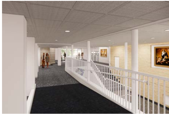
Interior View of Addition between Church & Parish Center