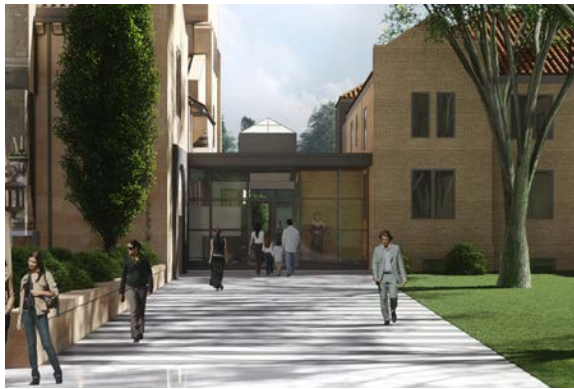
Summit Ave View