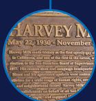
Rainbow flag, designed by Gilbert Baker, debuts. Harvey Milk elected as San Francisco Supervisor and assassinated in the same year