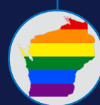
Wisconsin becomes the first state to outlaw discrimination based on sexual orientation