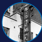
The Stonewall Riots