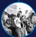
First Gay Pride Marches in New York, Los Angeles, San Francisco and Chicago