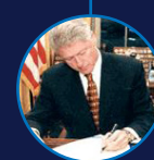
President Bill Clinton signs "Don't Ask, Don't Tell"