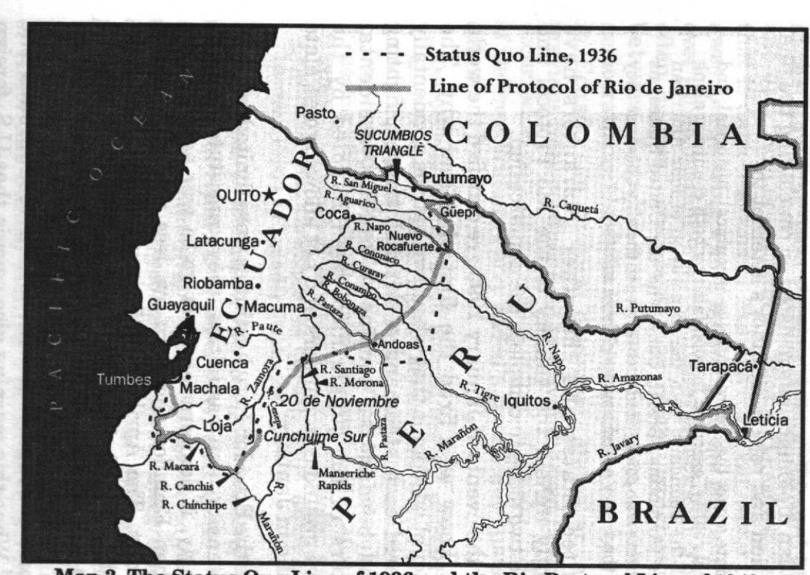
Map 3. The Status Quo Line of 1936 and the Rio Protocol Line of 1942.

Adapted from Bruce Wood, The United States and Latin American Wars , 1932-1942, New York: Columbia University Press, 1966, Appendix.