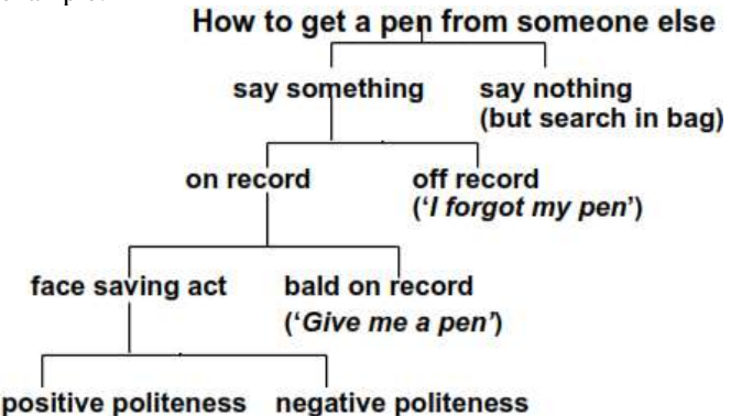
Figure 2: How to get a pen from someone else – (following Brown & Levinson 1987 -G.Yule [2:66])-

This model receives high appreciation from many researchers. Brown and Levinson rank strategies from Don't do the act on record baldly, which has no linguistically encoded compensation, through a sequence of escalating politeness strategies to Don't do the act, where the face is too great to be compensated by any language formula so that the most appropriate politeness strategy is not to do the act. Additionally, according to them off-record utterances are assumed more polite than bald-on-record ones. Let's take Yule's illustration, following Brown and Levinson, as an example: