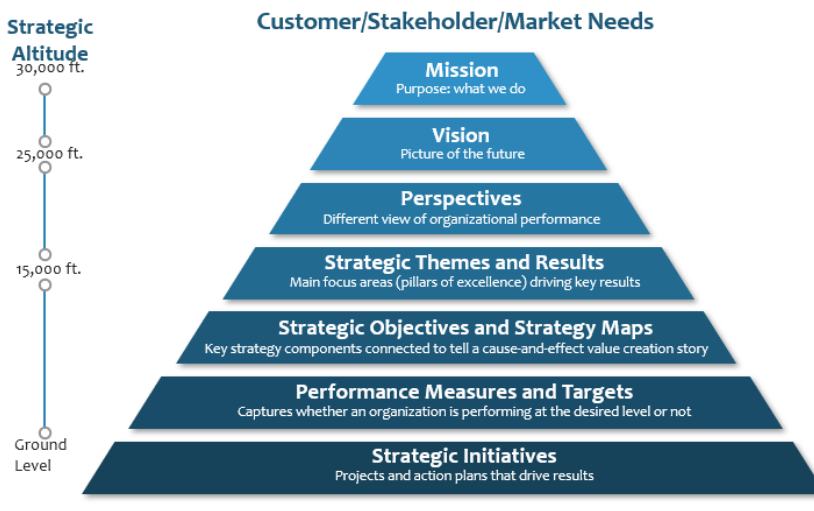
Figure 1: The Logic of Balanced Scorecard Strategic Planning

A key strategy development step is the creation of several high-level strategies (i.e., strategic themes), associated strategic results, and strategic objectives for each theme. Strategic themes are aligned with the organization's vision and mission, and the theme's strategic result describes a high-level outcome of successfully implementing the strategic theme. Usually three or four themes define the business strategy of the organization at a high level. Examples of strategic themes include Customer-Focused Operational Excellence, Market Driven Technological Excellence. Strategic Partnering, and Growth Through Innovation. Many other themes are possible,