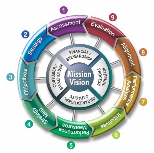
Figure 5: Building and Implementing a Balanced Scorecard: Nine Steps to Success ™

industry, non-profit, and public sector organizations, but the development steps are the same. Starting with step one, Organization Assessment, organization pains, enablers and values are developed, change management and scorecard development plans are prepared, and mission and vision are validated. In step two, Strategy, the customer and stakeholder value propositions are defined and used to create the organization's strategy (strategic themes and results). Strategic Objectives (the DNA building blocks of strategies) are developed in step three, and followed by step four, where Strategy Maps (showing the causal relationships among the objectives leading to customer value) are developed. Step five, Performance Measures and Targets, is used to develop the critical strategic measures that provide information to track strategy execution. The building process ends with step six, identification of new Strategic Initiatives, or projects, that form the basis for successful strategy execution.