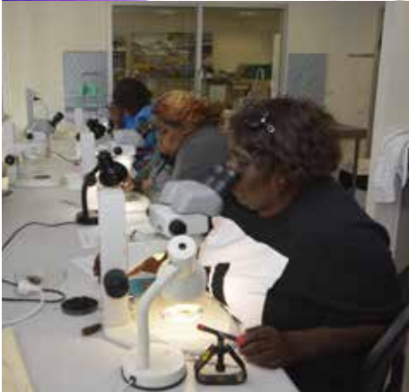
Pila Nguru Aboriginal Corporation © the Department of Biodiversity, Conservation and Attractions, WA.