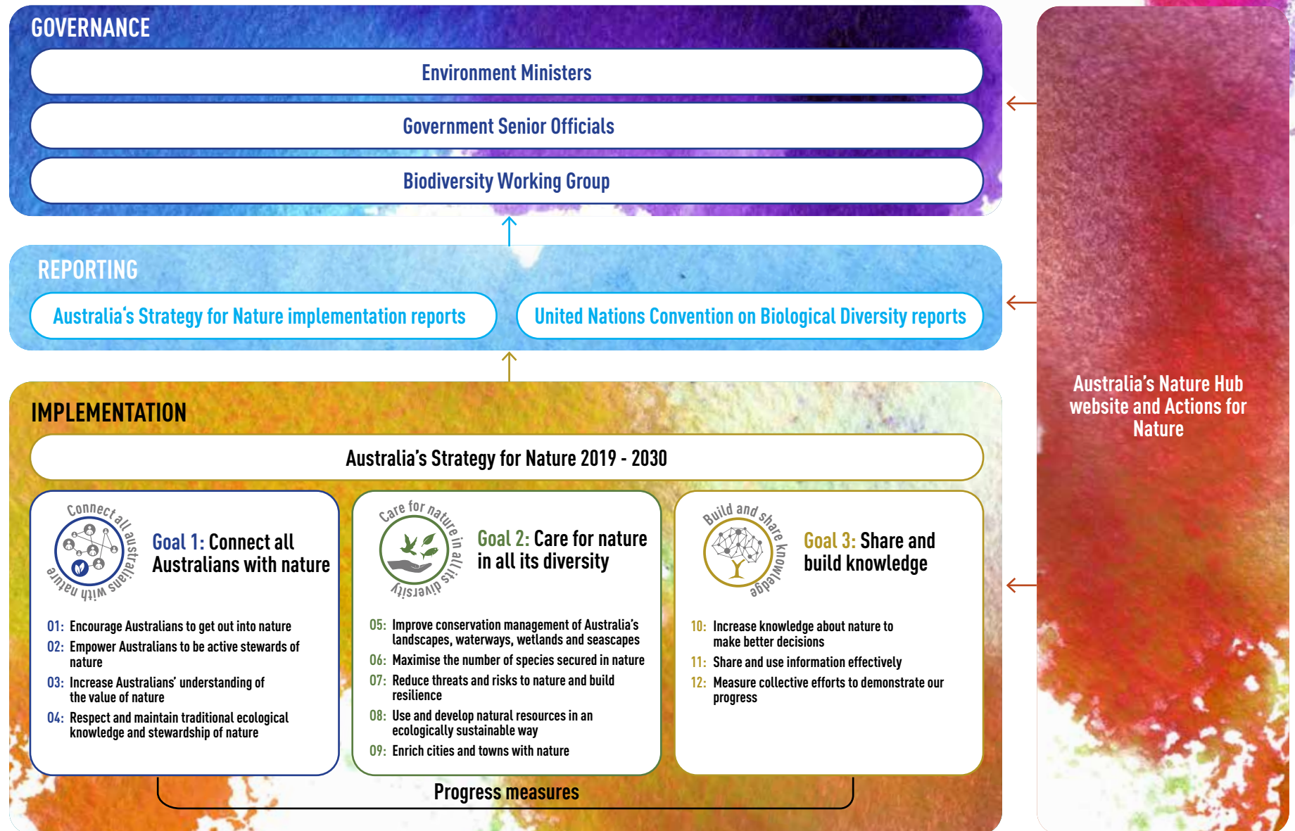
Figure 4: Implementation and governance of Australia's Strategy for Nature