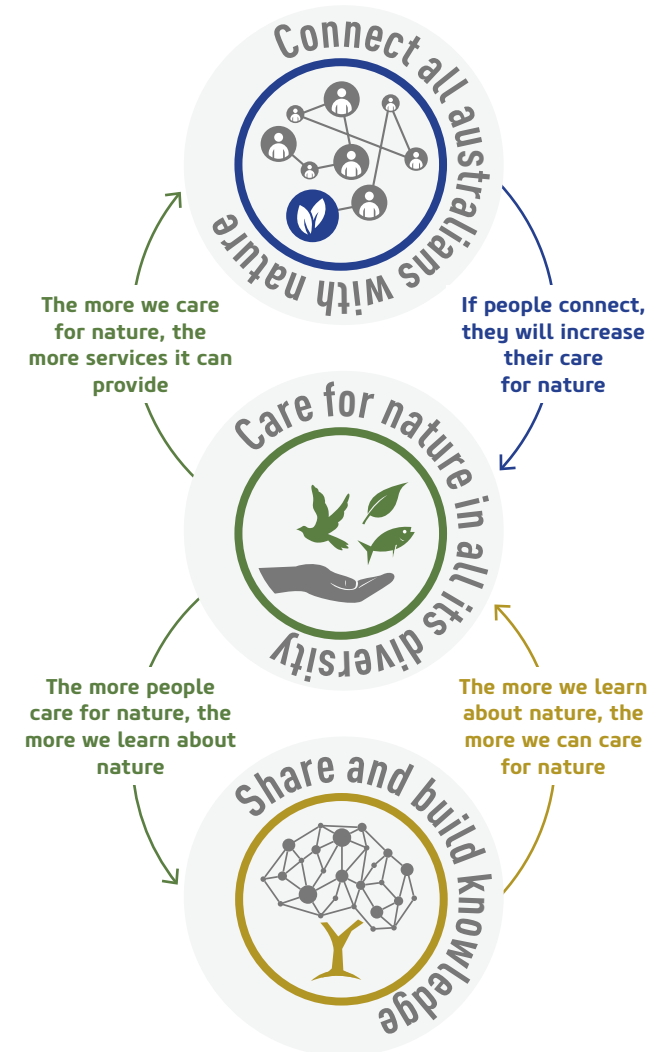
Figure 2: How the strategy's goals link together

The strategy has three priority focus areas, or goals , underpinned by twelve objectives . The goals work together in continuous loops designed to reinforce each other (Figure 2). By connecting people with nature, we enhance their desire to care for nature, which in turn builds knowledge that can be shared to improve our care for nature and the benefits we receive from connecting with nature. Each objective has a number of progress measures , which will be used to track and report on the success of the strategy.