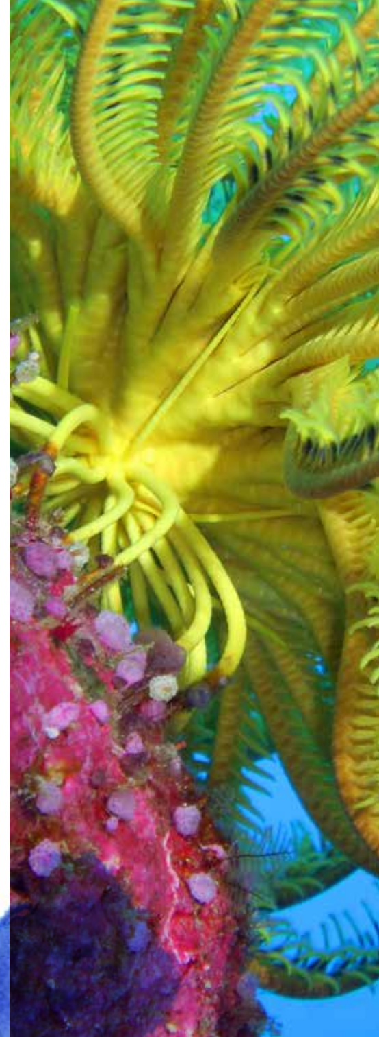
Yellow feather star in the Mermaid Reef-Rowley Shoals