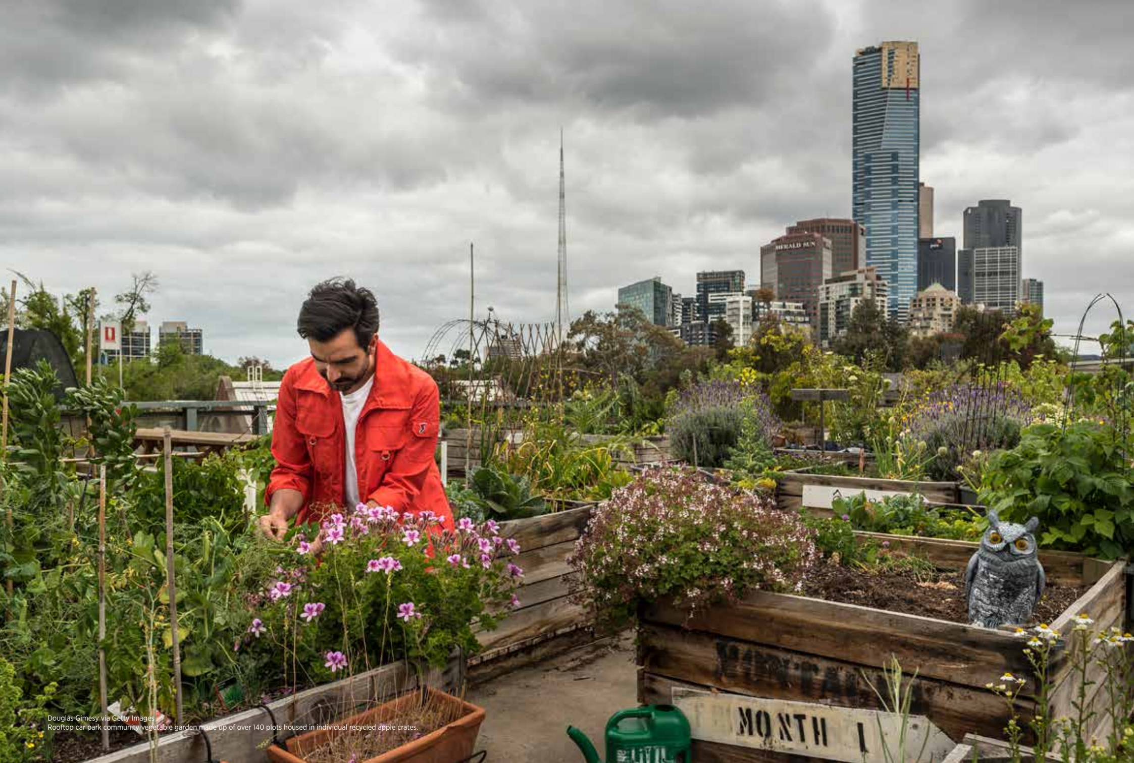
Rooftop car park community vegetable garden made up of over 140 plots housed in individual recycled apple crates.