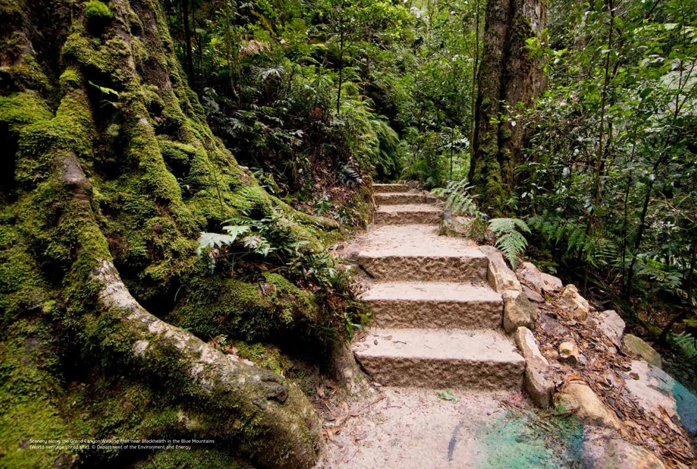
Scenery along the Grand Canyon Walking Trail near Blackheath in the Blue Mountains (World Heritage Listed site).