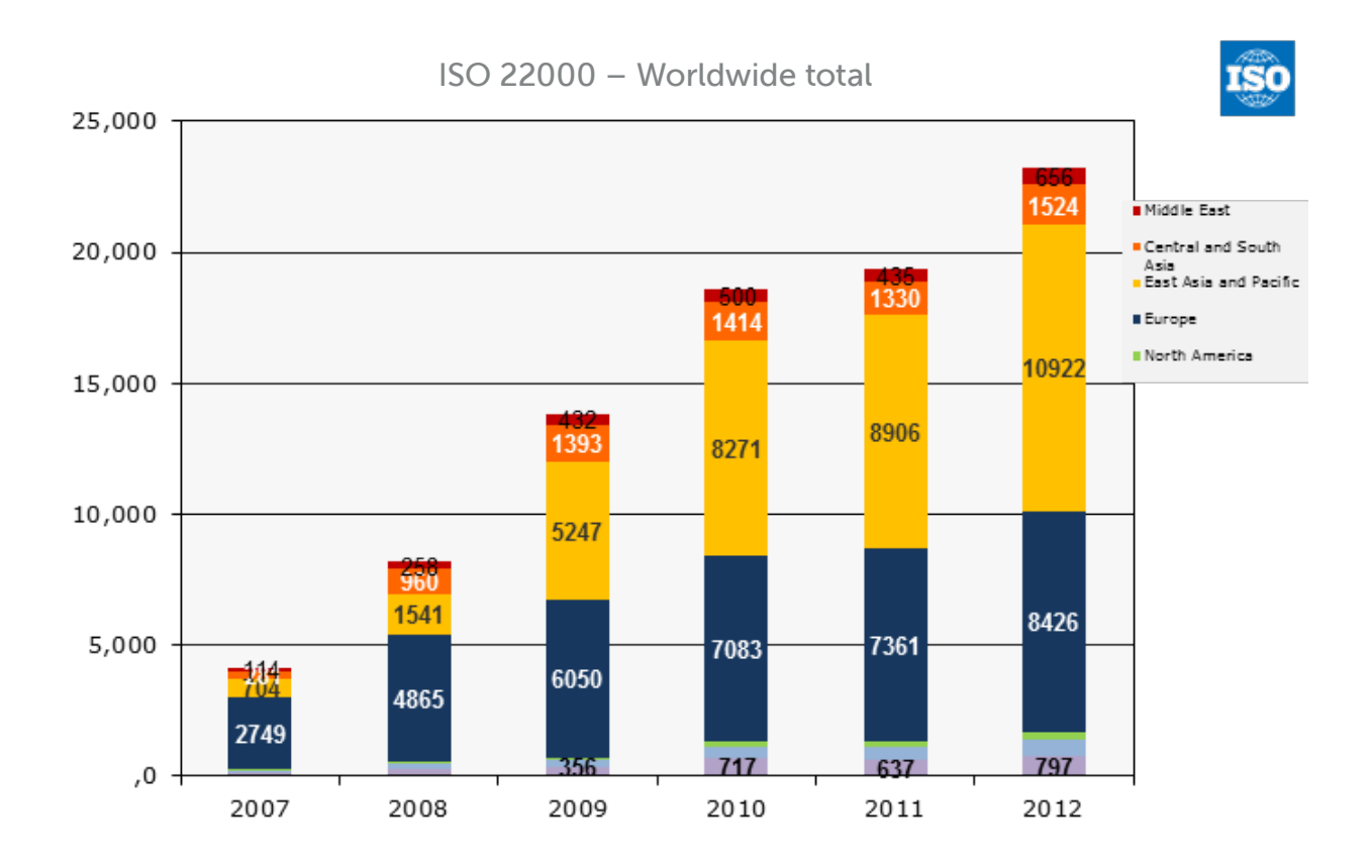
Table 1: ISO Survey of certifications

The number of companies in the food chain opting for certification to ISO 22000:2005 is rapidly increasing and by the end of 2012, a total number of approximately 23.000 companies had been certified. See Table 1.