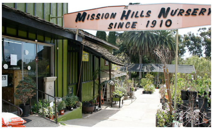
The Kate Sessions Mission Hills Nursery, also known as the San Diego Nursery, was located over most of the North Florence Heights subdivision which was bounded by Stephens Street, Lark Street, the cliffs overlooking Mission Valley, and Mission Hills Park/Pioneer Memorial Park.

The Residential Court Multiple Property Listing is a discontiguous grouping of approximately 149 residential courts located throughout the Uptown survey area. Eligible under San Diego Criteria A and C, this potential multiple property listing (MPL) reflects the distinctive characteristics of courtyard design, as well as special elements of the Uptown Community's social history related to multi-family housing, and its architectural development associated with local transportation patterns. The MPL has a period of significance of 1900-1960 and is significant under the themes of "The Railroad Boom and Early Residential Development: 1885-1909;" "The Panama-California Exposition and Streetcar Suburbs: 1909-1929;" "Great Depression and World War II: 1929-1948;"and "Postwar Development,