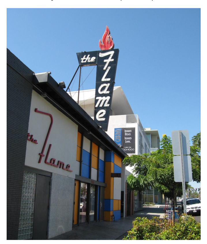
The Flame has been identified as having potential significance to LGBTQ history in the Uptown community.

Substantial public outreach with the local community planning group, regional and local preservation groups, and members of the community occurred throughout the development of the Historic Context and completion of the survey. This information was considered and often incorporated into the results and recommendations of the survey. As a result, the Uptown Reconnaissance Survey identifies as potentially significant all individual resources specifically identified as such by the community. The exception is properties that have been identified as potentially significant under the theme "Neighborhood Revitalization and the LGBTQ Community: 1970-Present." When the survey work was conducted in 2004-2006, only properties that were 45 years old or older upon completion of the