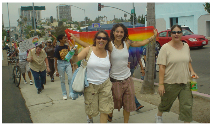
LGBTQ activism in Hillcrest has been a significant facet of Uptown's diverse history.

The next wave of activity in the planning area was touched off by the Second World War, at which time San Diego was transformed into a thriving metropolitan center and a hub of wartime production. This culminated in a dramatic population increase between 1940 and