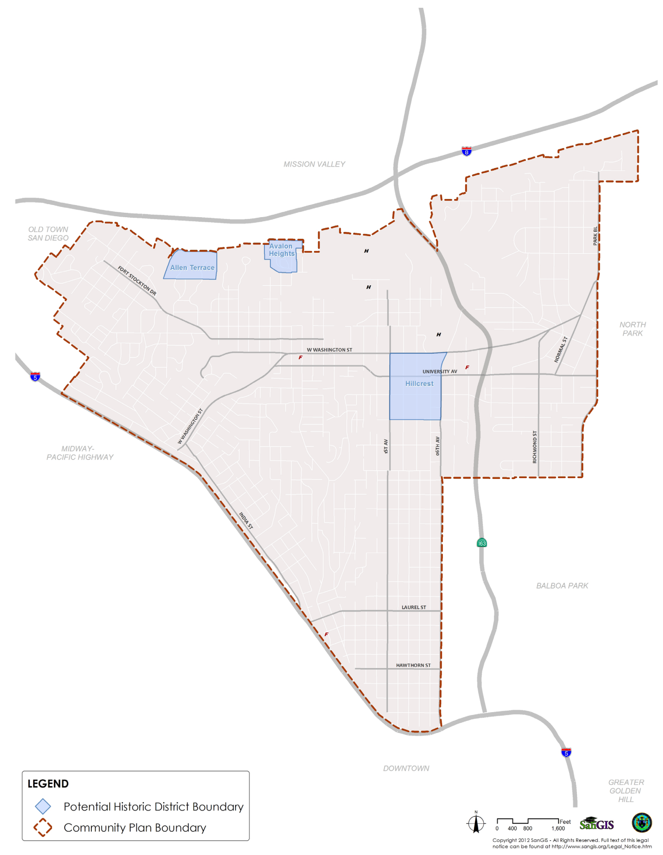
FIGURE 10-4: LOCATION OF POTENTIAL HISTORIC DISTRICTS IDENTIFIED DURING PUBLIC OUTREACH