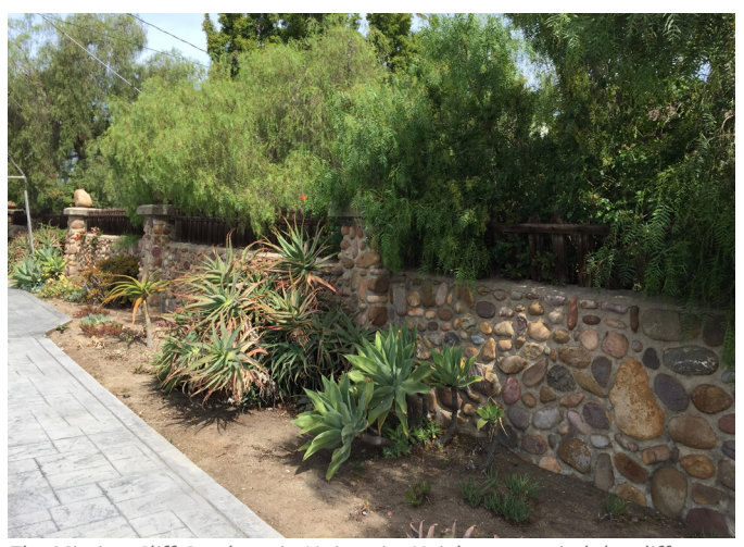
The Mission Cliff Gardens, in University Heights, occupied the cliffs overlooking Mission Valley from 1898 to 1942.