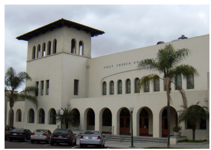
The First Church of Christ Scientist was built in 1909 by Master Architect Irving J. Gill.