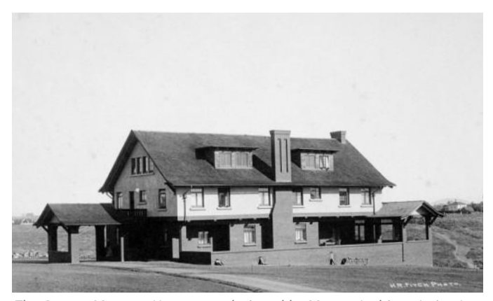
The George Marston House was designed by Master Architect Irving J. Gill in 1904.

As of February 2016, the Uptown community is home to 340 individually designated historic resources (Table 10-2 and Figure 10-1) and 2 designated historic districts (Figure 10-2) – Mission Hills and Fort Stockton Line containing 209 contributing resources that have been listed on the City's register by the Historical Resources Board. These resources reflect a range of property types, from single and multi-family to commercial, hotel, and institutional. Also included are the Quince Street Footbridge, the Spruce Street Suspension Bridge, the First Avenue Bridge, and the Jimmy Wong's