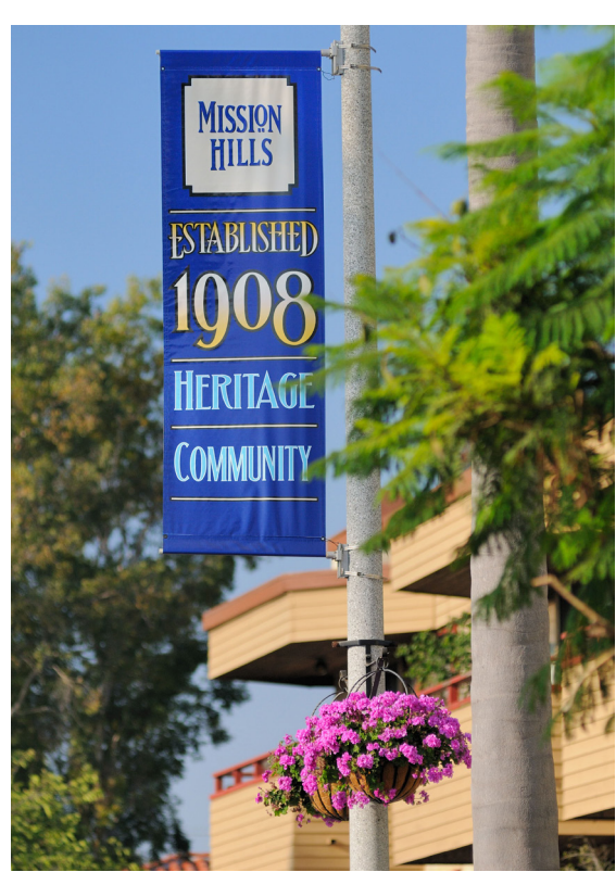
Uptown contains some of the City's historic neighborhoods.

The Uptown Historic Preservation Element contains specific goals and recommendations to address the history and cultural resources unique to Uptown in order to encourage appreciation of the community's history and culture. These policies along with the General Plan policies provide a comprehensive historic preservation strategy for Uptown. The Uptown Historic Preservation