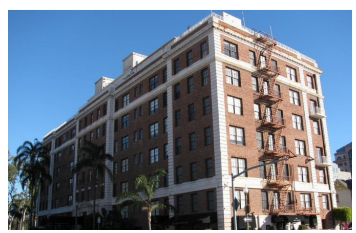
Park Manor, built in 1926, was developed during the expansion of the streetcar, which made development in the community more feasible.

(*The 2004-2006 survey only evaluated properties constructed prior to 1961.)