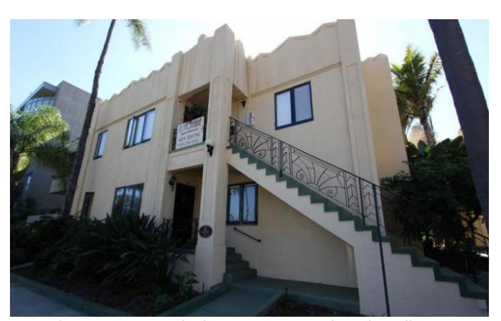
Le Moderne Apartments, built in 1930, is an early and excellent example of the art deco architecture in style during the 1930's and 1940's.

Throughout Uptown, the rapid rate of residential development gave rise to the construction of small commercial nodes along the Fifth Avenue, University Avenue, Washington Street and Park Boulevard streetcar lines. Patterns of development in Uptown, both during and after the Exposition, underscore the relationship between mass transit and city-building, with the majority of new construction occurring near the streetcar routes. Development in Uptown remained remarkably steady in the years following the close of the Exposition, as the city's population nearly doubled in size between the years 1920 and 1930. The influx of newcomers facilitated a wave of continuous development in the planning area, and by 1921 the number of developed parcels far exceeded the number of unimproved properties. The continuous growth of Uptown's population sparked the construction of a number of commercial districts by the early 1920s - some along the streetcar routes, and others in more outlying areas, reflecting the proliferation of the automobile after World War I. Among the most common businesses constructed in the early 1920's were automobile garages which provided residents with facilities to service their personal vehicles. Several gasoline and service stations were also constructed on prominent and accessible corners in the aforementioned business districts.