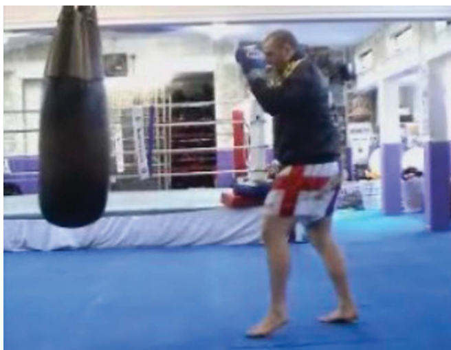
Figure 9. Front leg knee starting position.

negative correlation to performance. This is further corroborated by authors who suggest that once an aerobic base is achieved, sport-specific team practices and games are sufficient to maintain aerobic fitness in anaerobic-dominant sports (17,56,57). Training programs therefore need to be directed toward high-intensity training such as interval and repetition training. Many athletes, however, use long distance running as a means to rapid weight loss (RWL). This, however, may be to the detriment of sports performance and perhaps more emphasis needs to be placed on nutritional interventions (but those based on scientific research). RWL is briefly discussed later in this text.