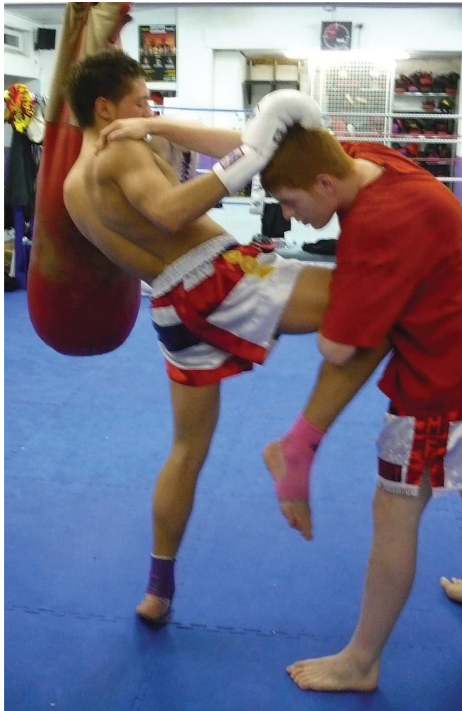
Figure 7. Knee.