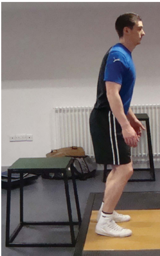
Figure 12. Drop land.

incidence of these injuries through its positive adaptations on the structural integrity of all involved joints. For example, as well as an increase in muscle strength, tendon, ligament, and cartilage strength would also increase along with bone mineral density (35,37,92). Furthermore, boxers tend to use (and therefore develop) the anterior musculature more than the posterior (2), thereby leaving them exposed to muscle strains in the weaker muscles. S&C training can ensure the development and maintenance of proper ratios. Most significantly and pertinent to performance, increasing antagonist muscle strength may increase movement speed and accuracy