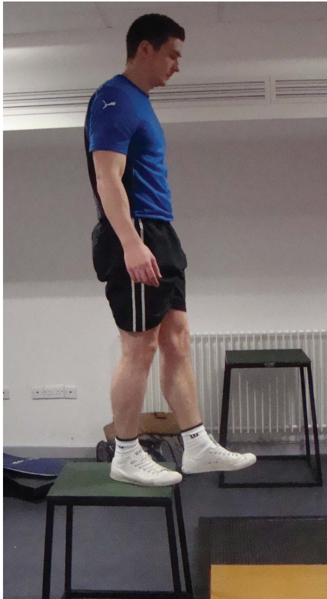
Figure 13. Step from box (before drop land or drop jump).

ethos of quality over quantity should be enforced.