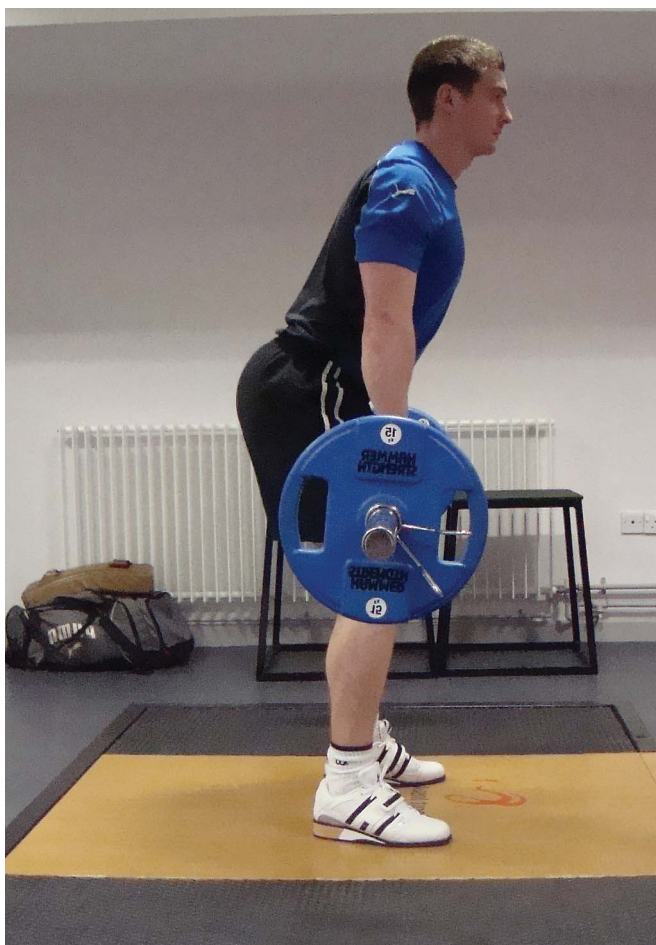
Figure 8. Second pull position.