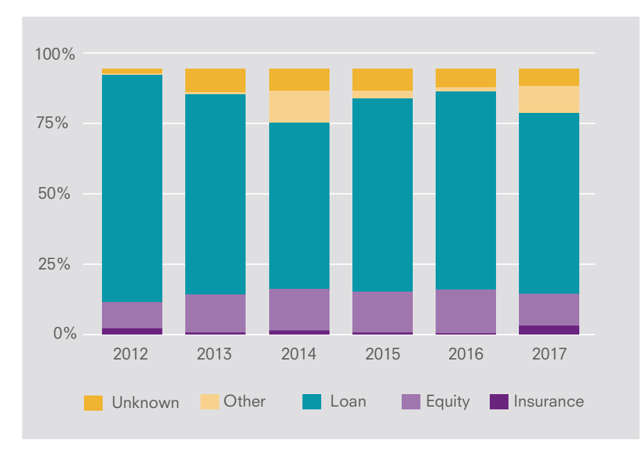
Figure 1: DFI investment portfolio by financial instrument (%)44

Institutional risk aversion is one of the factors that drives an over-reliance on loans and quasi-loans because debt ensures greater certainty of returns and better protection of investors in the event of bankruptcy. Equity, on the other hand, carries greater reputational and financial risks since investors become legal shareholders of the firms. This can be problematic where local firms do not pass DFIs' IDD muster. Local firm owners may also resist equity investments – they may not want to dilute their shareholdings, be exposed to close scrutiny, or may be family-owned businesses not open to bringing in external shareholders.