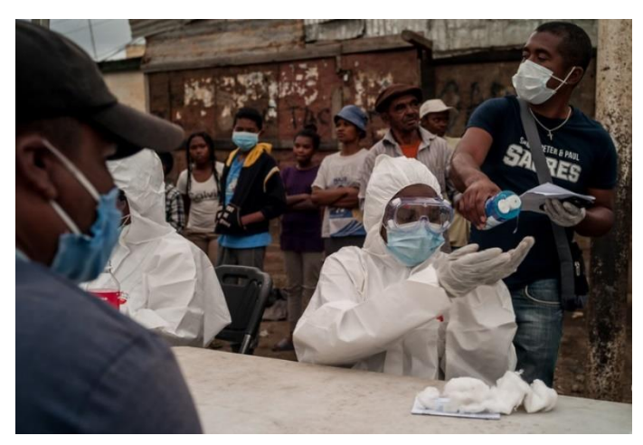
Image 3: COVID-19 testing in Madagascar by World Bank (Flickr Creative Commons).

Gavi has adopted certain requirements to which countries must adhere in order to access HRH funding. For example, they should have adopted national HRH plans that show how they will pay for and sustain HRH-related costs as they move towards transition. Gavi's resources play a catalytic role in this connection. Recurrent investments, for example in health workers' salaries, are generally discouraged but not forbidden.<sup>77</sup> Areas of low coverage of immunisation have high priority. Countries other than lowincome countries may invest in recurrent costs, but only in exceptional circumstances.