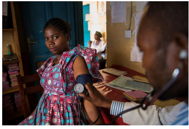
Image 1: Female patient in the Democratic Republic of the Congo by Mickael Franci (Cordaid).

primary and secondary healthcare led to health spending being raised from 8% of the national budget in 2017 to 21% in 2019.