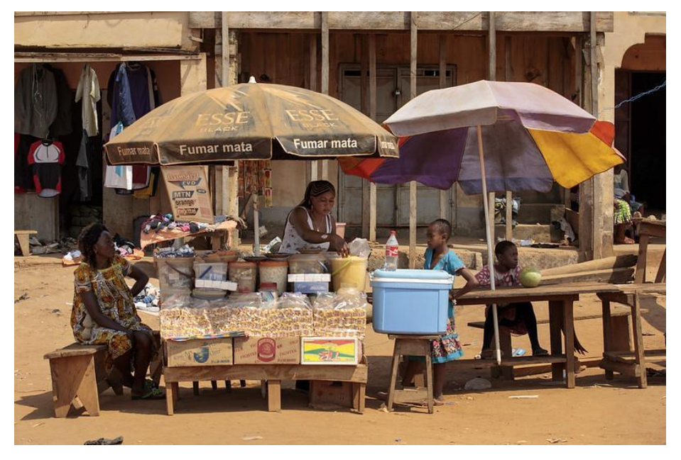
Image 6: Cameroon UN Women's Gender Road Project.

In terms of gender in its governance structure, the Global Fund has clear guidelines for including gender equality as a principle in operations, boards and committees.<sup>150</sup> The Global Fund acknowledges the challenging nature of achieving gender parity in its board and has taken steps to address this, by including access to gender expertise and requiring all board members to champion gender equality. Finally, the Global Fund is planning to set gender equality as a central measure of success in future evaluations of its programmes and policies.