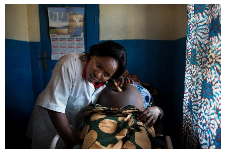
Image 2: Health worker in the Democratic Republic of the Congo by Mickael Franci (Cordaid).

By putting co-financing requirements and agreements in place, Global Fund and Gavi encourage governments to raise their health budgets. Ideally, domestic resources are raised for all health programmes and not for specific ones, because there is a risk that resources are simply shifted from other – also essential - health programmes. The GFF refers to the pooling of funds for health and highlights its intention of supporting recipient countries in this area of health finance. Country cases will show how this plays out in reality with concrete examples of improvements in the pooling of fragmented health funds.