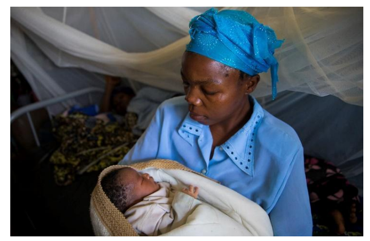
Image 5: Newborn in the Democratic Republic of the Congo.

From an inclusivity perspective, it should be avoided that the community is presented as the object of interventions. In other words, the community consists of the key affected populations, i.e. the beneficiaries. There should be equity in that all individuals have the right to the care that they need. The 3Gs believe in the importance of reaching every individual including the 'disproportionately affected', the unreached, the disadvantaged and the vulnerable. The 3Gs offer opportunities for requesting funding for strengthening CSOs and networks in advocacy and accountability. The Global Fund sees the empowerment of this 'voice of the community' as necessary for effective