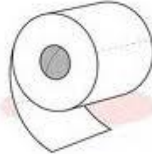
This is wrong. (bad)