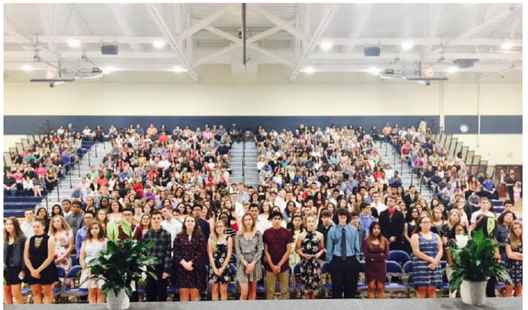
Above: Academic Varsity Letter recipients.