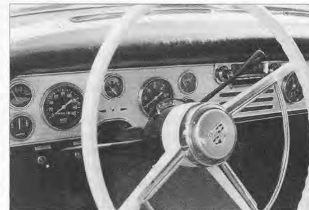
Opposite angle views of the dashboard.

Unfortunately, a reputation is tough to shed. Once the seed is planted, the weed will grow and it is virtually impossible to change the perception. Probably the best example is the innovative Corvair by Chevrolet introduced for 1960. It was enjoying a good deal of success, as a sporty little performer. However, once Ralph Nader suggested that the car was unsafe at any speed, even mighty General Motors couldn't stop the bleeding.