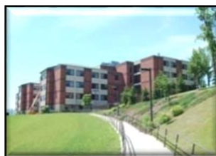
Saint Benedict Hall