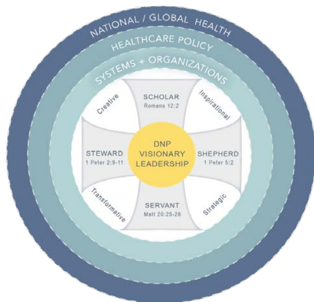
CCU Model of DNP in Visionary Leadership