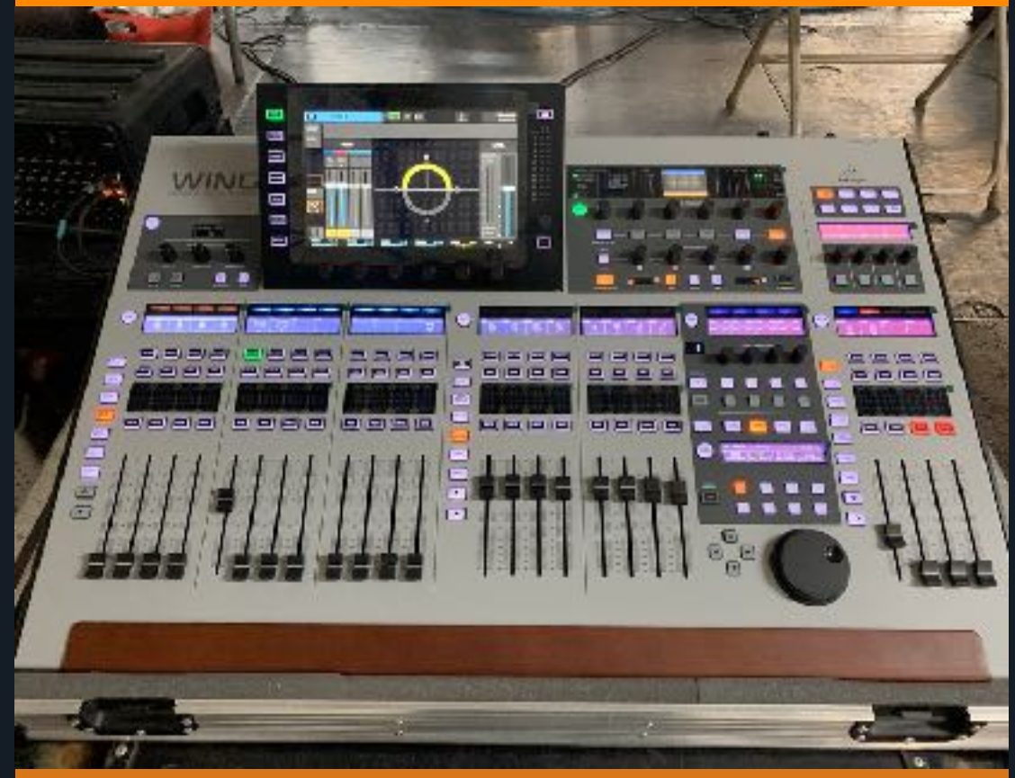
ALLEN & HEATH QU16