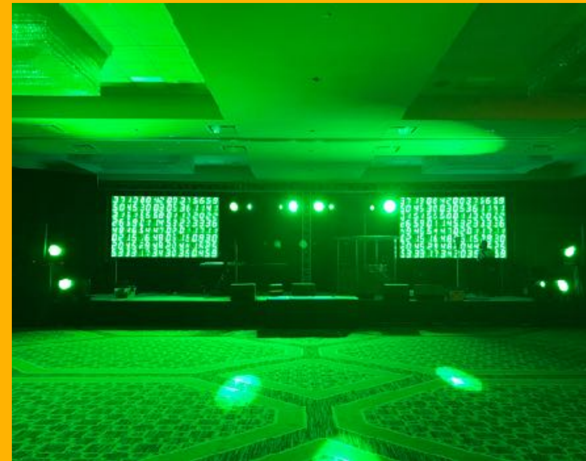
P 4.8 SCREEN