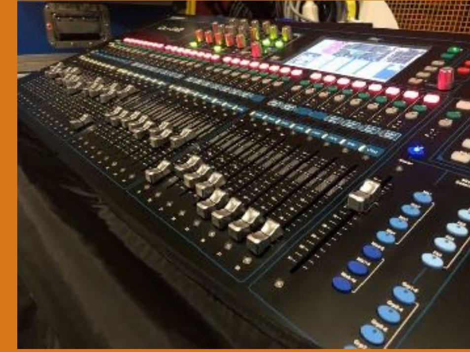
ALLEN & HEATH QU32