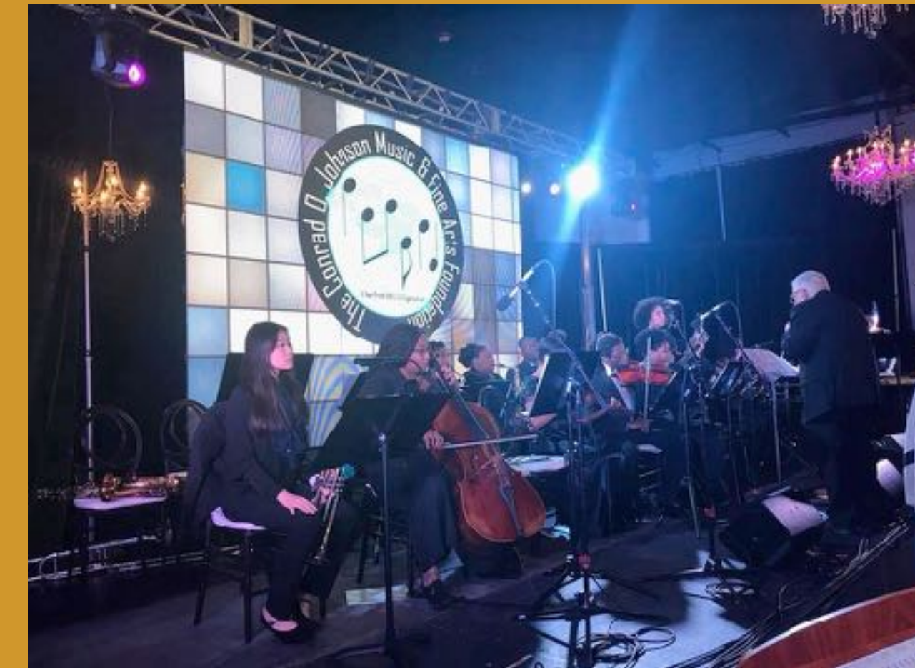
P 10 SCREEN MESH