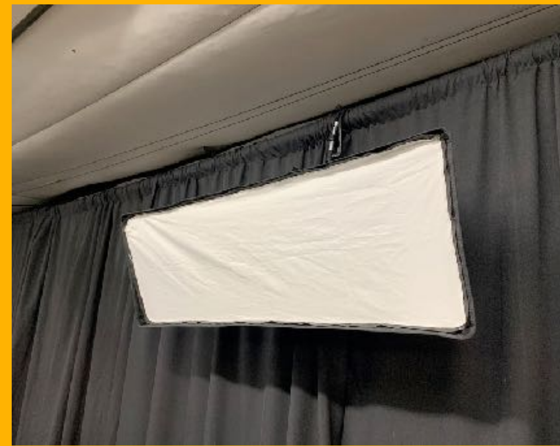
WESTCOTT SIDES SOFTBOX