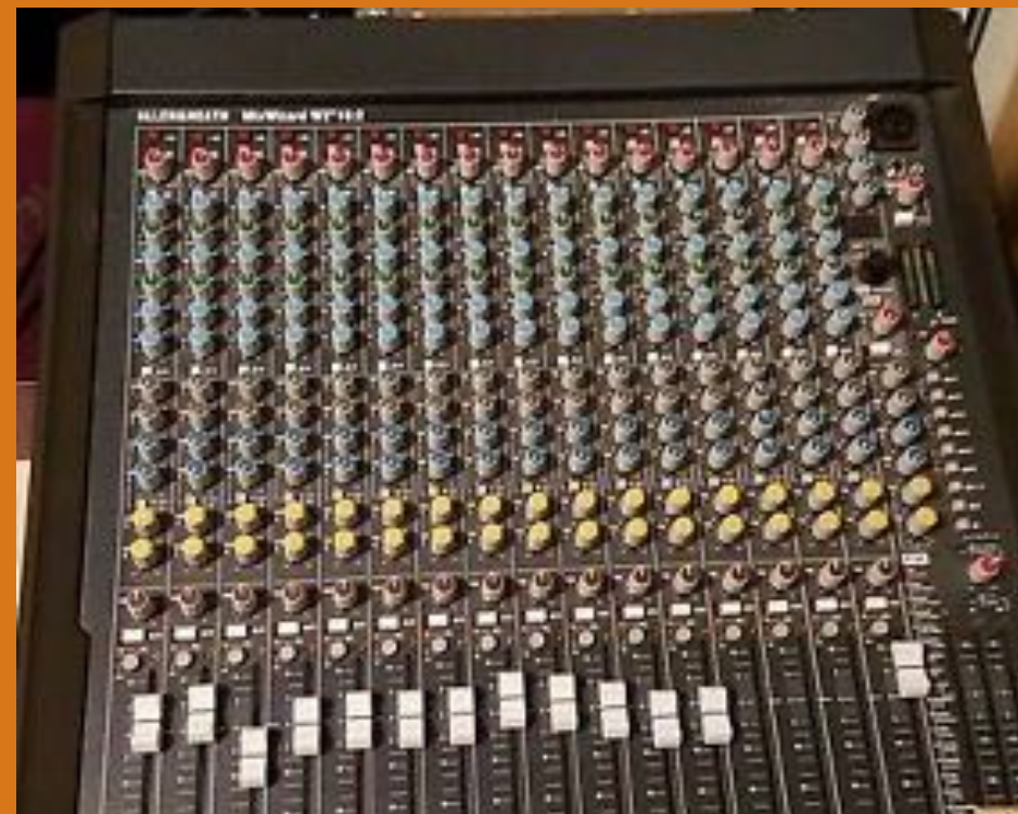
ALLEN & HEATH WZ4162