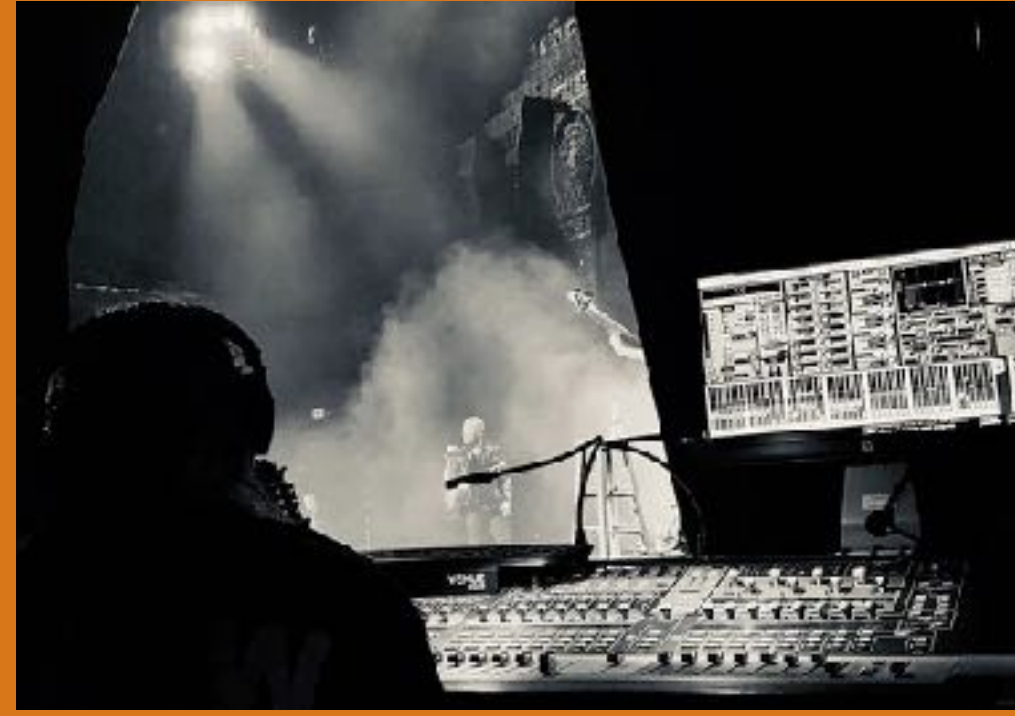
AVID VENUE SC48