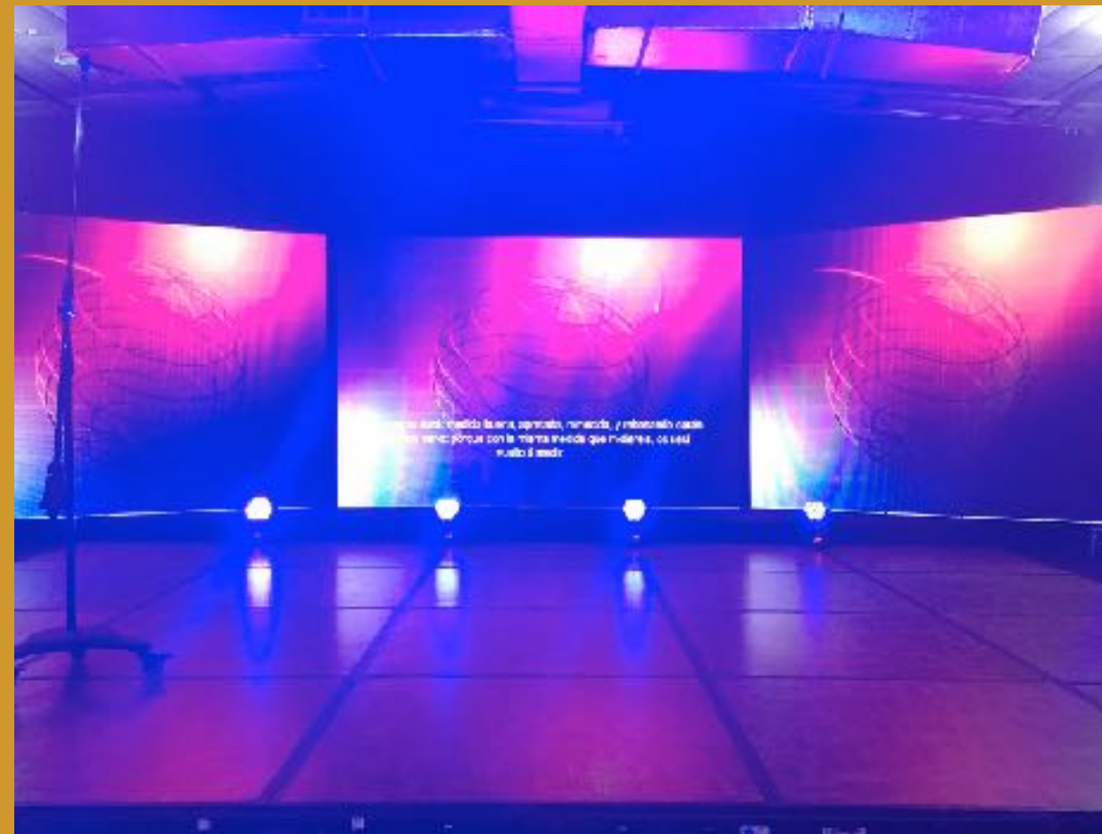
P 4.8 SCREEN