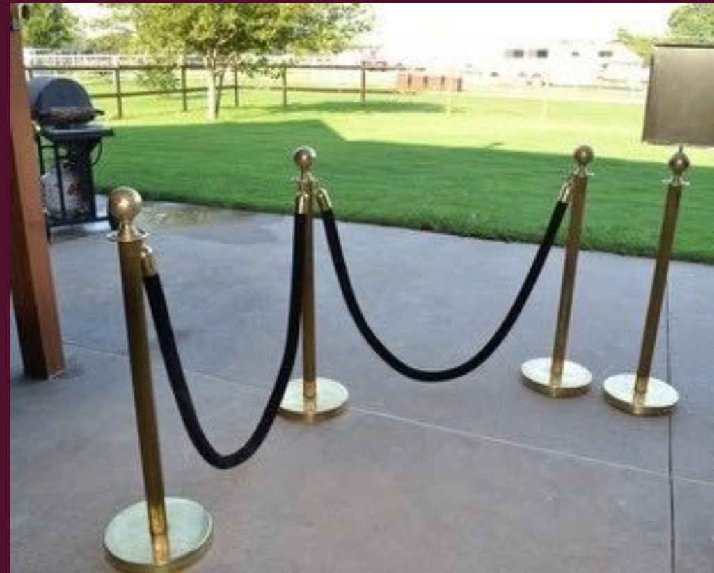
BRASS STANCHION POSTS

Excellent to combine with our tents, we provide the best quality in rental of patio mushroom heaters! For outdoor and indoor