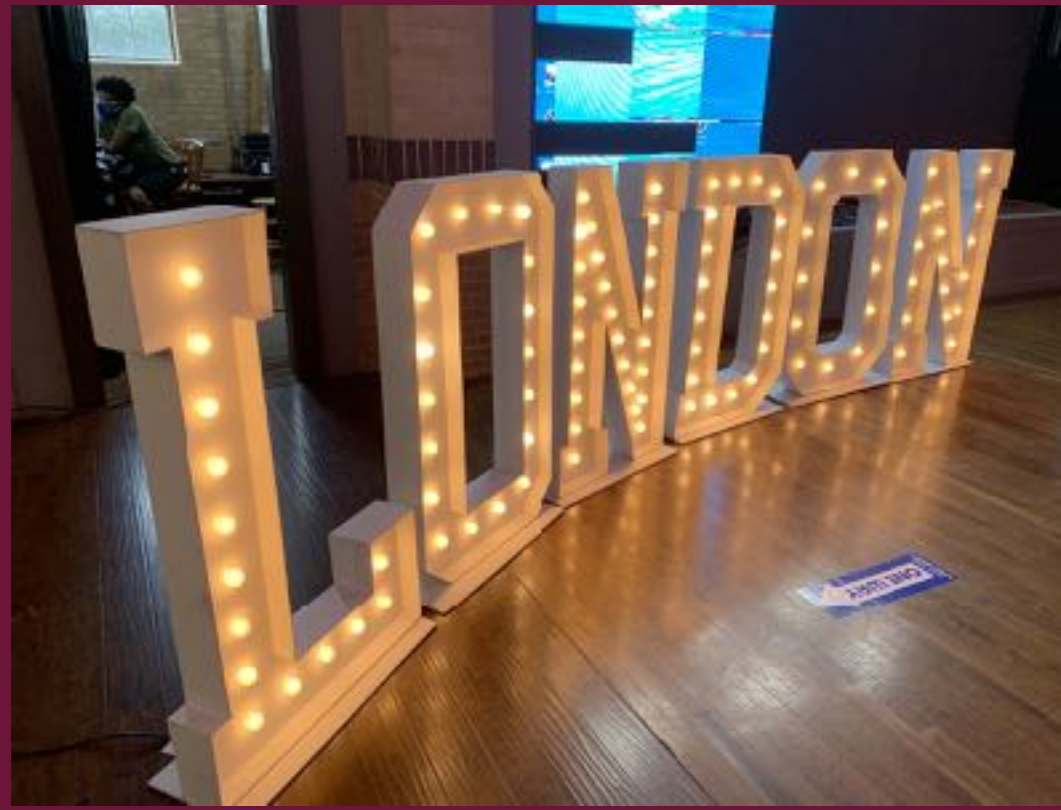
GIANT LIGHT LETTERS

Rental of big letter signs for all your events, parties, concerts and more. Lets put some caps on that name!