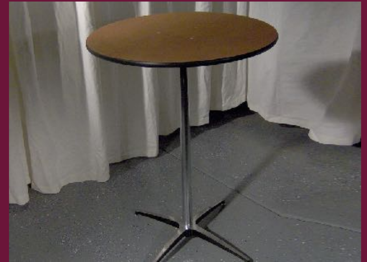
TABLES & CHAIRS

Rental of blankets, rugs, skirts and many other for all decoration of your event.