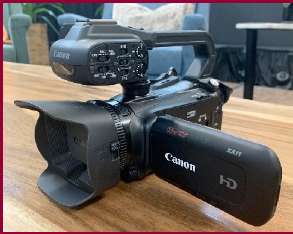
CANON XA11 CAMERA