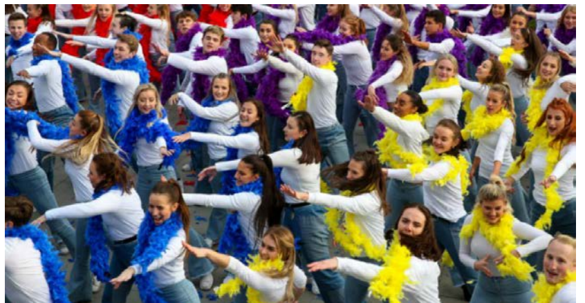
World record attempt for largest disco dance.

AT LEAST 7 PERFORMANCES ARE HAPPENING ON ANY GIVEN DAY