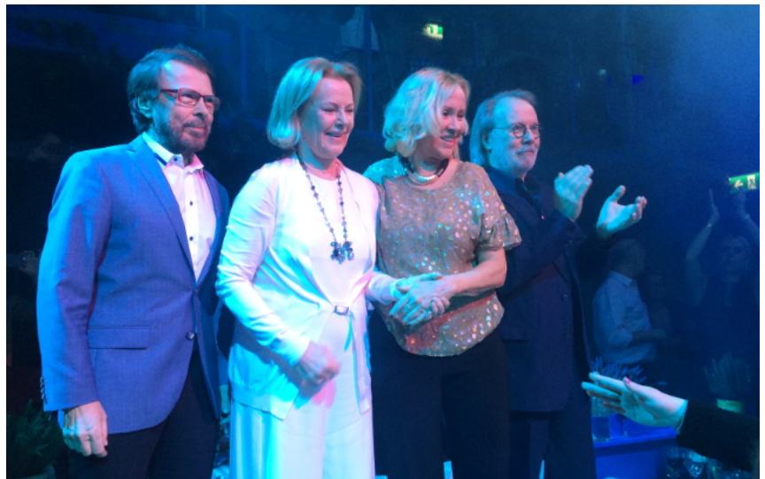
ABBA in 2016.

In the end, ABBA is known as one of the most commercially successful musical acts in the history of pop music. They are the first group from a non-English speaking country to achieve the success they did on the charts in English-speaking countries. They have released countless compilation and greatest hits albums, and their music continues to be wildly popular today. ABBA is so popular, in fact, that in 2018 they announced they