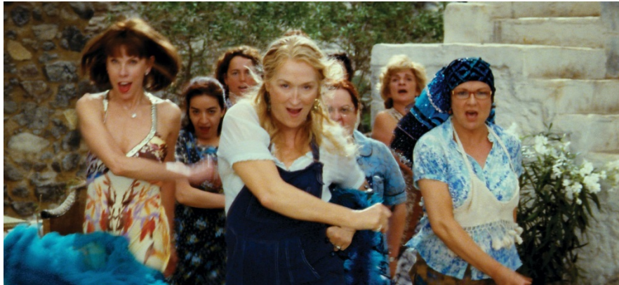
Mamma Mia! film cast.

Mamma Mia! was the brainchild of producer Judy Craymer—in 1983, she met with Benny Andersson and Björn Ulvaeus, who were working on another musical, Chess . Their ABBA hit “Winner Takes All” inspired Craymer to think about the theatrical nature of ABBA’s music. Several years later, Craymer commissioned the book writer, Catherine Johnson, to join what would become Mamma Mia! , along with director Phyllida Lloyd. Together they created this “jukebox musical”—so named because it compiles existing songs to create a story.