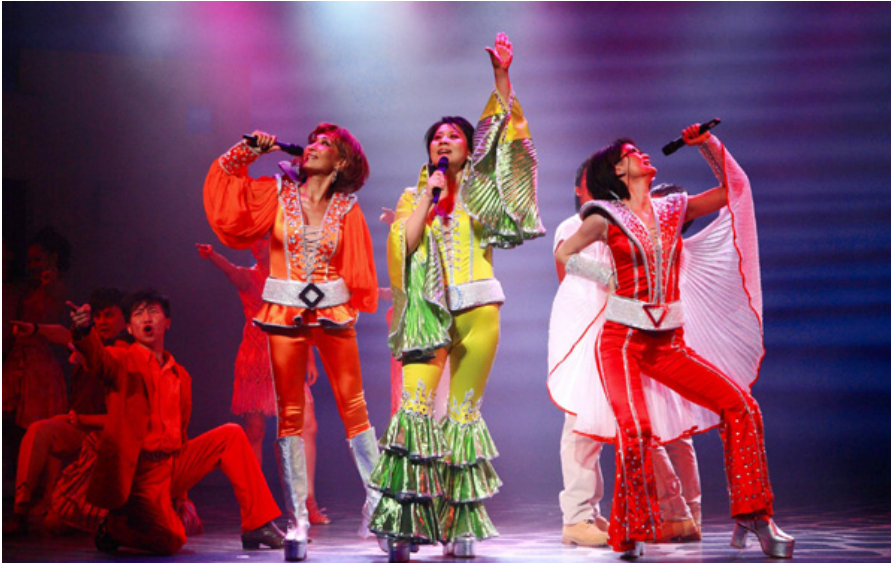
Mamma Mia! in Beijing.

PERFORMED IN OVER 440 MAJOR CITIES, IN 40 COUNTRIES, ON 5 CONTINENTS