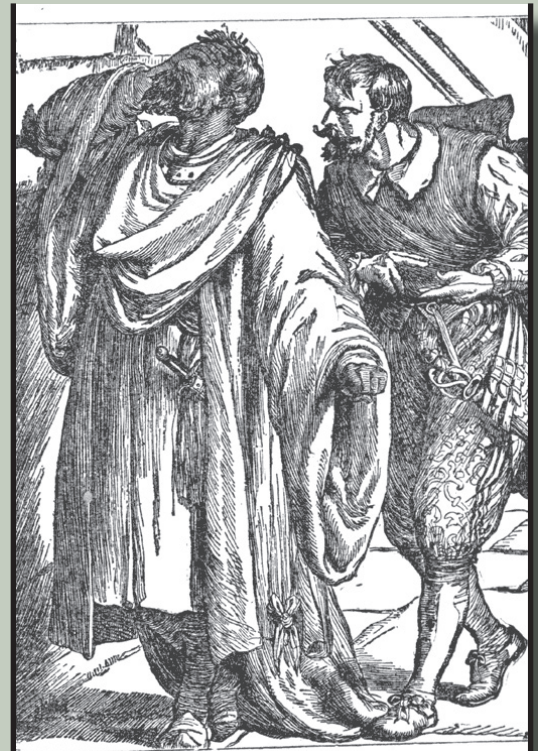
Iago raises suspicions in Othello.

Not long afterwards the Moor deprived the Corporal of his rank for having drawn