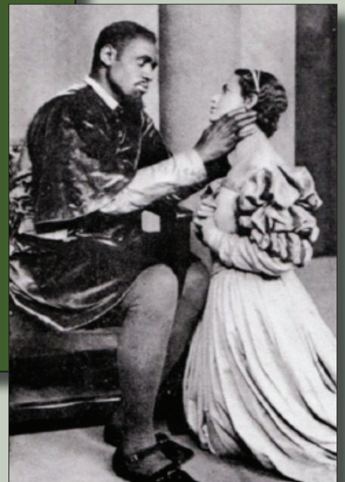
Left: Promotional artwork for Edmund Kean as Othello. Right: Paul Robeson and Peggy Ashcroft as Othello and Desdemona.

PAUL ROBESON's performance as Othello in 1943 was considered a novelty at the time, and brought people from all walks of life to the theatre. He was the first black American actor to perform the role, which had traditionally been reserved for white actors in heavy make-up. Robeson described the play as "a tragedy of honor rather than jealousy."