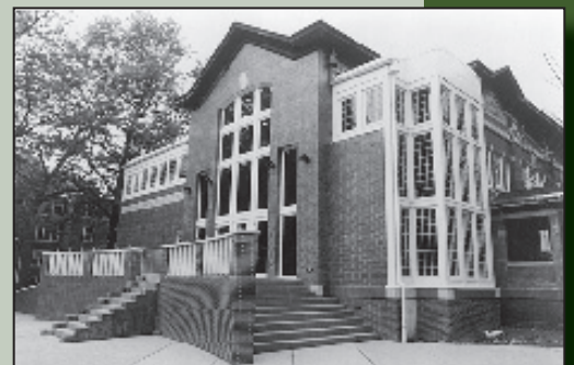
The Shakespeare Theatre of New Jersey's Main Stage