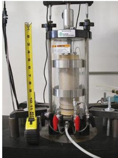
Figure 6E-1.03: Resilient Modulus

The purpose of using seasonal modulus is to qualify the relative damage a pavement is subject to during each season of the year and treat it as part of the overall design. An effective road bed soil modulus is then established for the entire year which is equivalent to the combined effects of all monthly seasonal modulus values. AASHTO provides different methodology to obtain the effective M_R for flexible pavement only. The method that was selected for use in this manual was based on the determination of M_R values for six different climatic regions in the United States that considered the quality of subgrade soils.