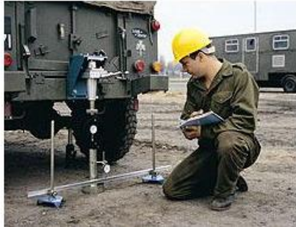
Figure 6E-1.01: In-situ CBR