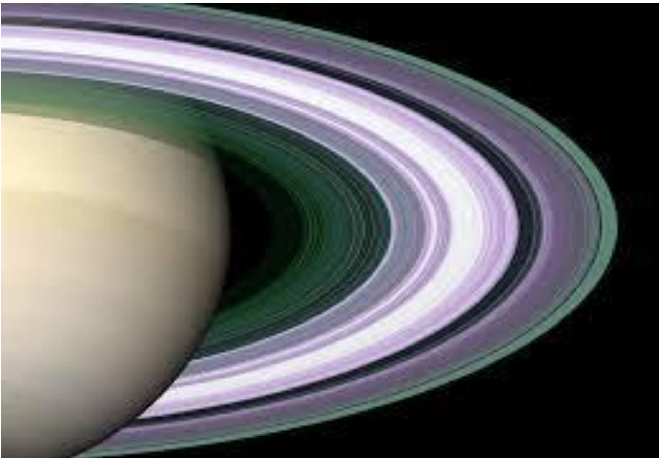
Saturn's rings (reference page 8)