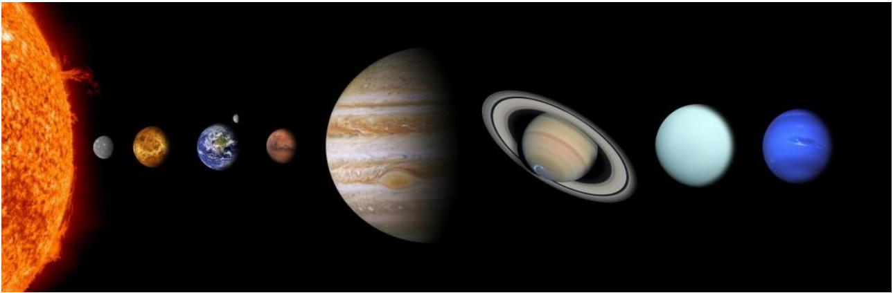
Solar System planets (reference page 7)