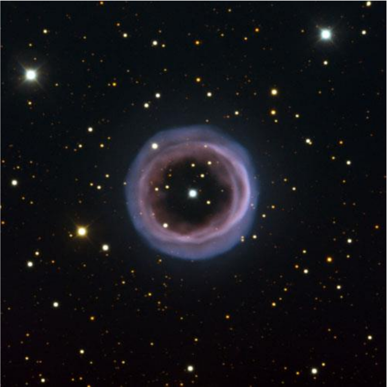
Fine Ring Nebula — captured here by the ESO Faint Object Spectrograph and Camera mounted on the New Technology Telescope at the La Silla Observatory in Chile. (reference page 10)