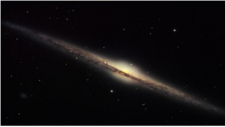
spiral galaxy (reference page 3)