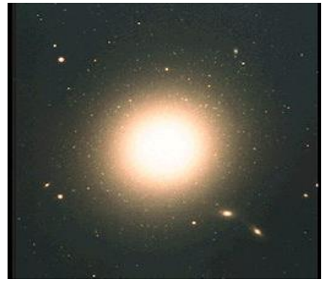
elliptical galaxy (reference page 9)