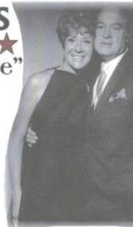
Kaye Stevens & Bob Hope

★ A Tribute to all Veterans ...In Songs, Stories & Video TUESDAY JULY 21, 2009 7:00P.M. Church on the Square The Villages FL